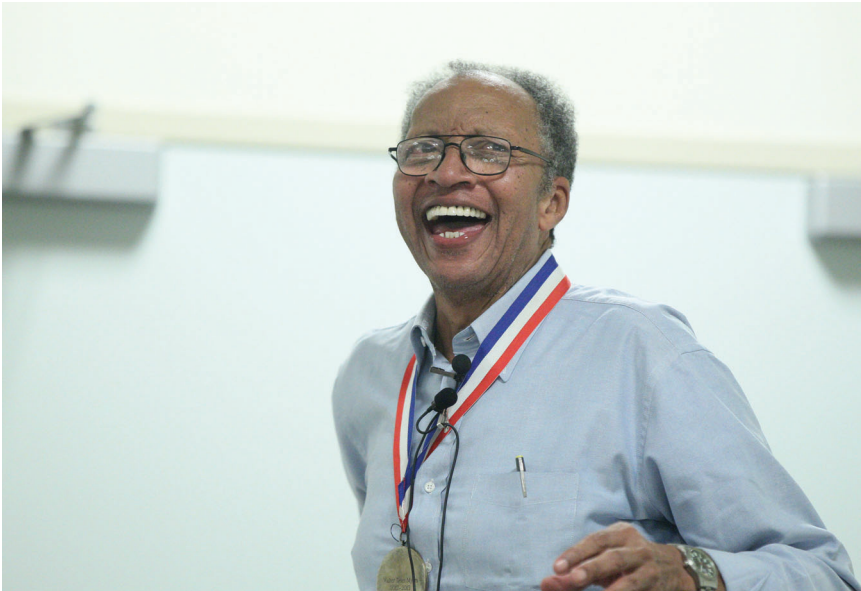
Walter Dean Myers