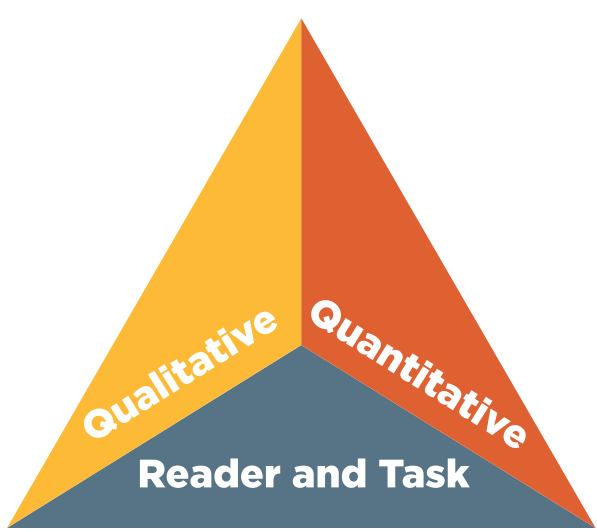
Figure 1 The Common Core's Three-Part Model of Text Complexity

Step 1: Gather Quantitative Information, such as Lexiles, but also Mean Log Word Frequency (MLWF) and Mean Sentence Length (MSL) as described in Module 2.