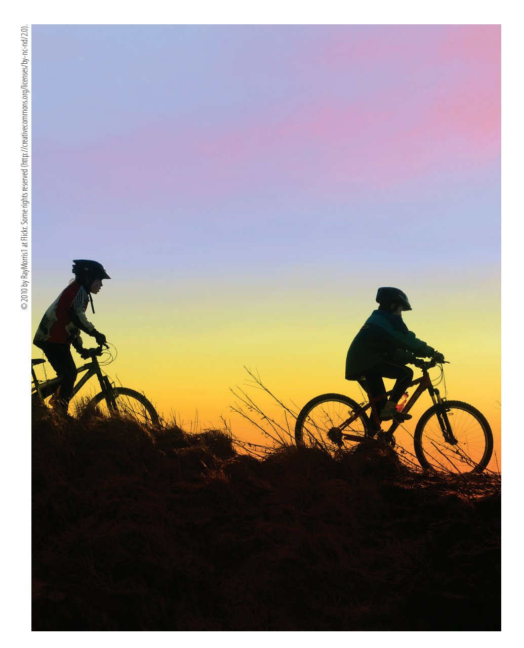
After school, my friend and I ride our bikes. After an hour, it is too dark and we go inside.