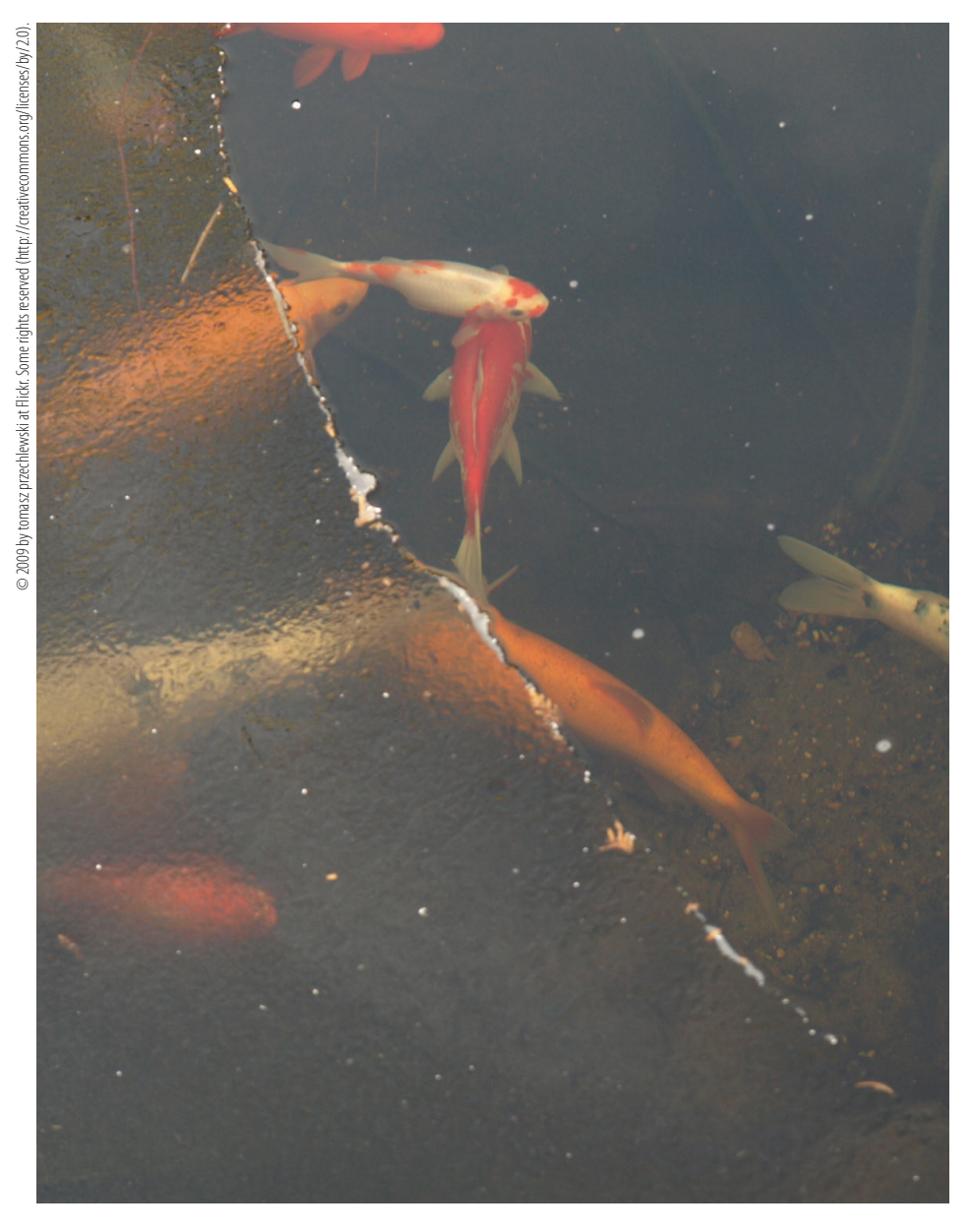
Under the ice, fish still swim in the water. The fish eat plants or bugs that are also under the ice.

Winter is so cold in some places that the lakes freeze. But only the top part of the lake freezes.