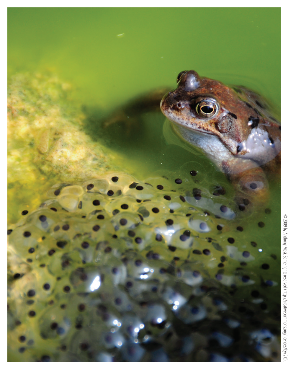
In the spring, frogs lay their eggs in water. The eggs need to stay wet. That is why frogs lay their eggs in water.