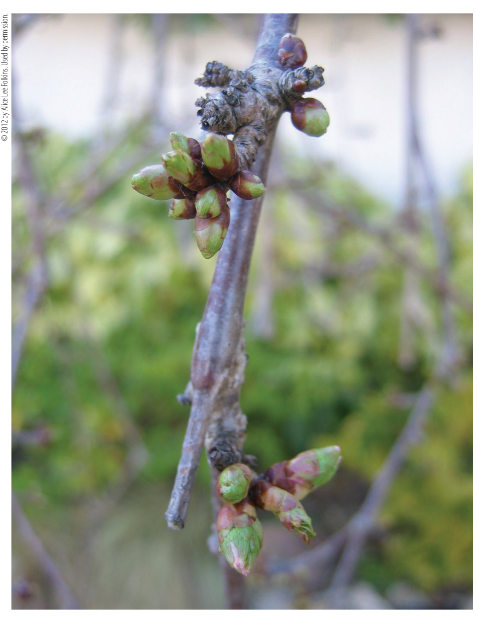
Now it is spring. There are tiny buds on the cherry trees. Soon, many of these tiny buds will open up into tiny flowers.

Last summer, we picked cherries from our tree. We loved eating the cherries. But all winter long, the cherry tree has had no leaves and no cherries.