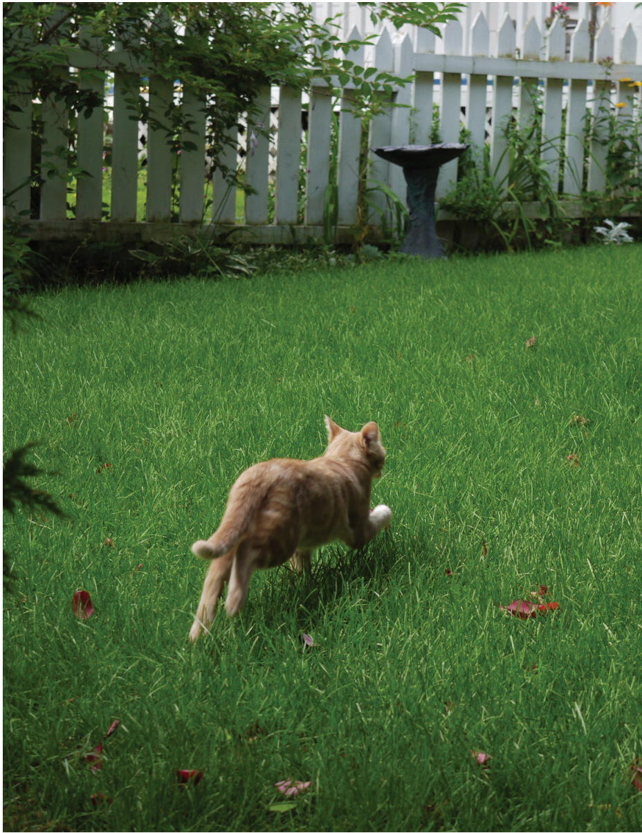
Image © 2009 Steve in enFlickr. Some rights reserved ( http://creativecommons.org/licenses/by-nd/2.0 ).