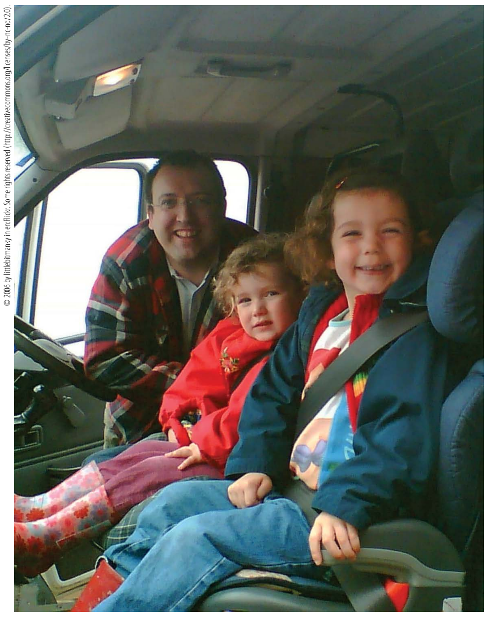
She comes to school in a white van. She likes to ride in the white van.