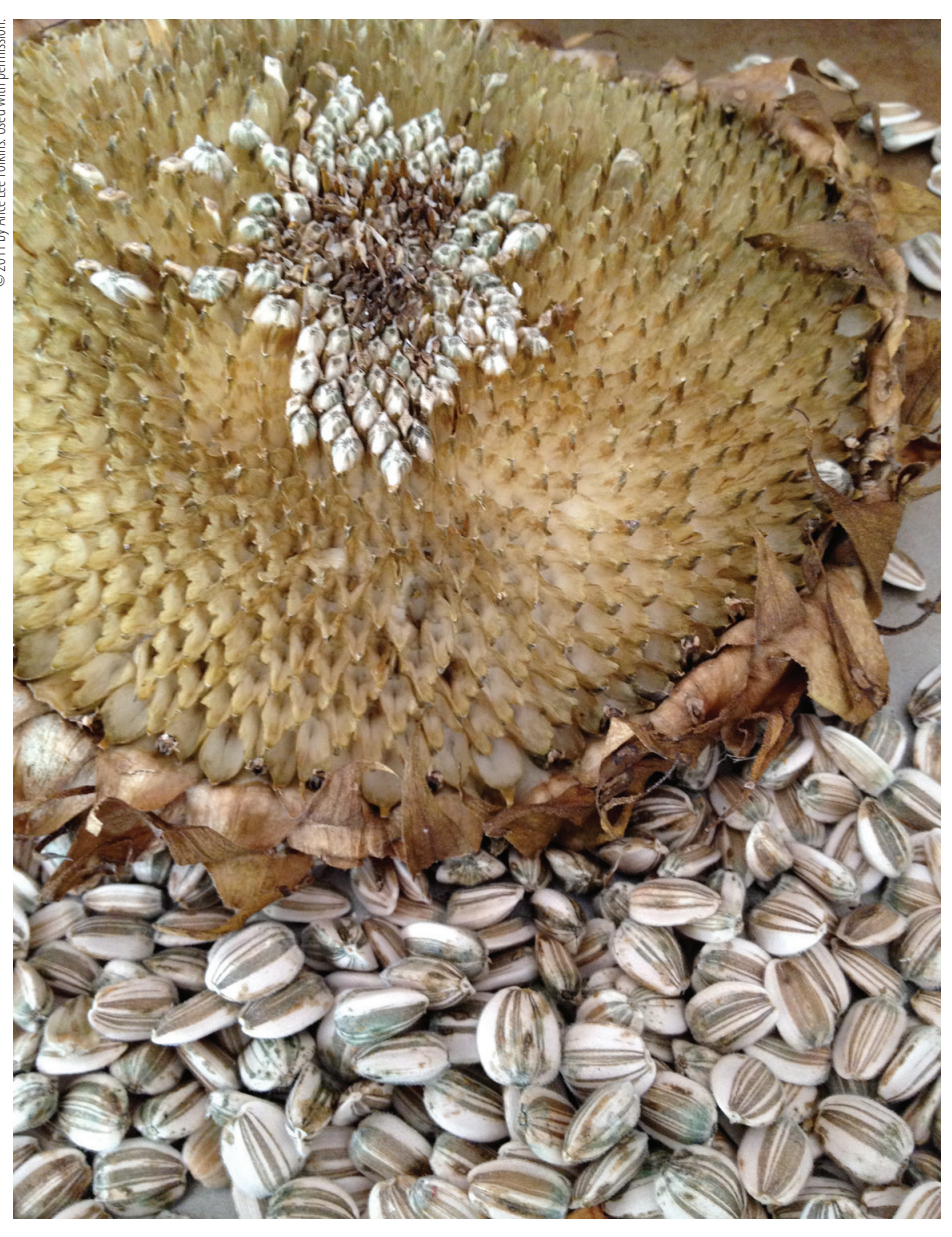
The seeds of the sunflower can be kept to plant next summer. But you can also bake the sunflower seeds. You can have the baked seeds for a snack.

Sunflowers can grow very tall. Sunflowers can grow to be five or six feet tall.