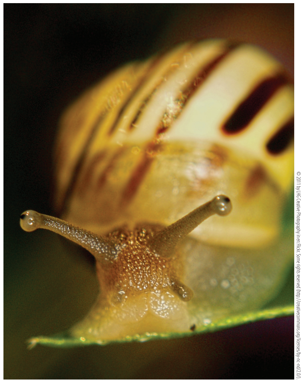
Some snails have two eyes. Other snails have more than two eyes. But all snails have their eyes on top of stalks.