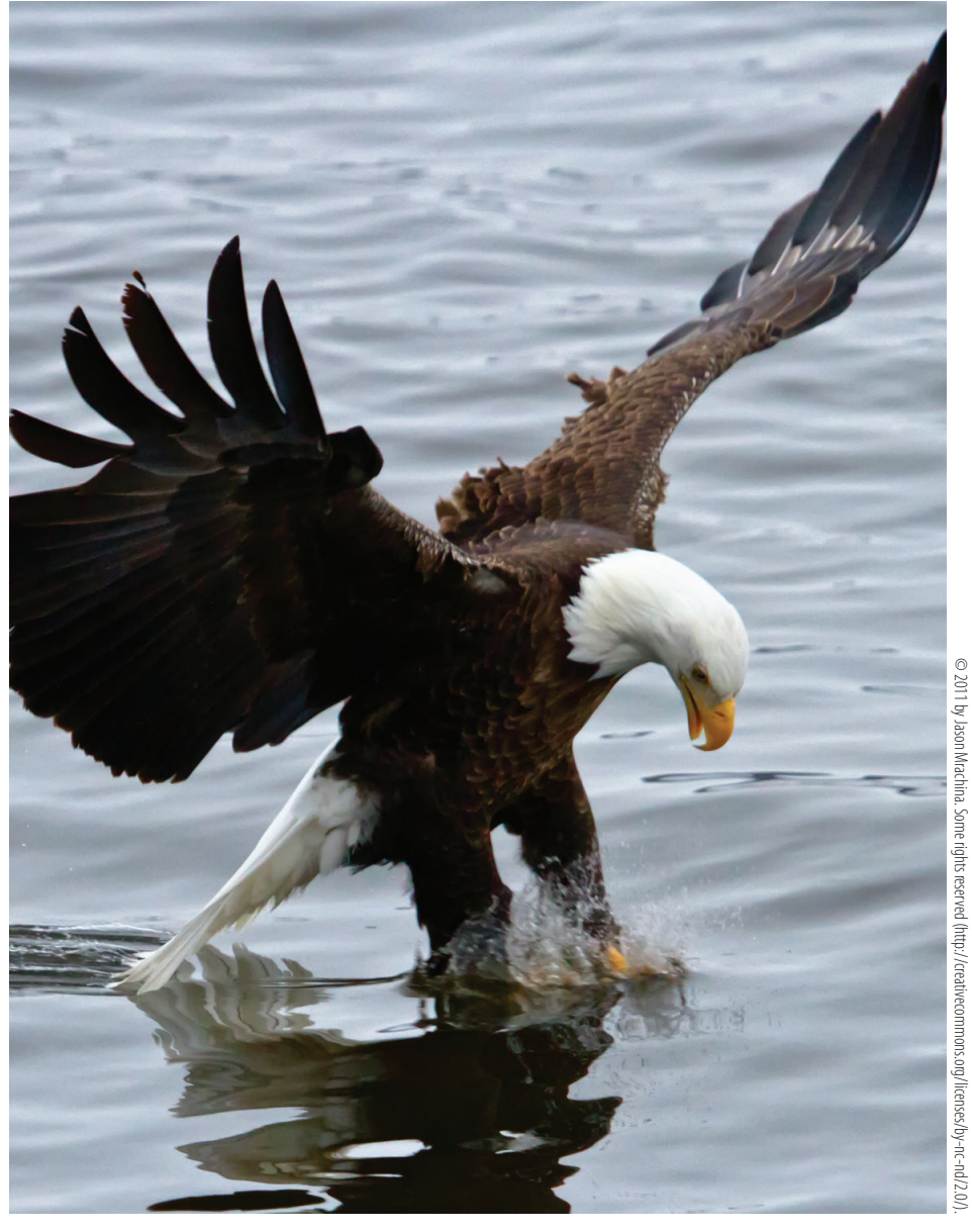
An eagle uses its eyes to find food to eat. It can see the fish.