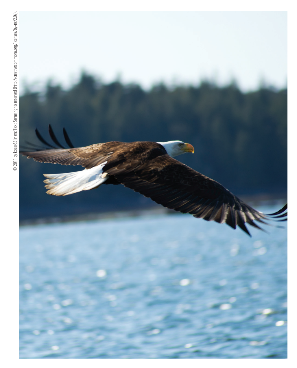
No, an eagle cannot smell a fish from high in the sky.

An eagle flies high in the sky. It is looking for food to eat. Can an eagle smell a fish as it flies high in the sky?