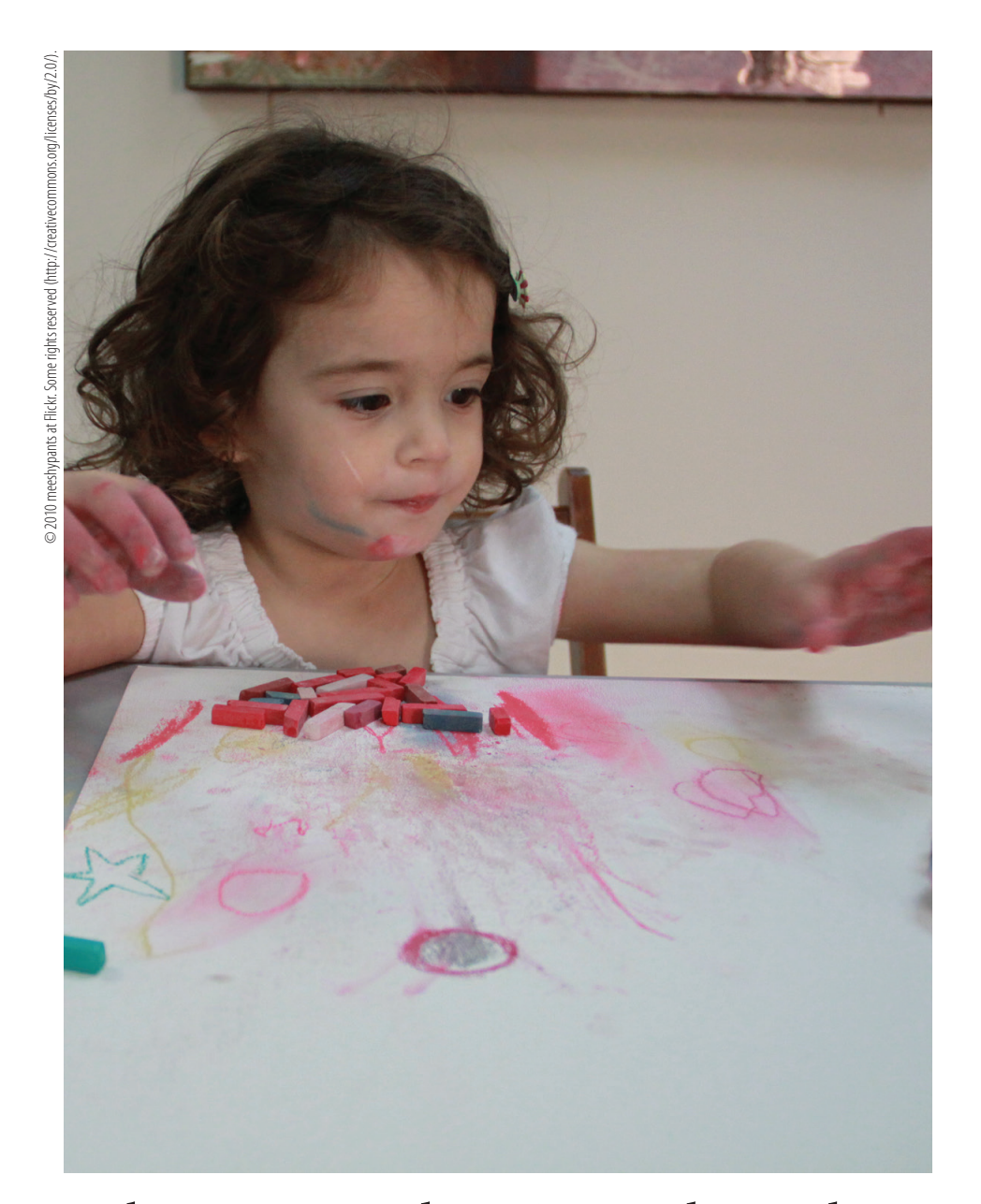
Where is my red pen? I need it to draw a picture of my red ball. I like to play with my red ball.