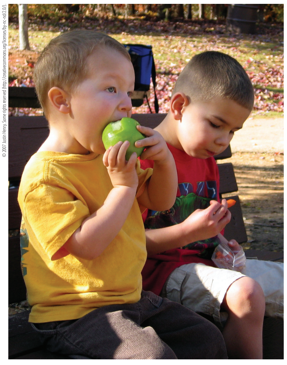
My friend likes to eat apples. I asked if he would like an apple. He said yes! I have one apple left.

I had three apples when I went to school today. I gave one apple to my teacher. I have two apples left.