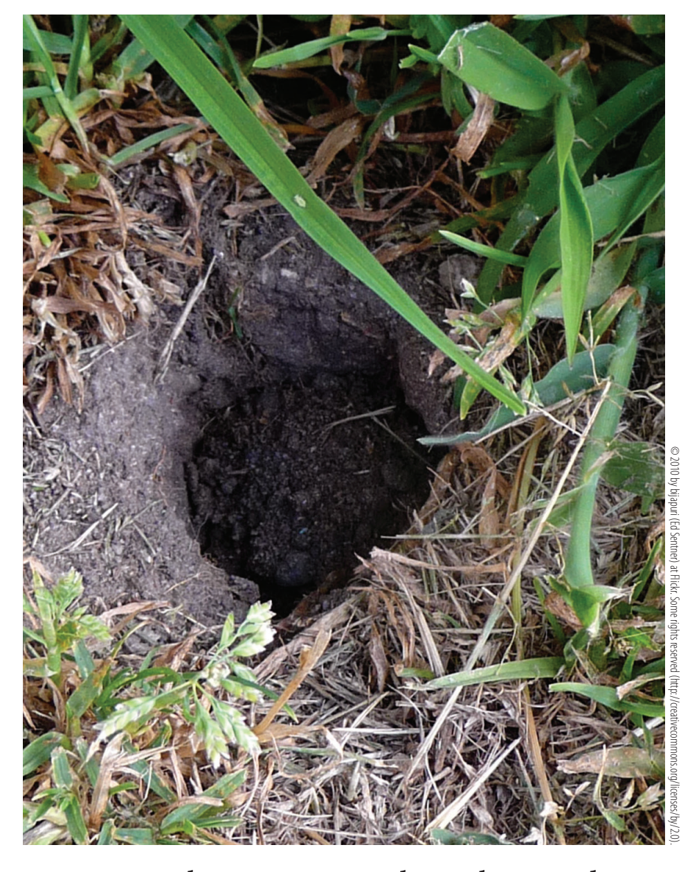
You might not see a mole in the woods. That is because moles spend most of their lives underground.