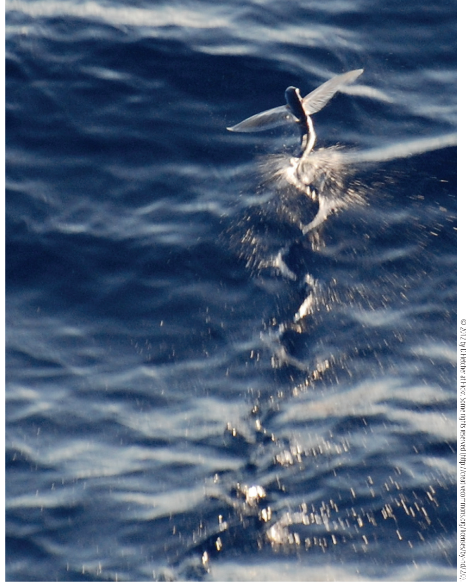
A flying fish can leap out of the water when a bigger fish tries to catch it. It looks like the fish is flying!