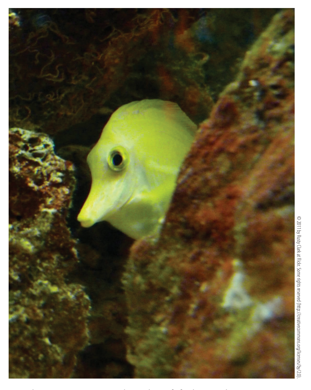
There are many kinds of fish in the ocean. Some fish are small and hide among the rocks. But that is not the only place where fish can hide.