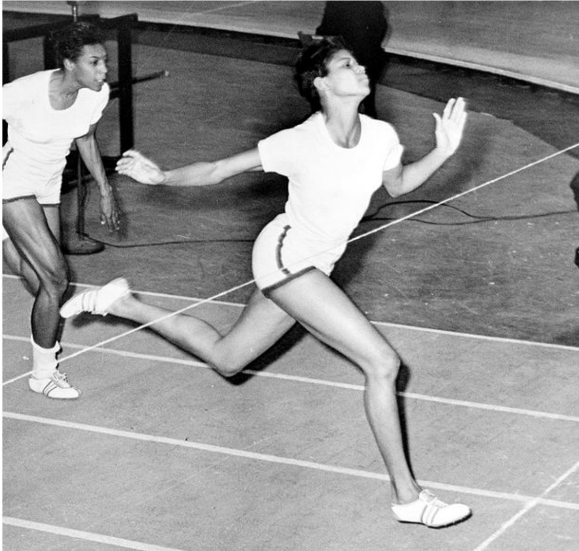
Photo: Wilma Rudolph at the finish line during 50 yard dash at track meet in Madison Square Garden. 1961.