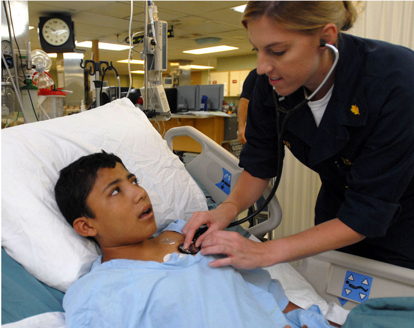
Photo: An intensive care unit nurse, checks the vital signs of patient, while he recovers after surgery aboard a hospital ship. Acajuta, El Salvador. July, 2007.