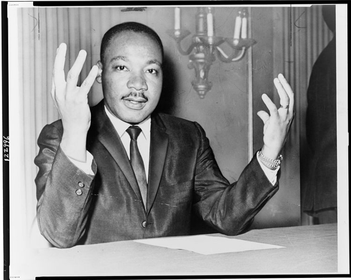
Photo: Rev. Martin Luther King during a press conference. November, 1964.