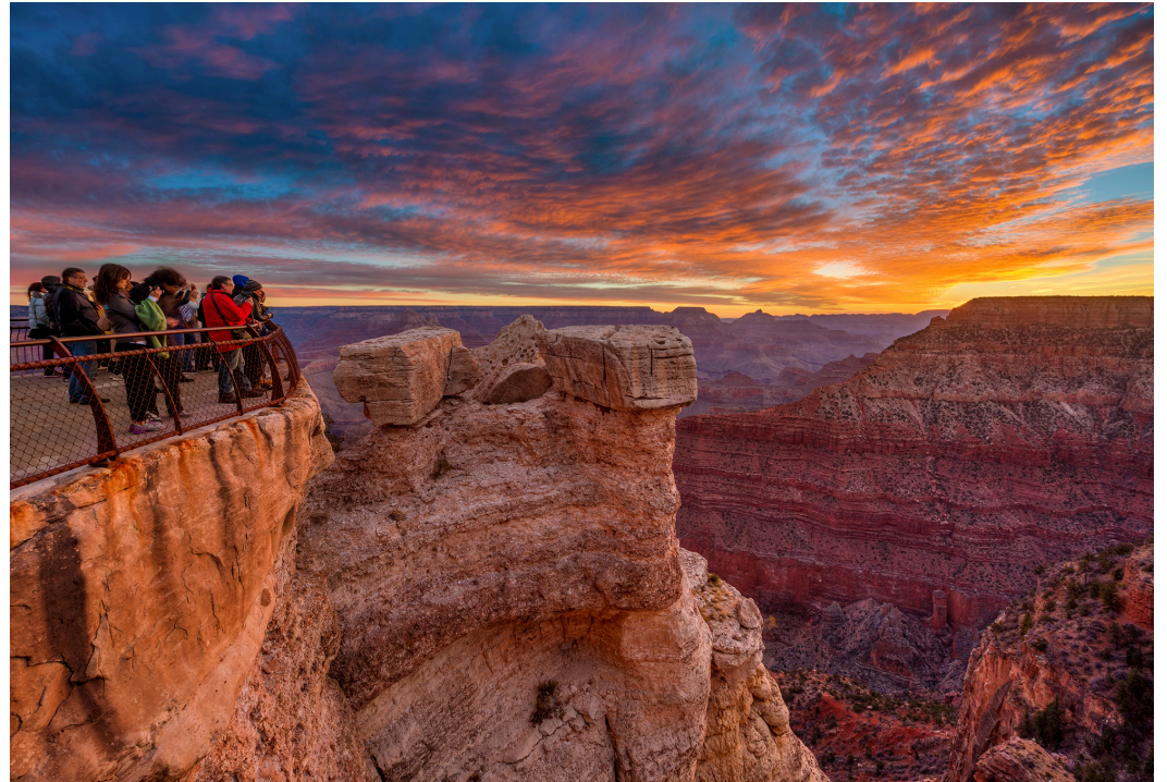
The Grand Canyon