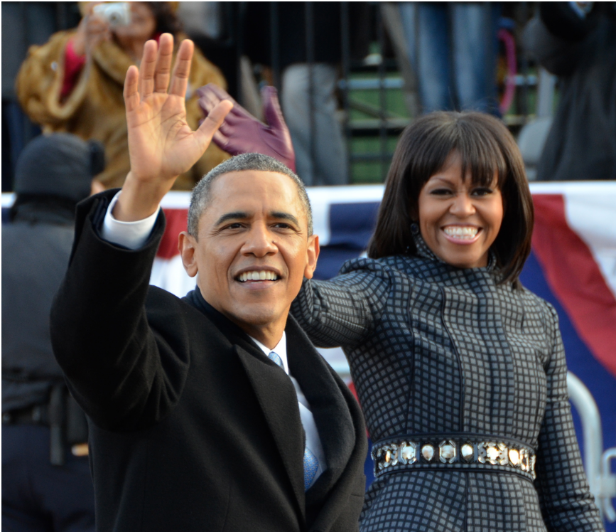
President Barack Obama and First Lady Michelle Obama