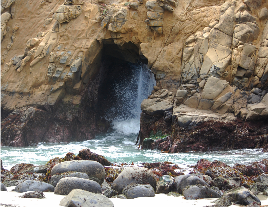
Above: a cave in a cliff.

A cave is a hole under the ground or in the side of a hill or cliff.