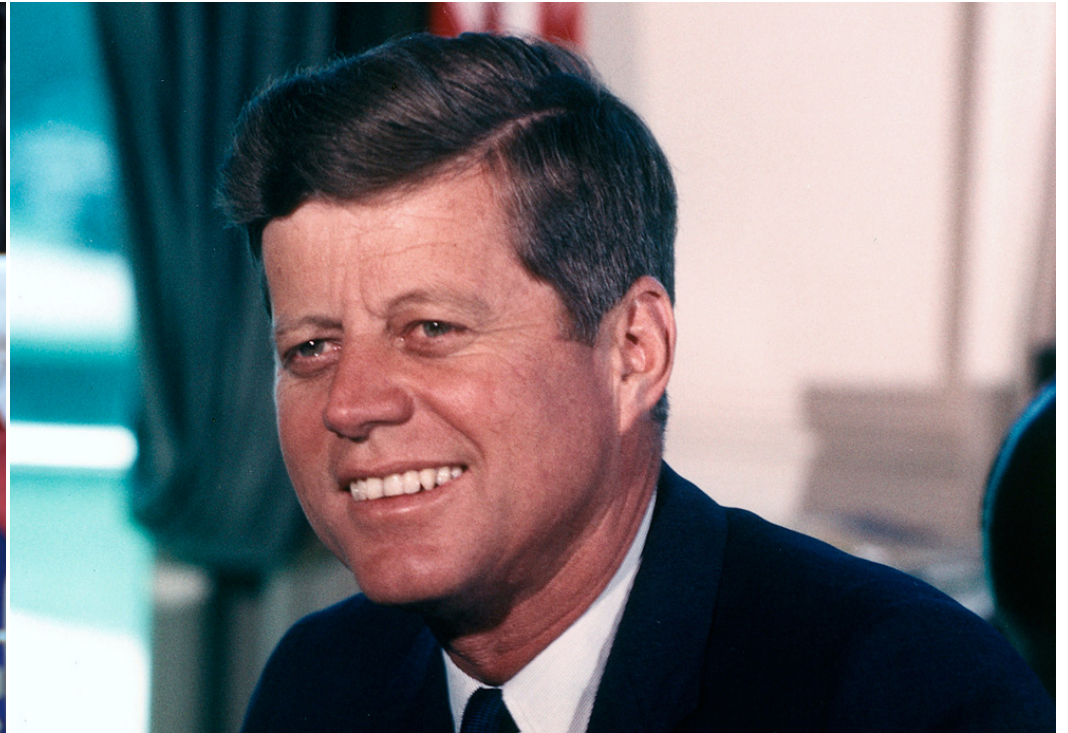
President John F. Kennedy