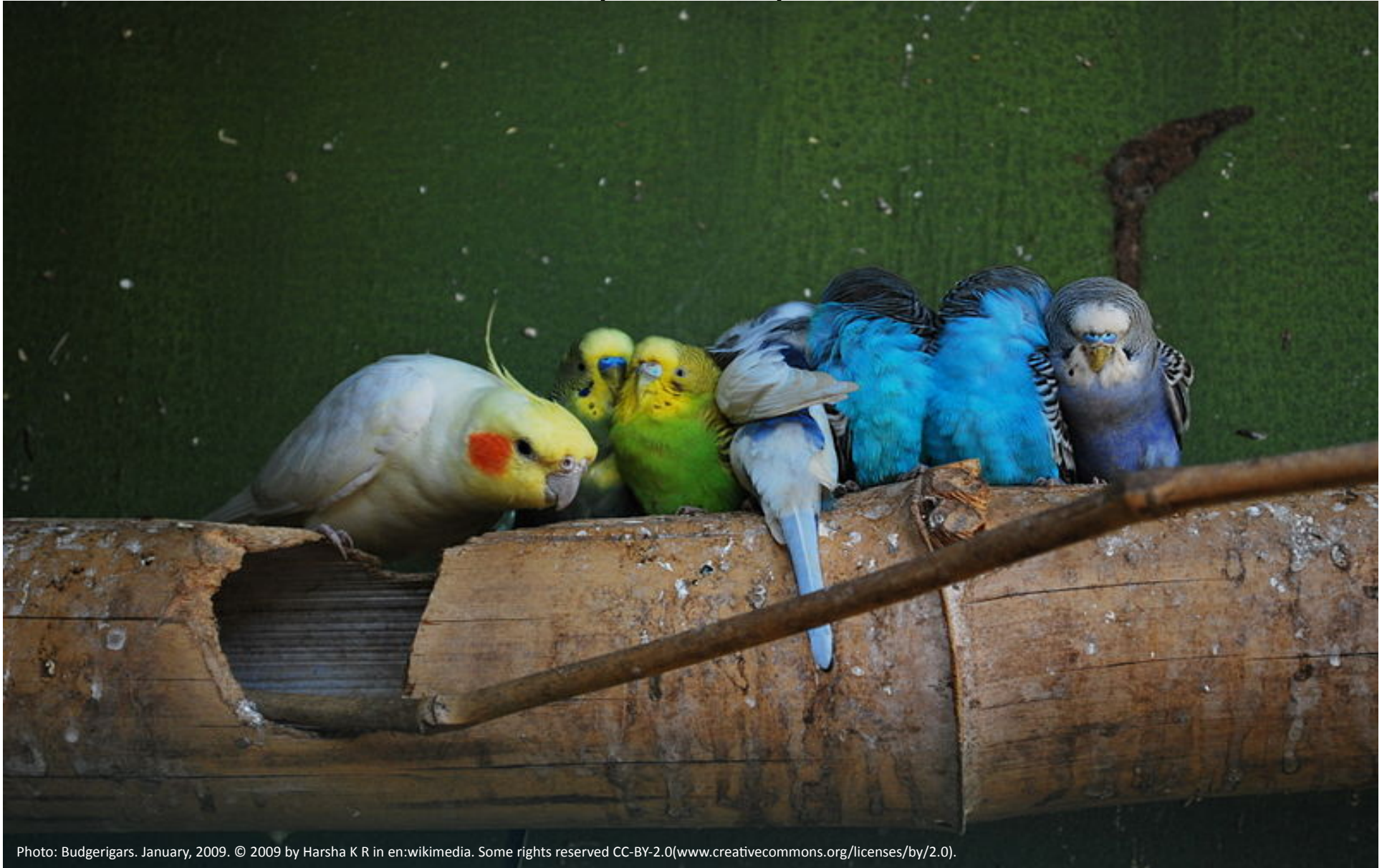
Photo: Budgerigars. January, 2009. © 2009 by Harsha K R in en:wikimedia. Some rights reserved CC-BY-2.0( www.creativecommons.org/licenses/by/2.0 ).