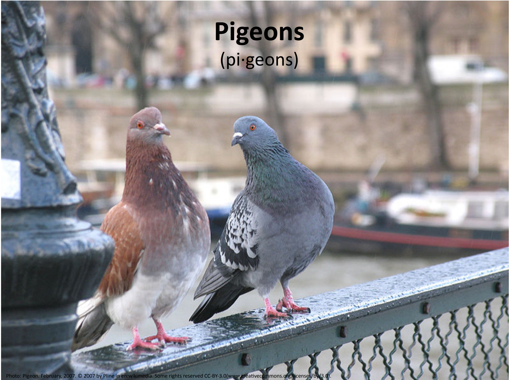
Photo: Pigeon. February, 2007. © 2007 by Pline in en:wikimedia. Some rights reserved CC-BY-3.0( www.creativecommons.org/licenses/by/3.0 ).