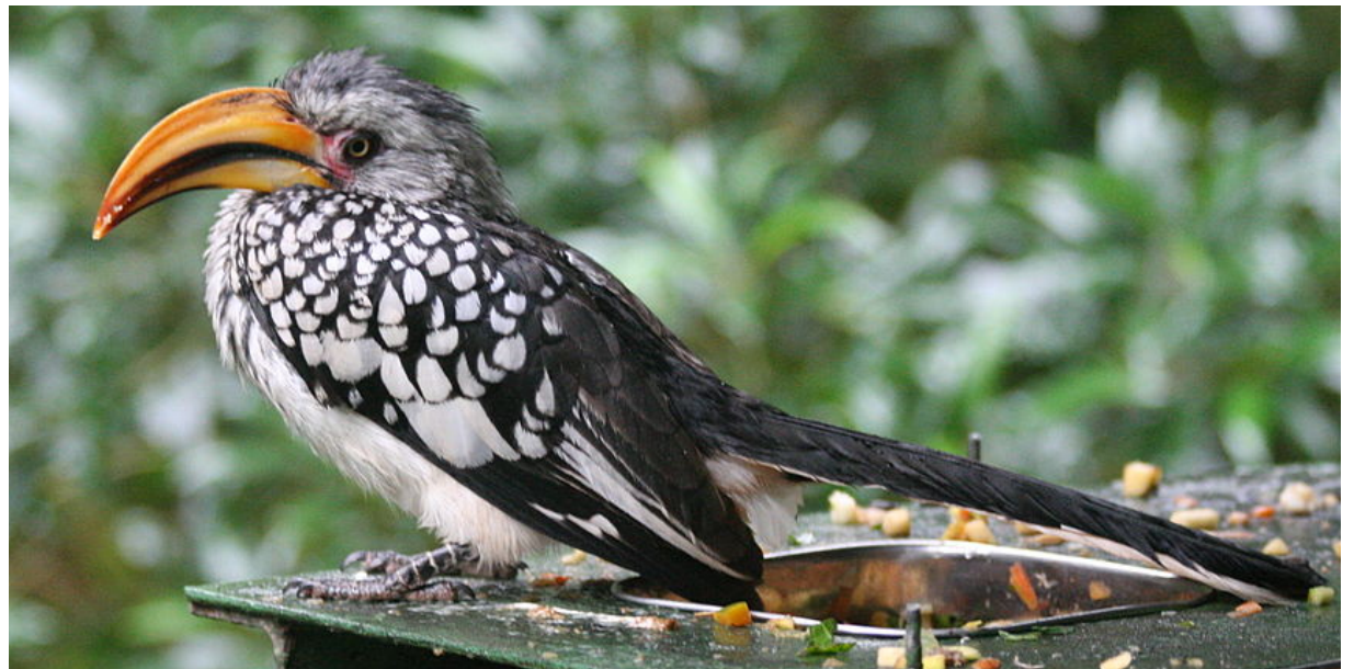
Photo: Southern Yellow-billed Hornbill at Birds of Eden, Plettenberg, South Africa. May, 2006. ©2006 by Graham. Some rights reserved CC-BY-SA-2.0 ( www.creativecommons.org/licenses/by-sa/2.0 ). Photo: Larosterna inca , Walsrode Zoo, Germany. September, 2010. ©2010 by Dennis Irrgang. Some rights reserved CC-BY-2.0 ( www.creativecommons.org/licenses/by/2.0 ).