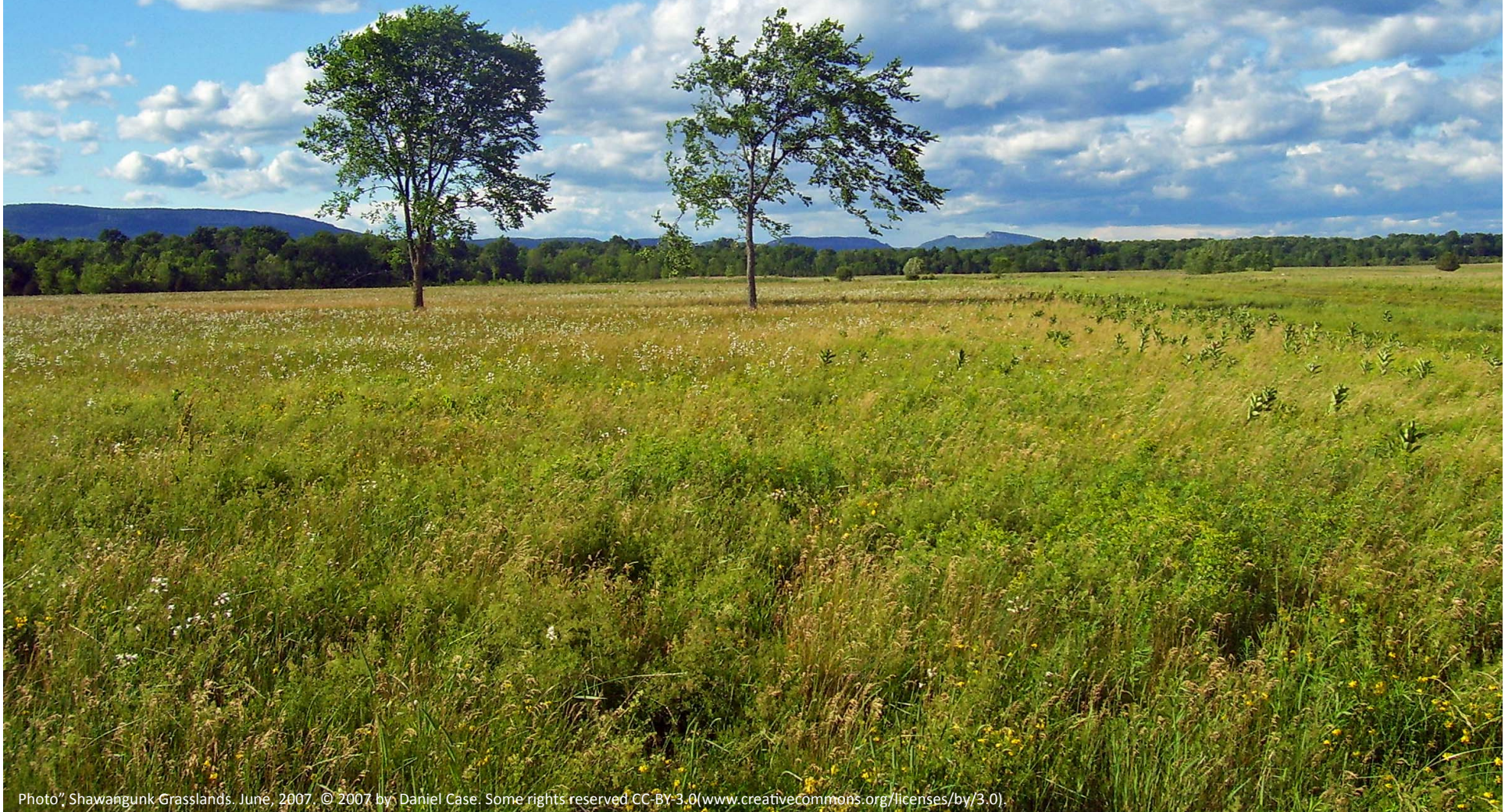
Photo: Shawangunk Grasslands, June, 2007. © 2007 by Daniel Case. Some rights reserved CC-BY 3.0 ( www.creativecommons.org/licenses/by/3.0 ).