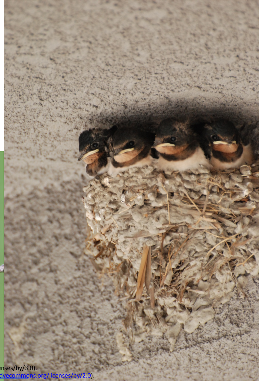
Photo: Barn swallow. March, 2008. © 2008 by JJ Cadiz, Cajay. Some rights reserved CC-BY-3.0( www.creativecommons.org/licenses/by/3.0 ).

Right photo: Barn swallow in nest. May, 2008 . © 2011 by Kuribo in en:wikimedia. Some rights reserved CC-BY-2.0( www.creativecommons.org/licenses/by/2.0 ).