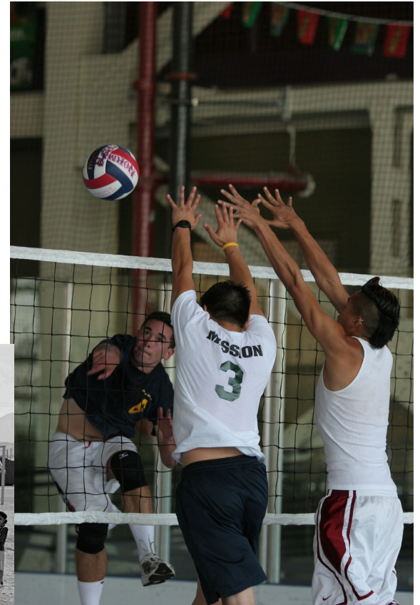
Photo: Volleyball game. Photo: Volleyball, Manzanar Relocation Center. Photo: Spike, Block, Kill.