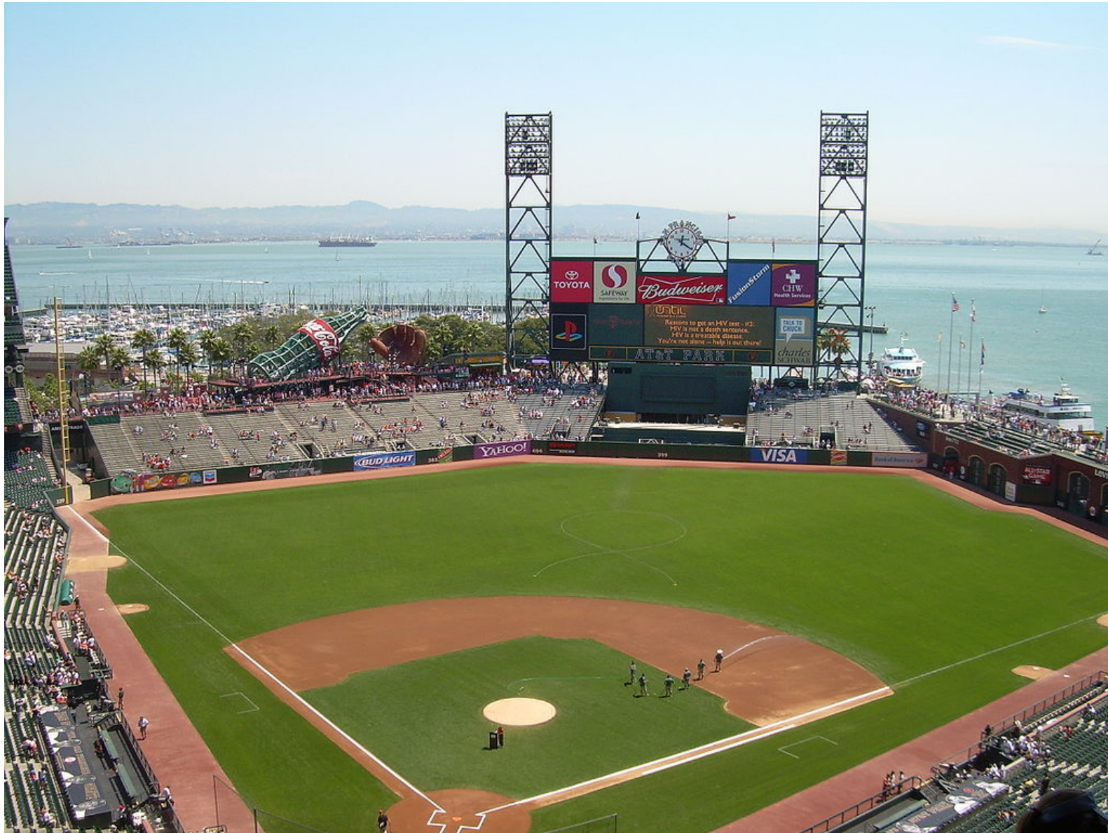
Photo: AT&T park. July, 2006. ©2006 by Coasttocoast in en:Wikipedia. Some rights reserved http://creativecommons.org/licenses/by-sa/3.0/