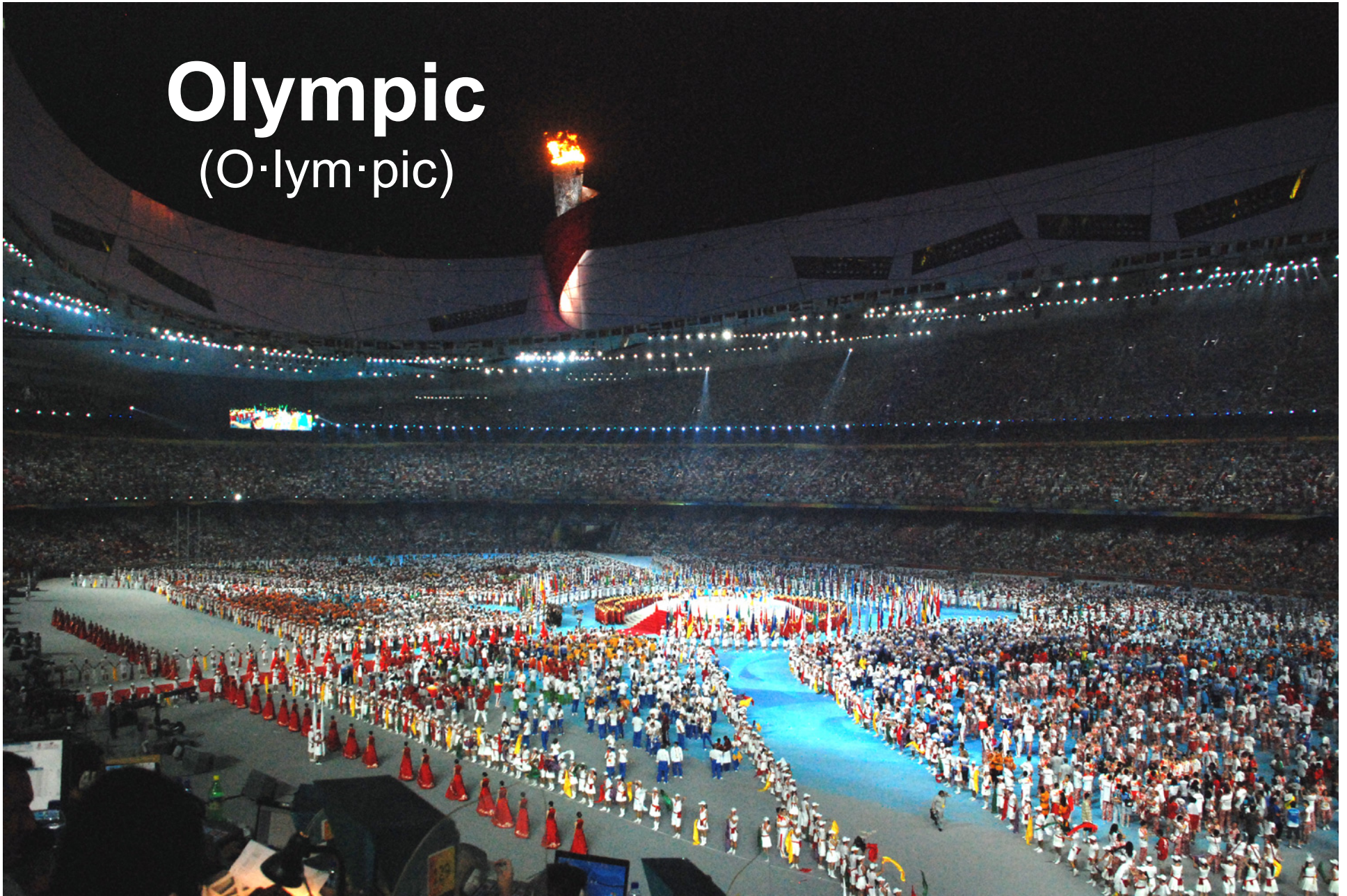
Photo: The Bird's nest, Beijing, during the closing ceremony of the 2008 Olympic Games. ©2008 by Jmex at en:wikipedia. Some rights reserved. GNU Free Documentation License and Creative Commons Attribution-Share Alike 3.0 Unported, 2.5 Generic, 2.0 Generic, and 1.0 Generic.