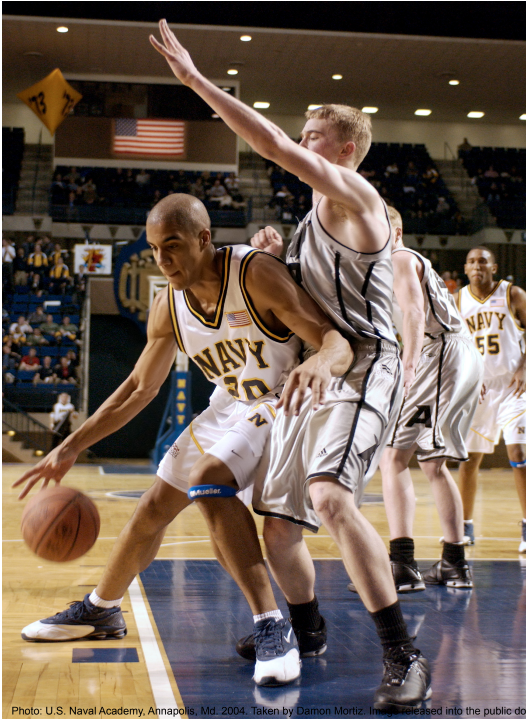
Photo: U.S. Naval Academy, Annapolis, Md. 2004.