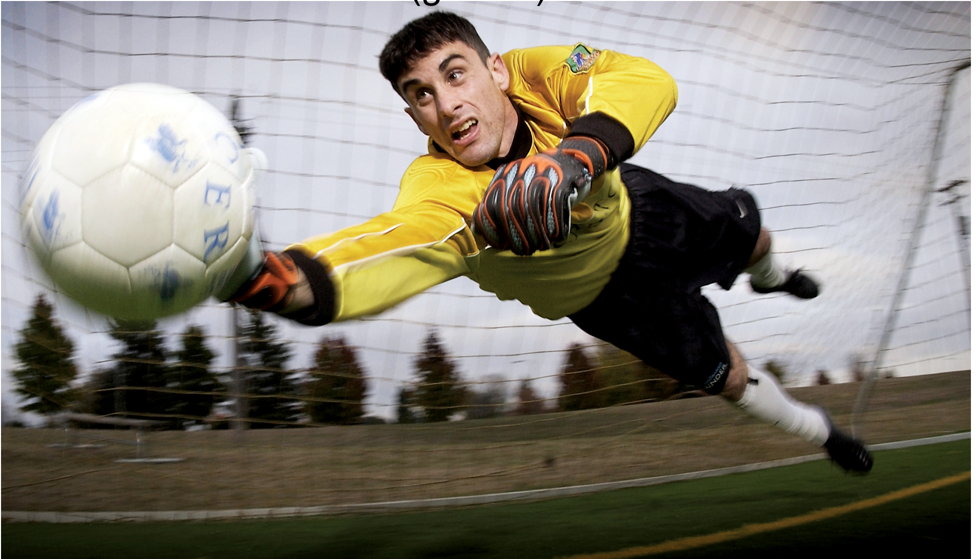
Photo: U.S. Naval Academy, Annapolis, Md. 2004. Taken by Damon Mortiz. Image released into the public domain by United States Navy.