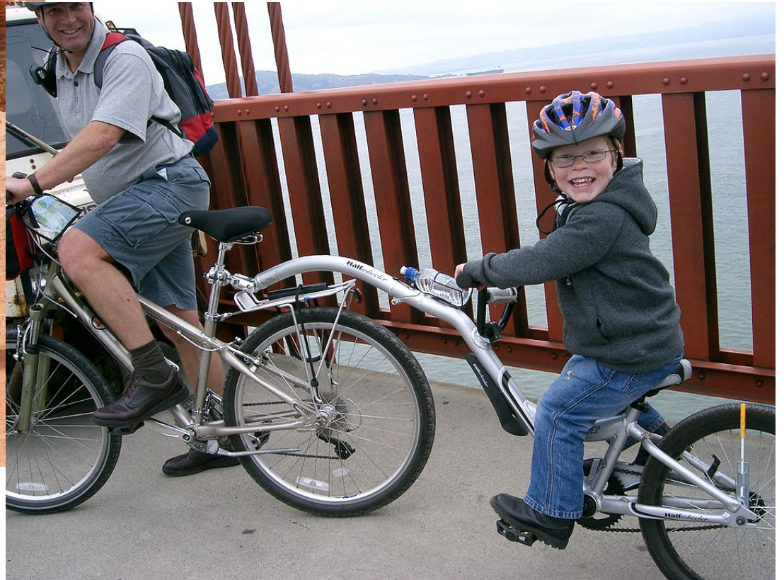
Photo: Half Wheeler "is a kids bike that hooks up to an adult bike to help teach kids to balance" - San Francisco - Golden Gate Bridge, May 2007.

Photo: Person mit Fahrrad, Ouagadougou. February 2007.