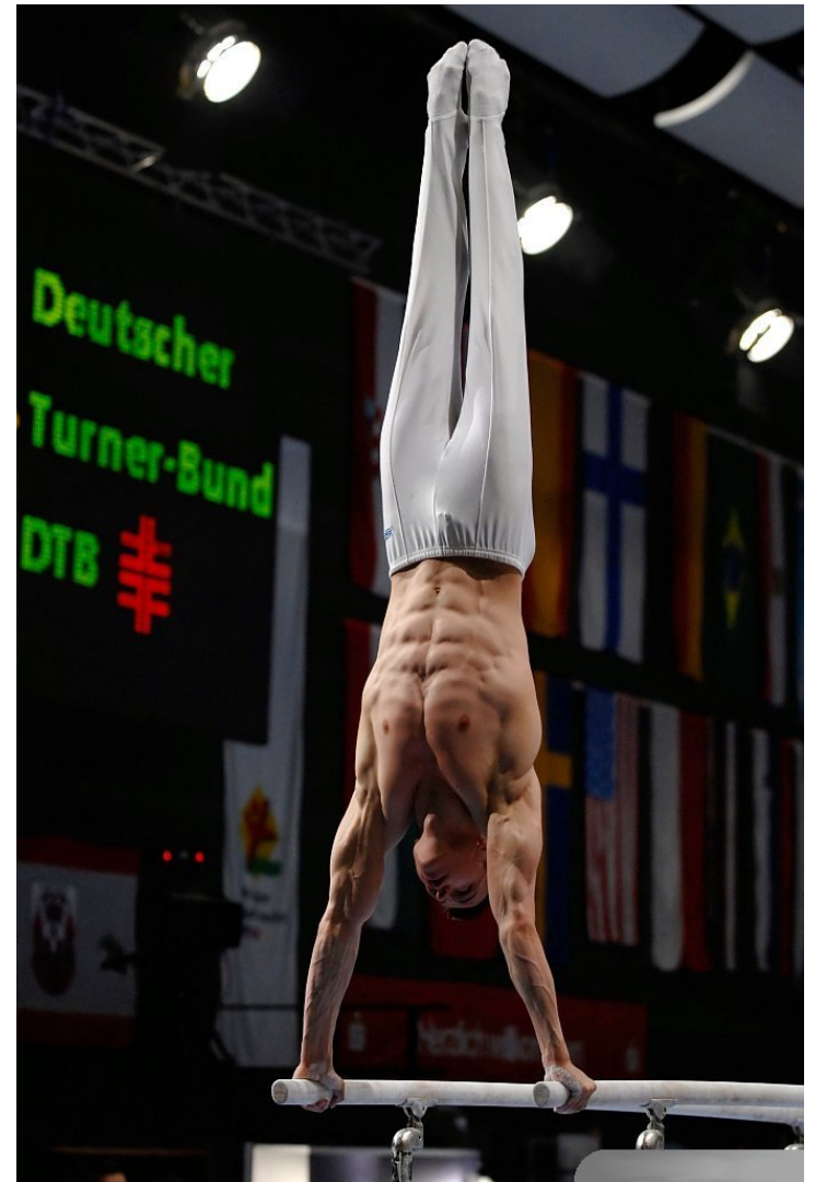
Photo: Turnier der Meister 2006, Gymnastic World Cup at Cottbus (GER). ©2006 by Pan Pavel Rycl. Some rights reserved.

Photo: Double ring leap on floor exercise. ©2006 by Skubik at en.wikipedia. Some rights reserved. Creative Commons Attribution 3.0 Unported.