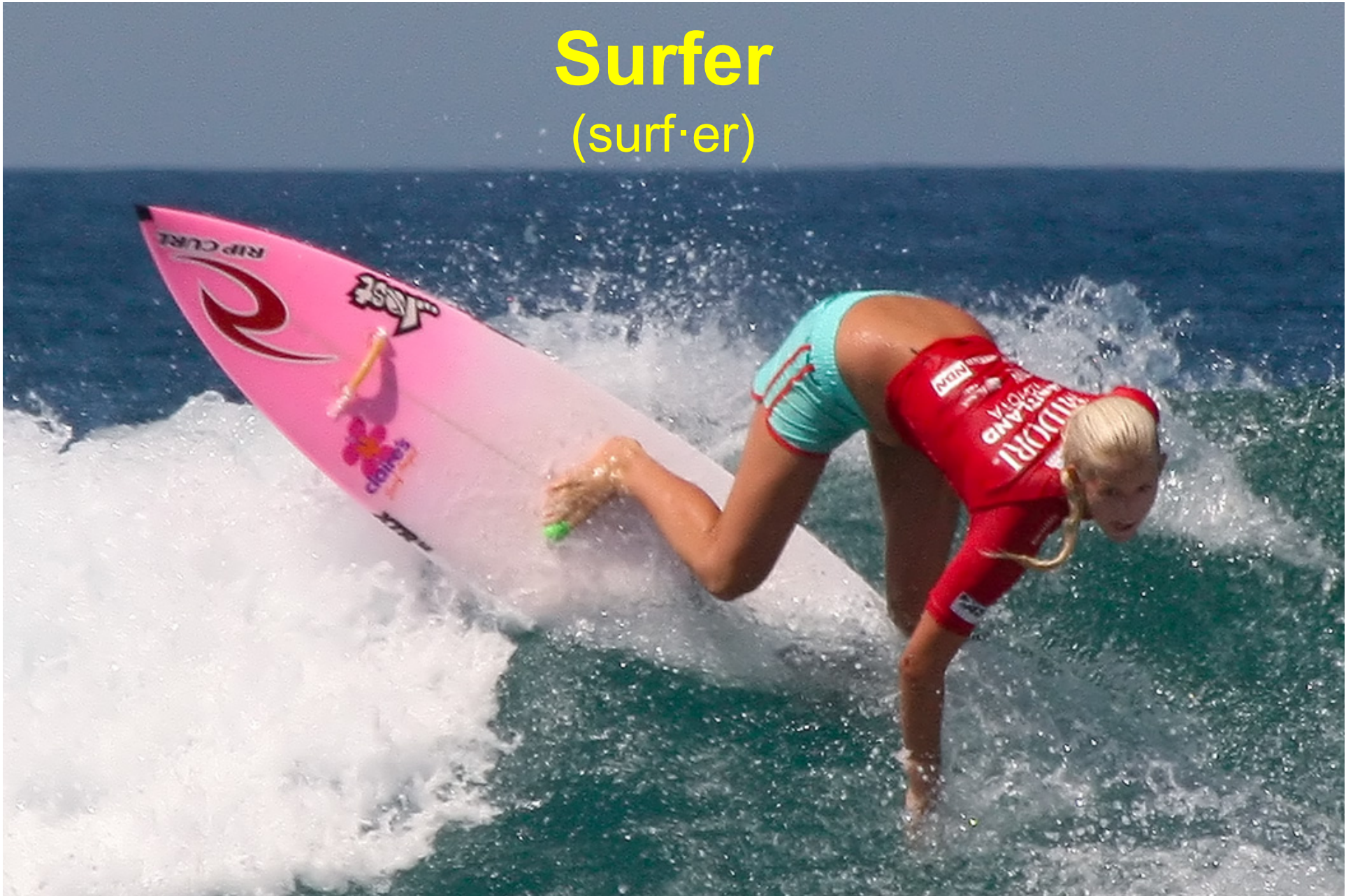
Photo: Bethany Hamilton, 2007. Image released into public domain by its author.