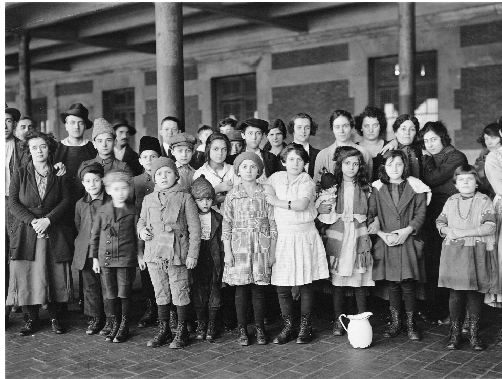
Photo: Immigrant children, Ellis Island, New York. Taken by Brown. This work is in the public domain in the United States because it was registered with the U.S. Copyrights Office or published before January 1, 1923.