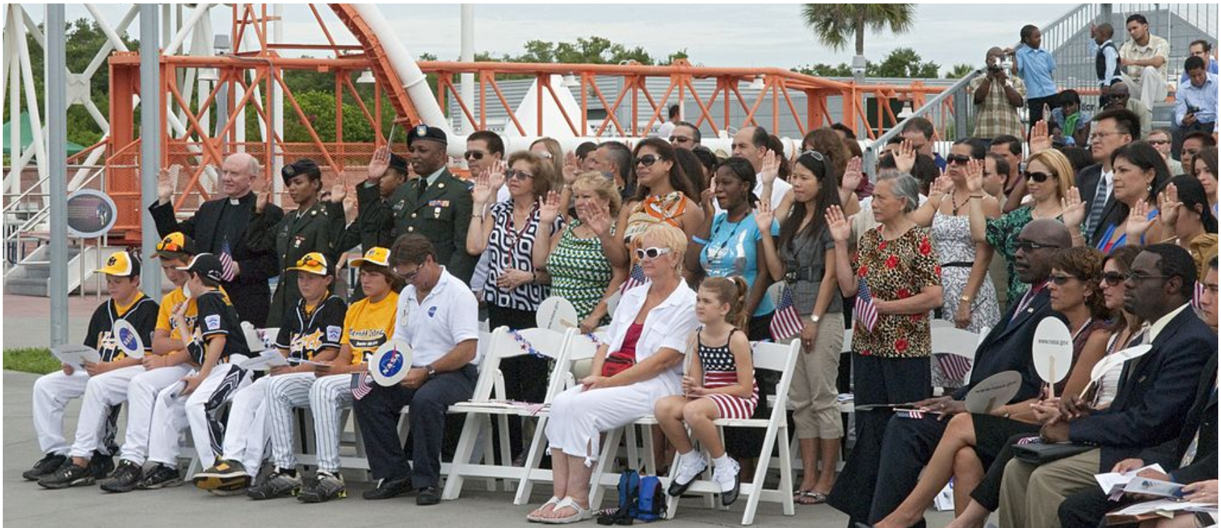
Photo: More than 100 people take the Oath of Allegiance to become American citizens.

Example: Today, immigrants to the United States come from around the world.