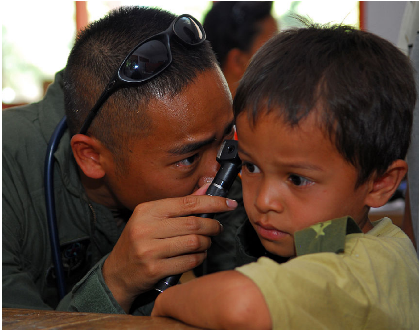
Photo: Ear check up. Sumatra, Indonesia. October, 2009.