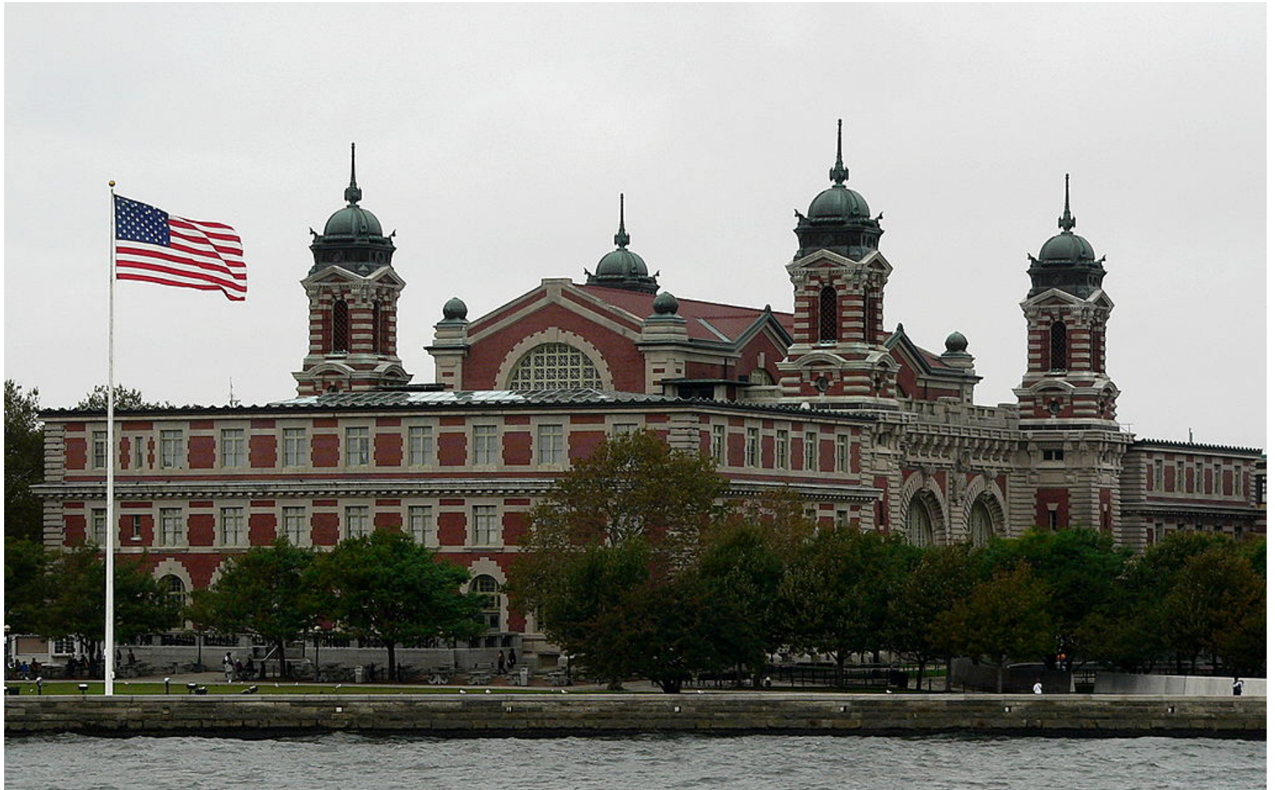
Photo: Ellis Island as seen from the Circle Line Ferry from Battery Park to Liberty Island. New York City, NY.