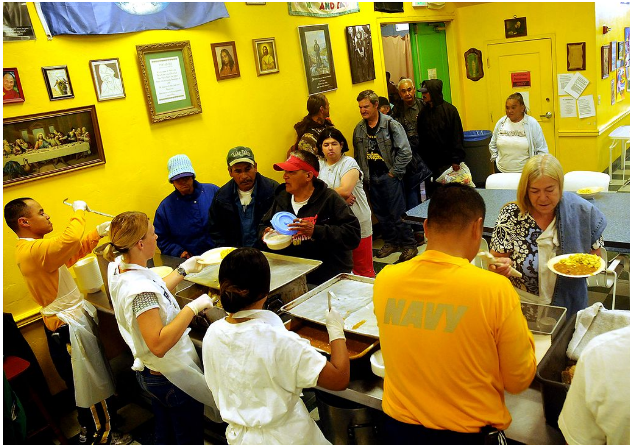
Photo: US Navy serve breakfast to homeless men and women at Dorothy's Soup Kitchen in Salinas, CA. August, 2009.

Example: The mayor urged citizens to help those in need by volunteering at a soup kitchen.