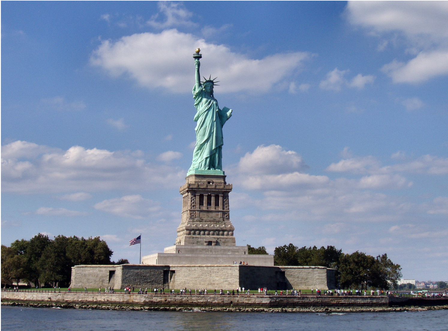
Photo: Statue of Liberty from front. New York City, NY. September, 2004.