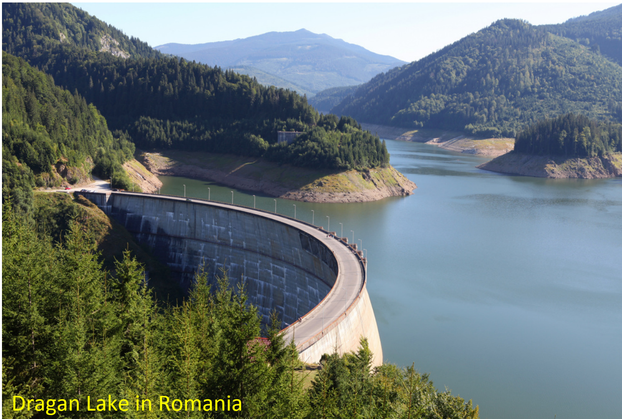
Dragan Lake in Romania

A dam is a wall that stops water from flowing in a certain direction.