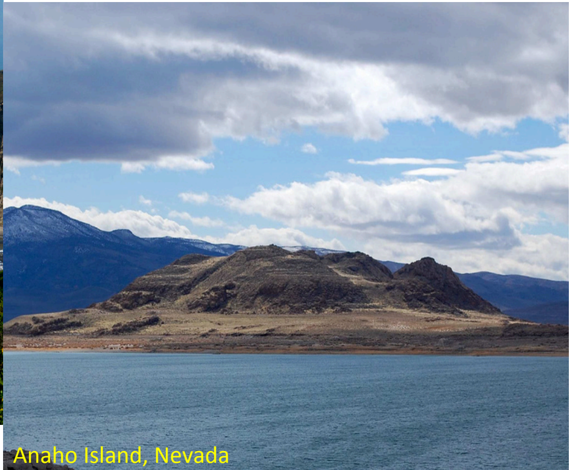
Anaho Island, Nevada

The ocean is salt water, not fresh water. Some lakes are salt water too.