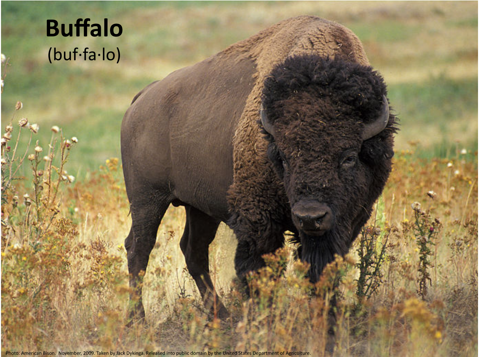
Photo: American Bison. November, 2009.