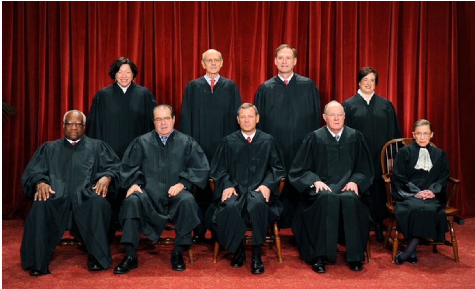
Photo: The Supreme Court. October, 2010. This work is in the public domain in the United States because it is a work of the United States Federal Government under the terms of Title 17, Chapter 1, Section 105 of the US Code.