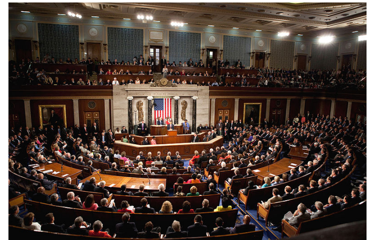
Photo: President Barack Obama and Vice President Joe Biden. Washington, D.C., March, 2009.

Photo: The Supreme Court. October, 2010. This work is in the public domain in the United States because it is a work of the United States Federal Government under the terms of Title 17, Chapter 1, Section 105 of the US Code.