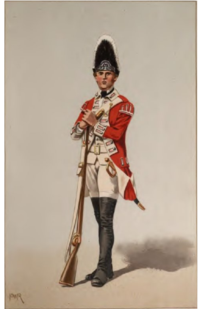
Illustration: Grenadier, 40th Regiment of Foot, 1776. Illustrated by P. W. Reynolds in 1894. This work is in the public domain in the United States because it was registered with the U.S. Copyrights Office or published before January 1, 1923.

Photo: Flag of the United Kingdom, Union Flag. This work is in the public domain in the United States because it was registered with the U.S. Copyrights Office or published before January 1, 1923.