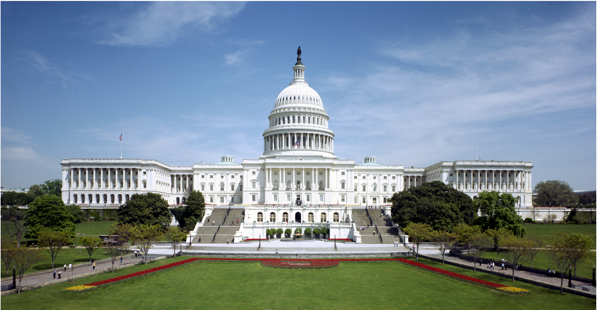
Photo: The western front of the United States Capitol. August, 2009. Taken by the Architect of the Capitol. Released into public domain by the United States Federal Government.