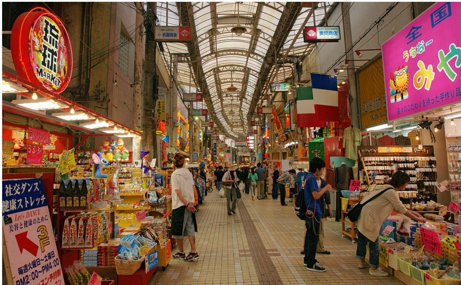
Photo: Heiwa Shopping Avenue in Naha, Okinawa prefecture, Japan. March, 2003.

Example: We pay taxes when we buy things we like to eat.