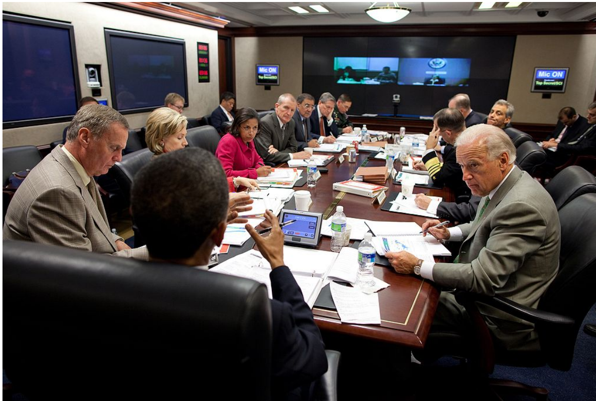
Photo: Barack Obama attends a briefing on Afghanistan in the Situation Room of the White House.