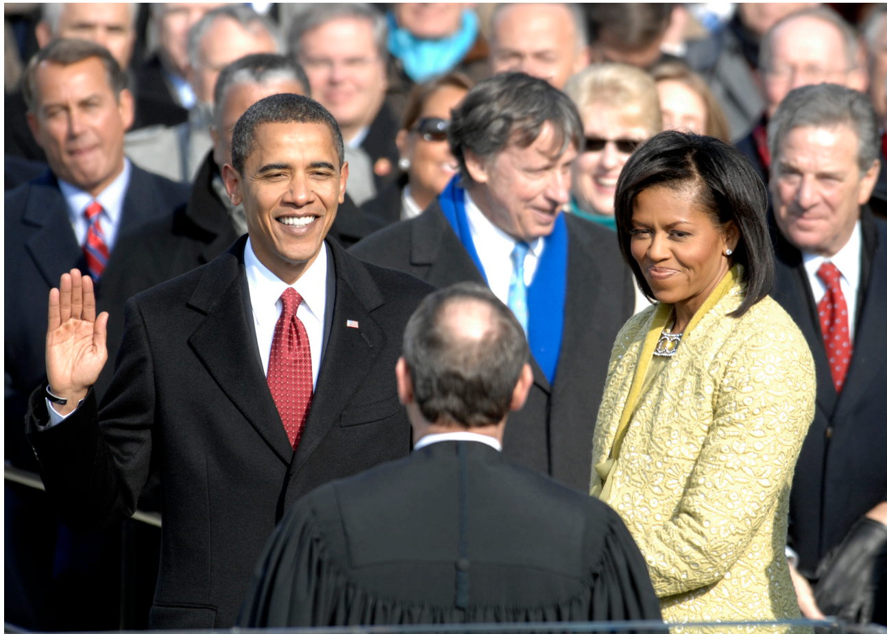
Photo: With his family by his side, Barack Obama is sworn in as the 44th president of the United States. January, 2009. Taken by Master Sgt. Cecilio Ricardo, U.S. Air Force. Released into public domain by the United States Air Force.

Example: The president of the United States is only one person working in the United States government .