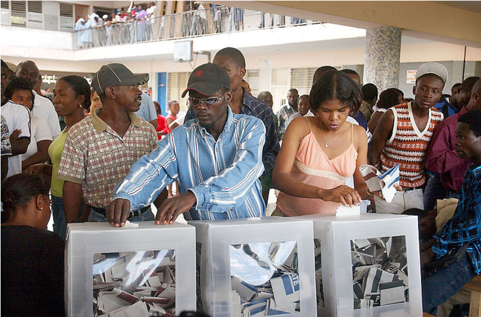
Photo: Haitian voters went to polls to elect the president of the country. Port Au Prince, Haiti. July, 2006.

Example: Many people voted in this election to elect a new government.