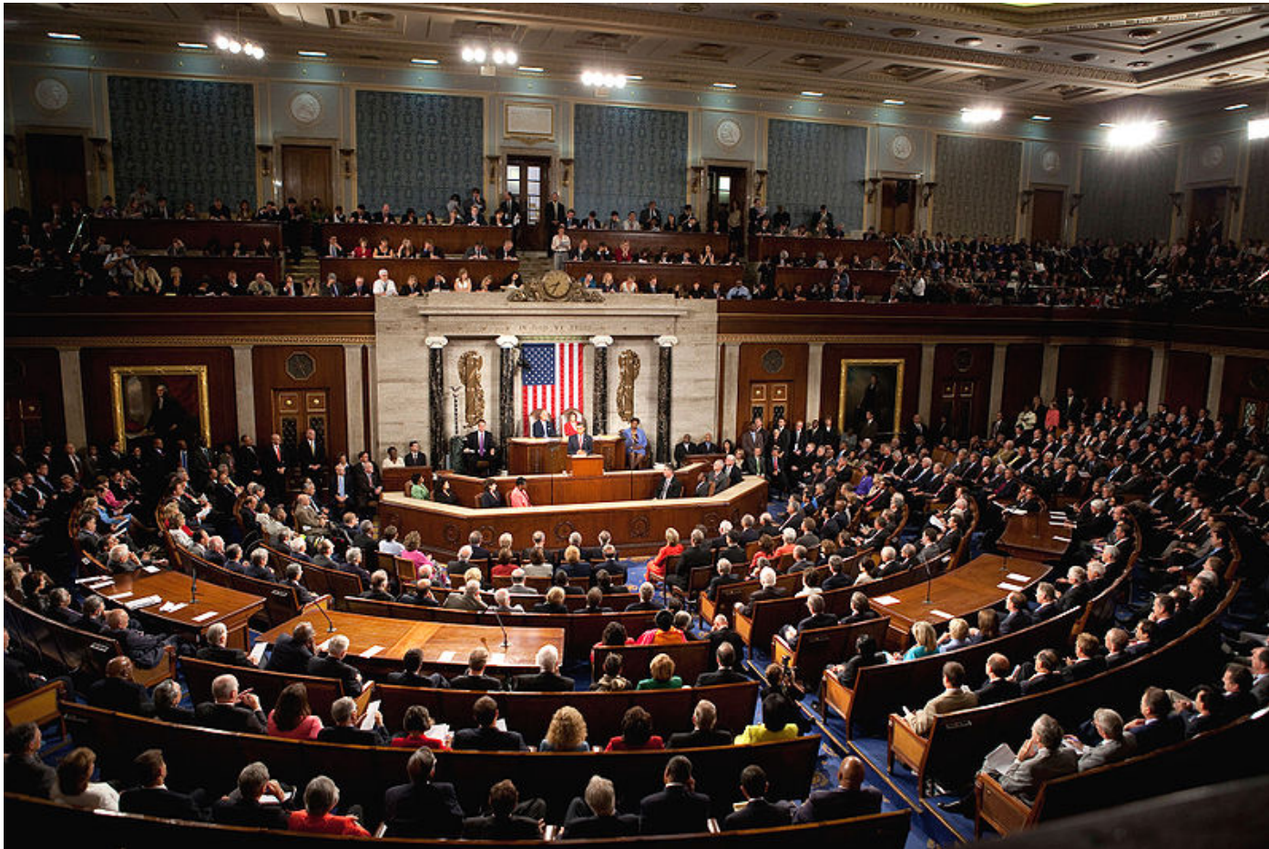
Photo: President Barack Obama speaks to a joint session of Congress regarding health care reform. September, 2009.

Example: In 2010, 53 people were sent to the United States Congress to represent the state of California in the House of Representatives .