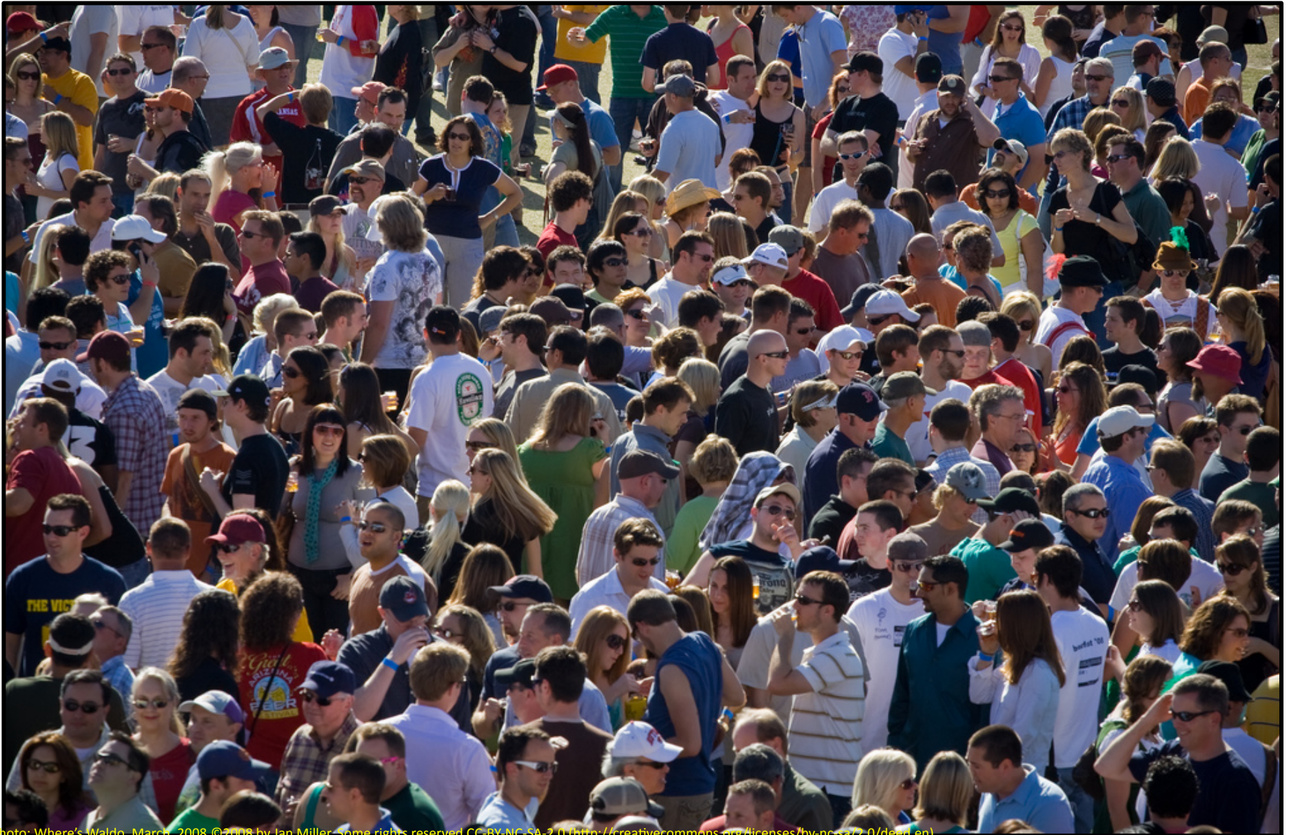
Photo: Where's Waldo, March, 2008. ©2008 by Jan Miller. Some rights reserved CC-BY-NC-SA-2.0 ( http://creativecommons.org/licenses/by-nc-sa/2.0/deed.en ).