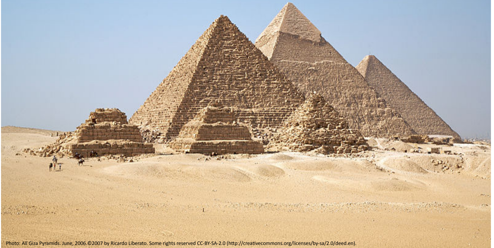
Photo: All Giza Pyramids. June, 2006.