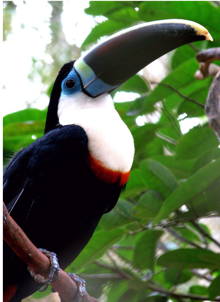
Photo: Keel-billed Toucan (also known as Sulfur-breasted Toucan, Rainbow-billed Toucan) in Mexico. April, 2009. ©2009 by johnrosner. Some rights reserved CC-BY-2.0 ( www.creativecommons.org/licenses/by/2.0 ). Photo: White-throated Toucan ( Ramphastos tucanus ). It is subspecies tucanus-cuvieri intergrade. March, 2008. ©2008 by Ana_Cotta. Some rights reserved by CC-BY-2.0 ( www.creativecommons.org/licenses/by/2.0 ).