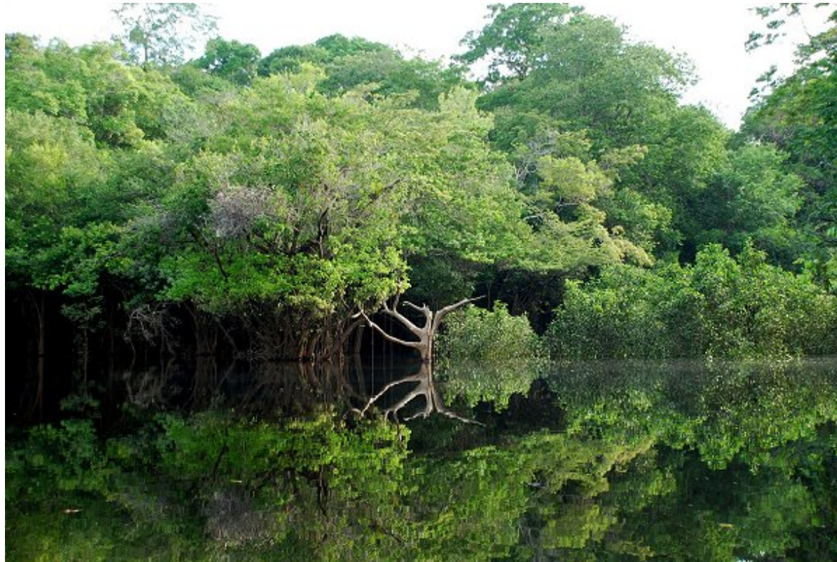
Photo: The yellow line encloses Amazon Basin as delineated by the World Wide Fund for Nature. National boundaries are shown in black. January, 2007. Photo: Amazonian landscape west of Manaus. September 2009.

Example: The Amazon rain forest is home to many plants, and animals that are not found anywhere else in the world.