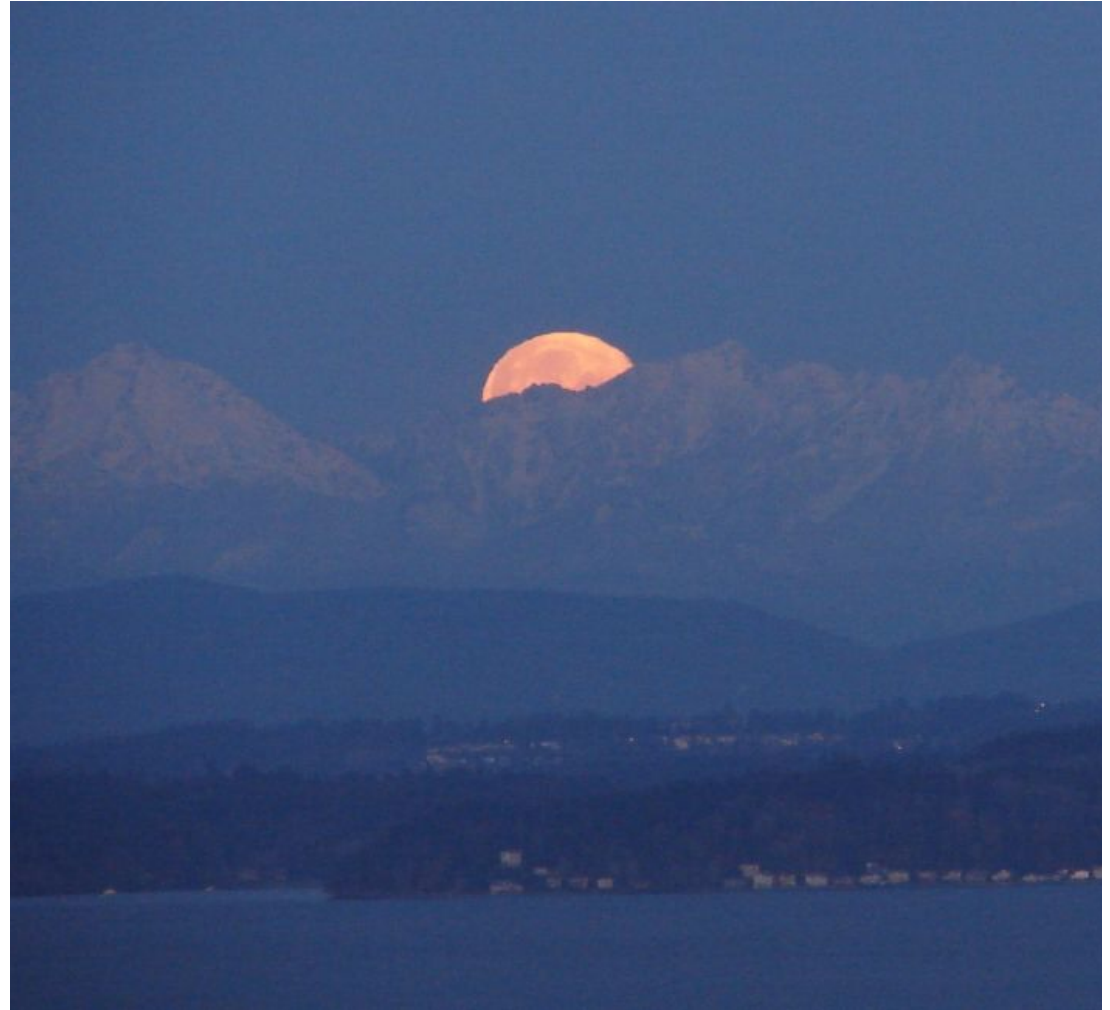
The moon sets behind a mountain.

©2013 by alexcoitus at Flickr. Some rights reserved. https://creativecommons.org/licenses/by-nc-sa/2.0/