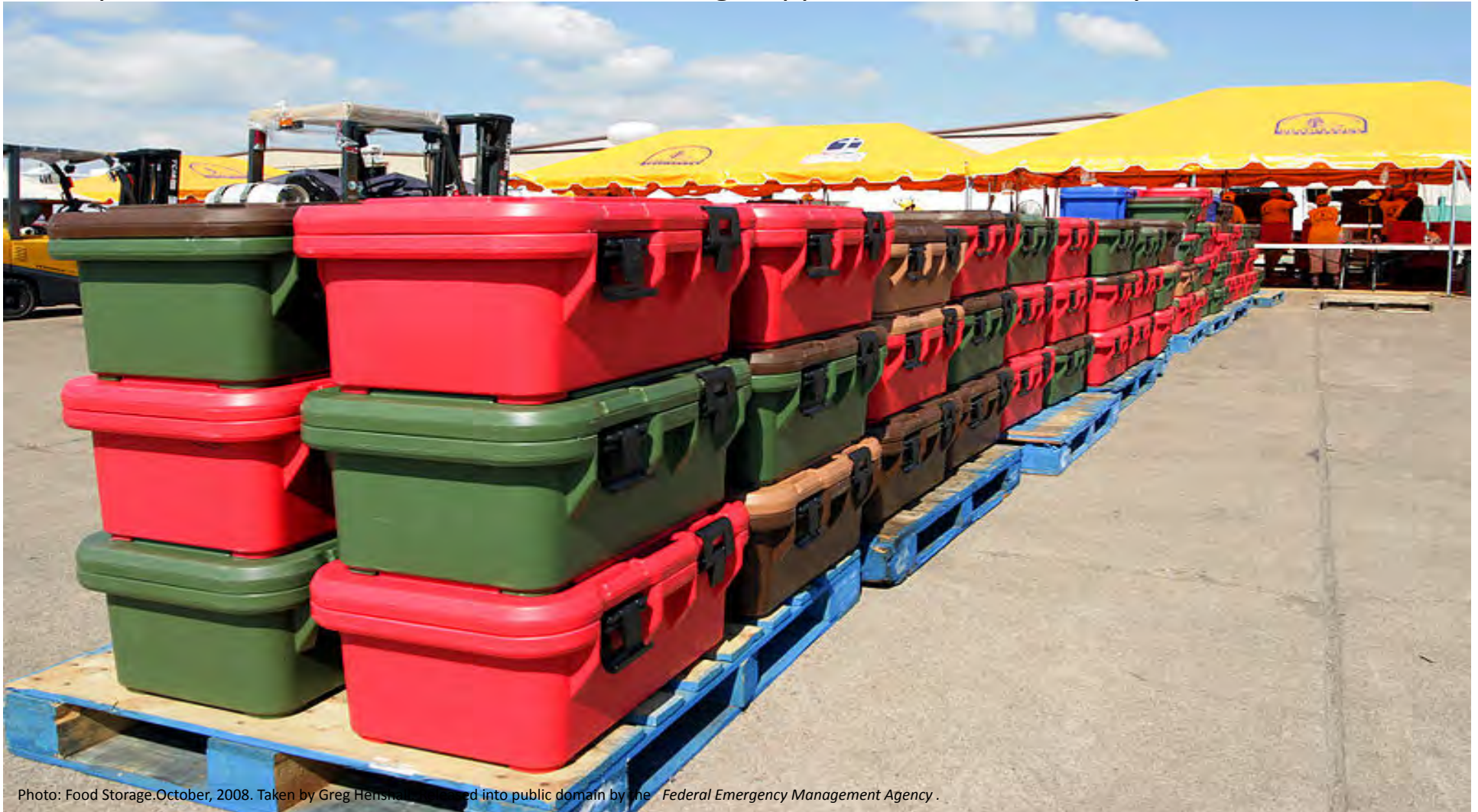
Photo: Food Storage.October, 2008.

Example: The food in these containers are being shipped to another country.