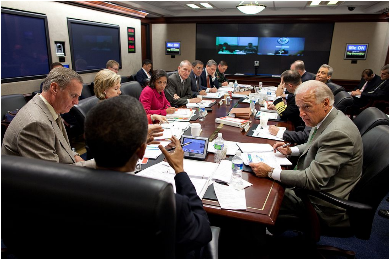
Photo: "The Situation Room" conversations. February, 2010.

Example: The president may listen to the opinions of many leaders before making a decision.