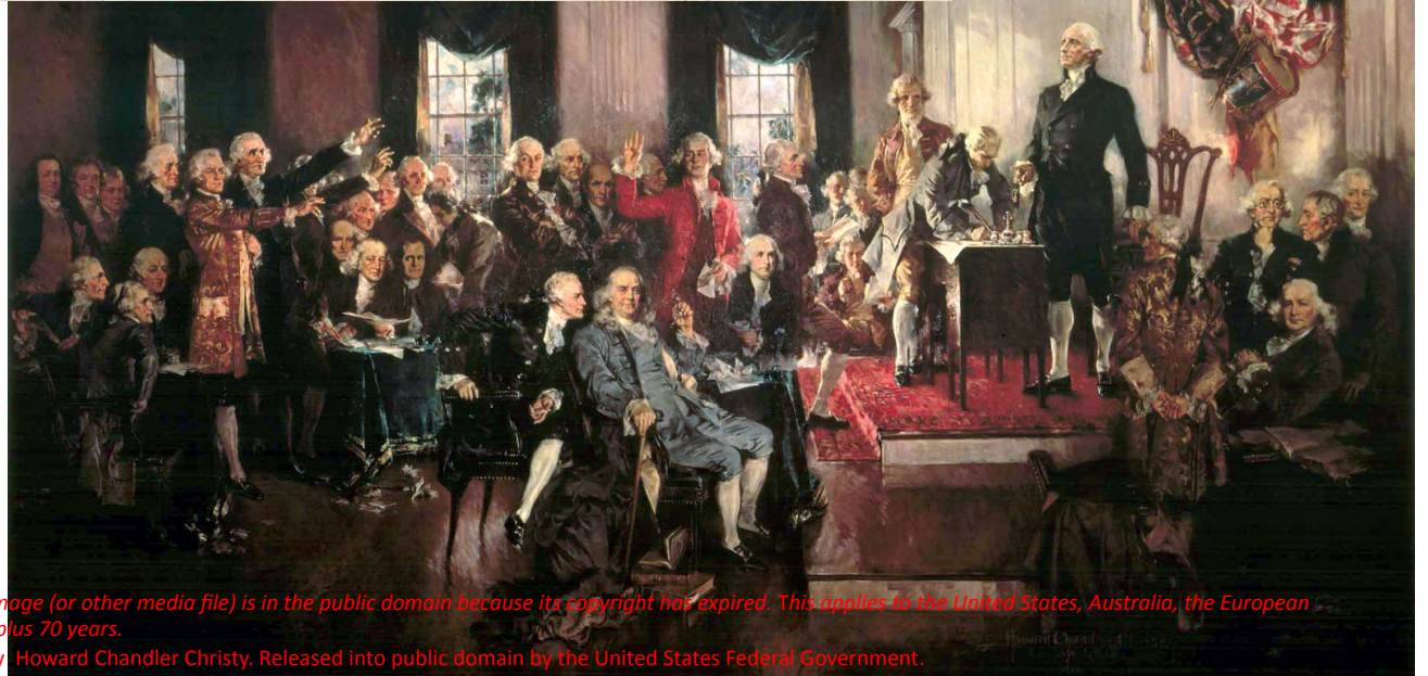
Photo: Detail of Preamble to Constitution of the United States. This image (or other media file) is in the public domain because its copyright has expired. This applies to the United States, Australia, the European Union and those countries with a copyright term of life of the author plus 70 years.

Photo: Scene at the signing of the Constitution. 1873-1952. Painted by Howard Chandler Christy. Released into public domain by the United States Federal Government.