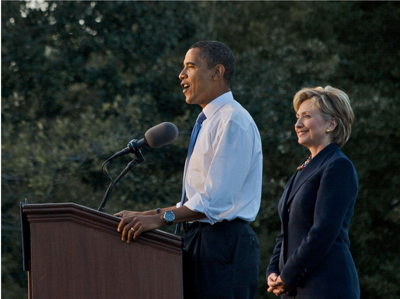
Right Photo: Obama-Clinton rally in Orlando. October, 2008. © by Nathan Forget. Some rights reserved CC-BY-2.0 ( www.creativecommons.org/licenses/by/2.0 ).