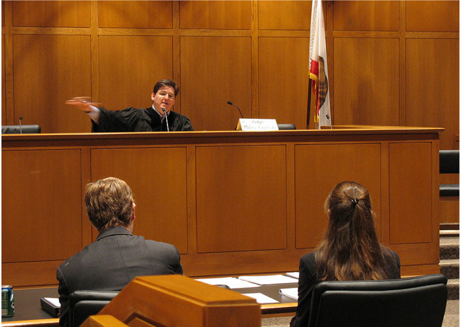
Photo: An American w:judge talking to a lawyer. February,2006. © 2007 by maveric2003 in en: Wikimedia. Some rights reserved CC-BY-2.0 ( www.creativecommons.org/licenses/by/2.0 ).