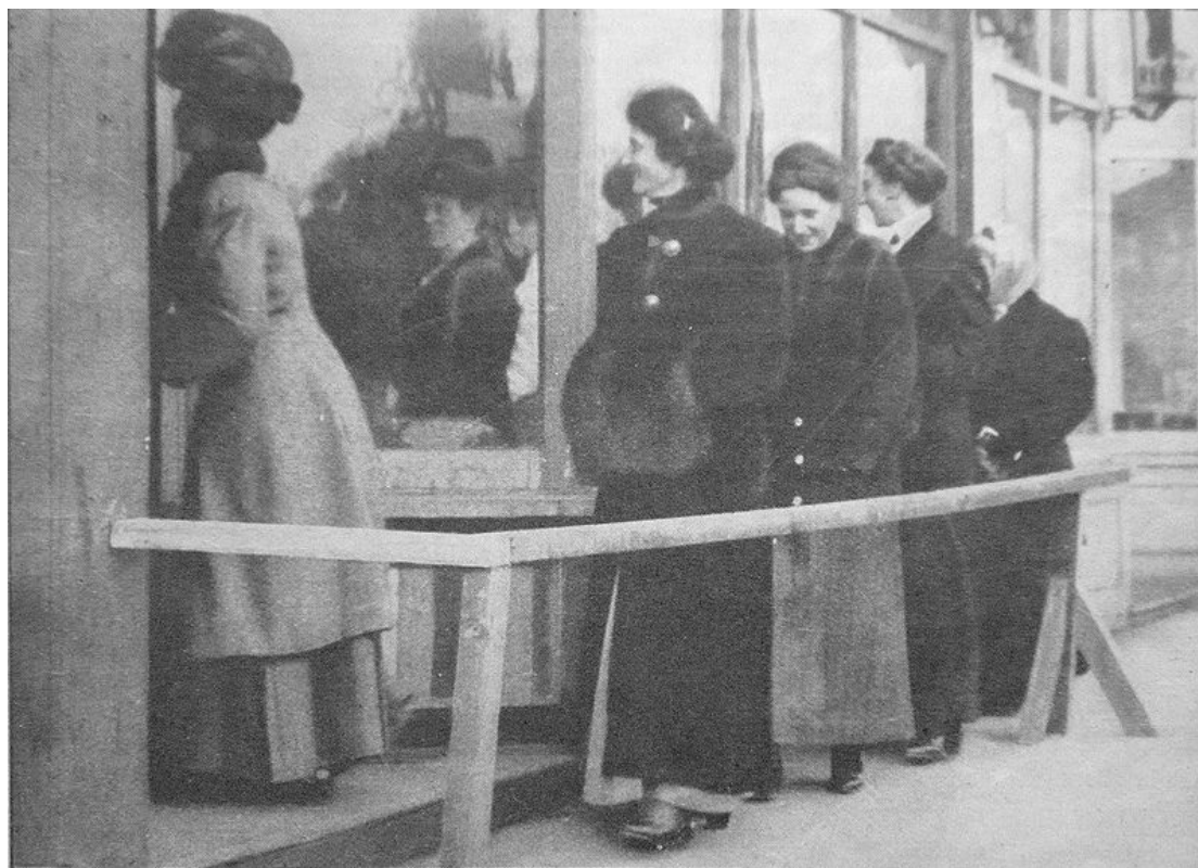
Left Photo: 19 th Amendment. c.1920. Taken by Clerk of the House. Released into public domain by the United States Federal Government.