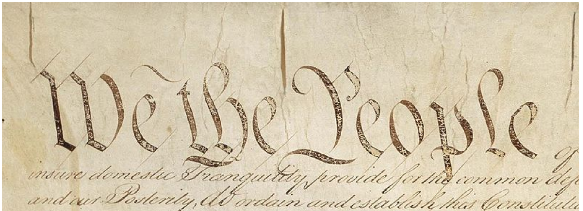
Photo: Detail of Preamble to Constitution of the United States. This image (or other media file) is in the public domain because its copyright has expired.