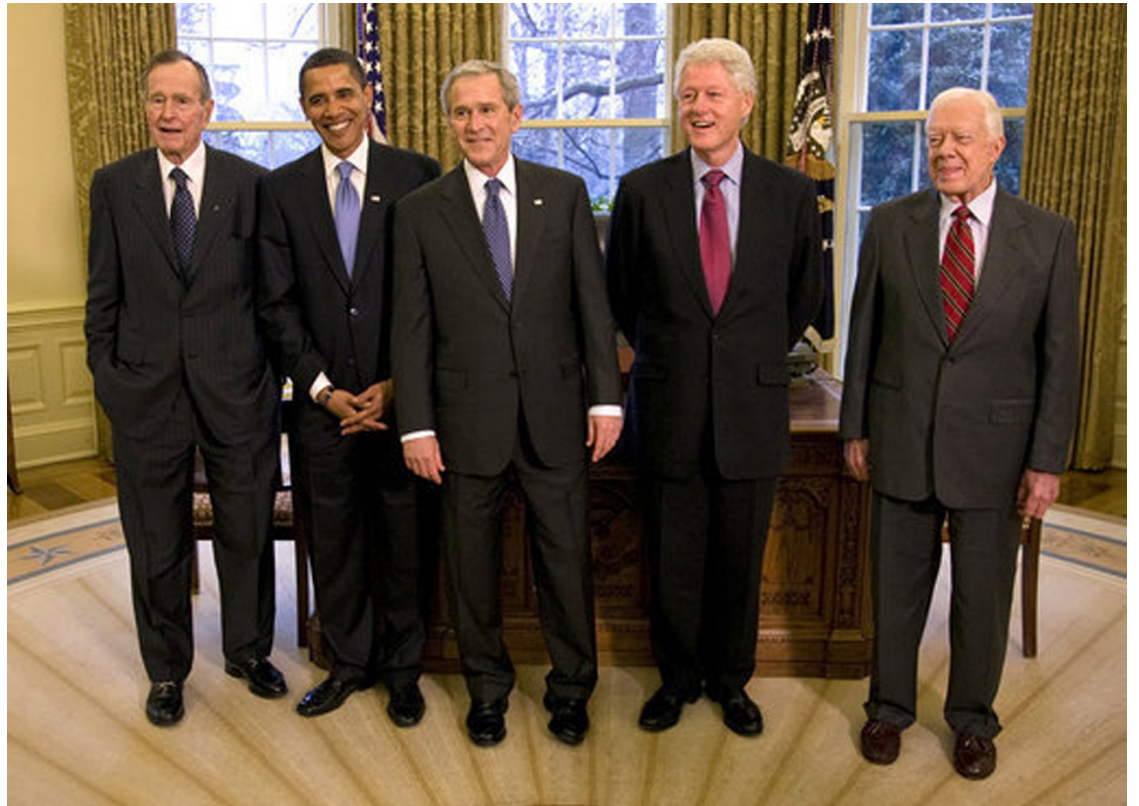
Five United States presidents from left to right: George H.W. Bush, Barack Obama, George W. Bush, Bill Clinton, and Jimmy Carter.