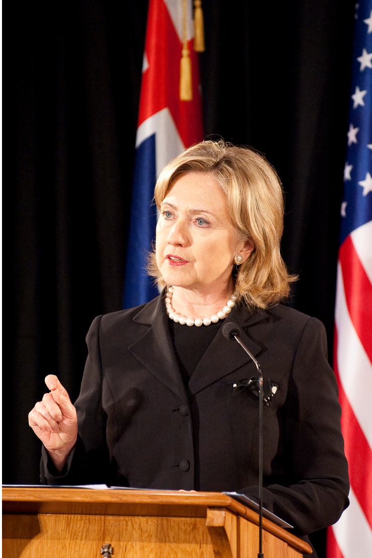
Former Secretary of State Hillary Clinton