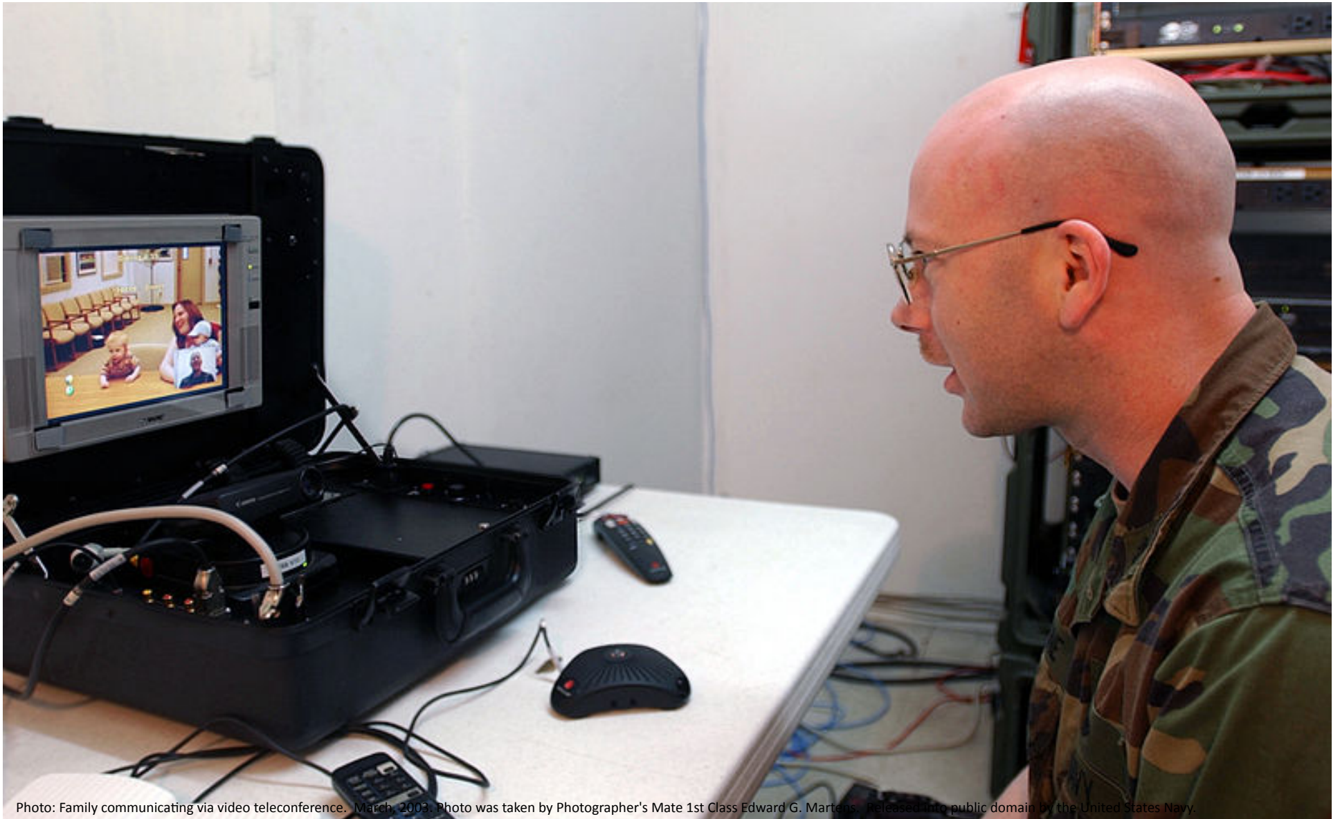
Photo: Family communicating via video teleconference. March, 2003.