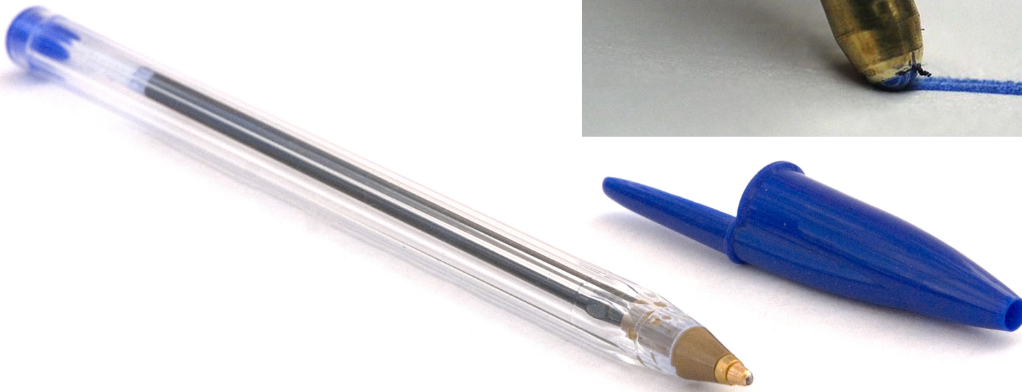
Photo: Close up of a ballpoint pen. November 2006. Photo: Ballpoint pen. March 2008.