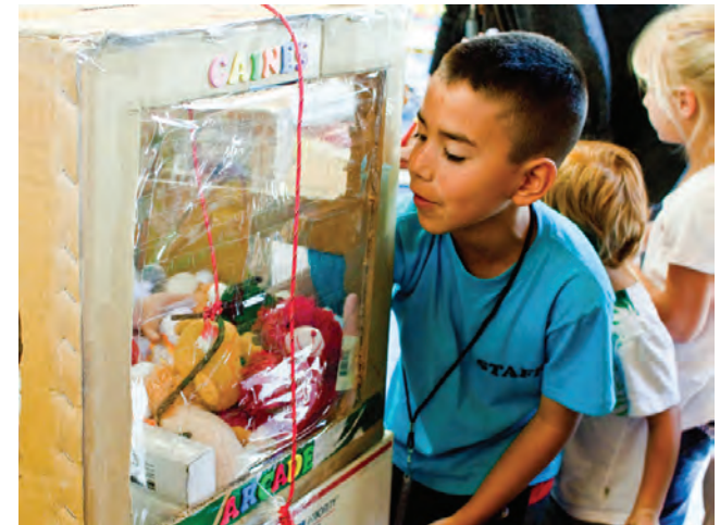
©2012 by Leslie Kalohi in Flickr. Some rights reserved http://creativecommons.org/licenses/by-nc/2.0/