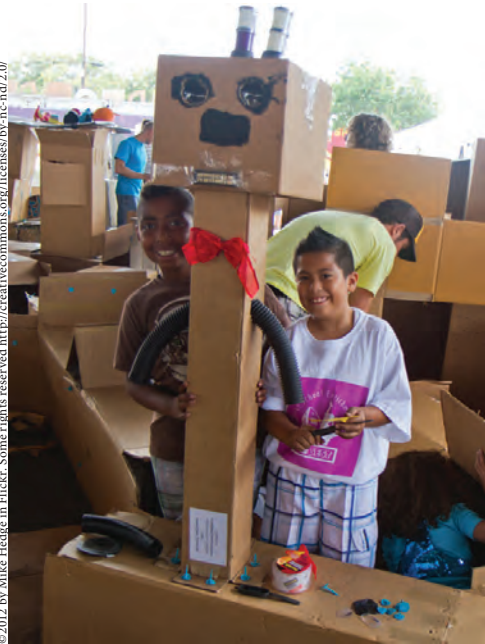
©2012 by Mike Hedge in Flickr. Some rights reserved http://creativecommons.org/licenses/by-nc-nd/2.0/

Caine Monroy has encouraged millions of people around the world to use their imagination to invent something. Using his imagination helped him change the world.