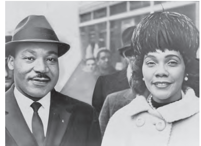
Image of Dr. and Mrs. Martin Luther King, Jr.

Over the years, Coretta met with civil rights leaders all around the world and worked with them to bring peace to their countries. Her goal was the same as her husband's: to make sure that all people can live in safety and in freedom.