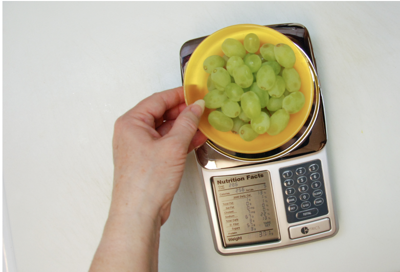
These grapes are on a food scale.

A scale is an object used to weigh someone or something in order to know how heavy the person or object is.