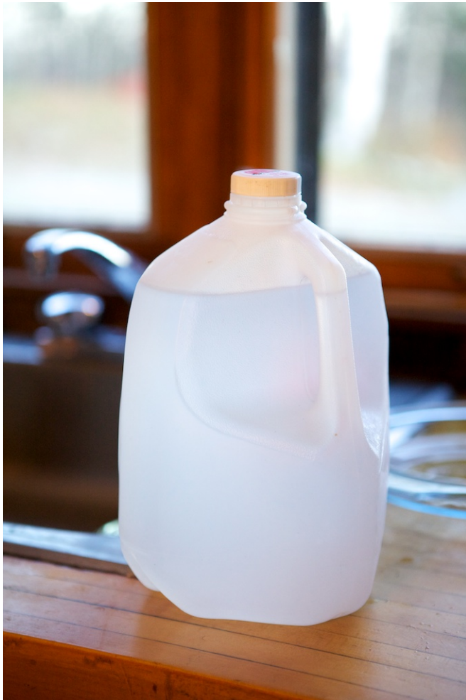
A gallon measures liquid.

When you measure something you find out the dimensions, quantity, or capacity of what is being measured. To measure something answers the questions: how much, how many, of what kind?