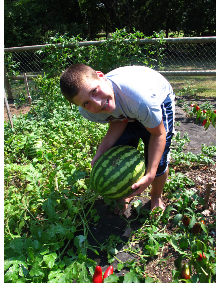
This watermelon has a heavier weight than the grapes.