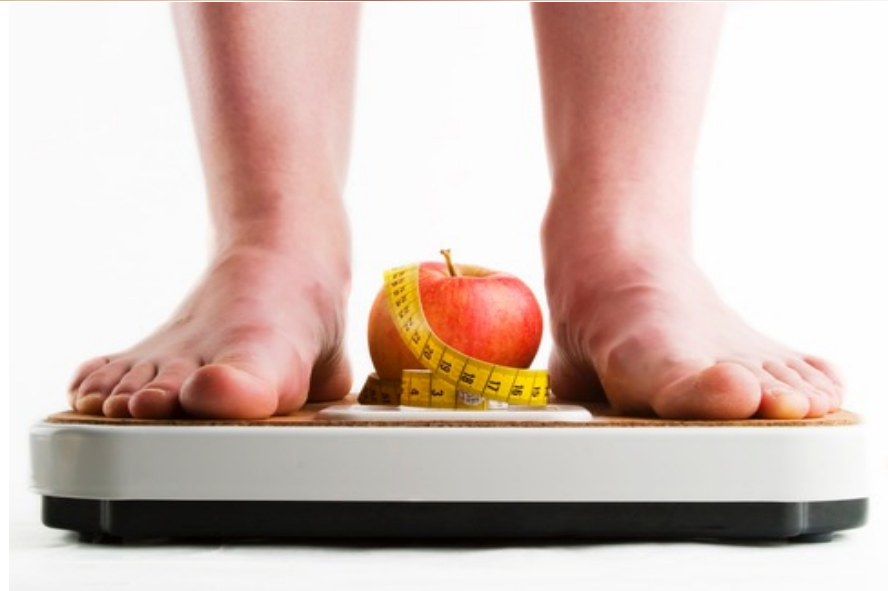
A scale measures weight.