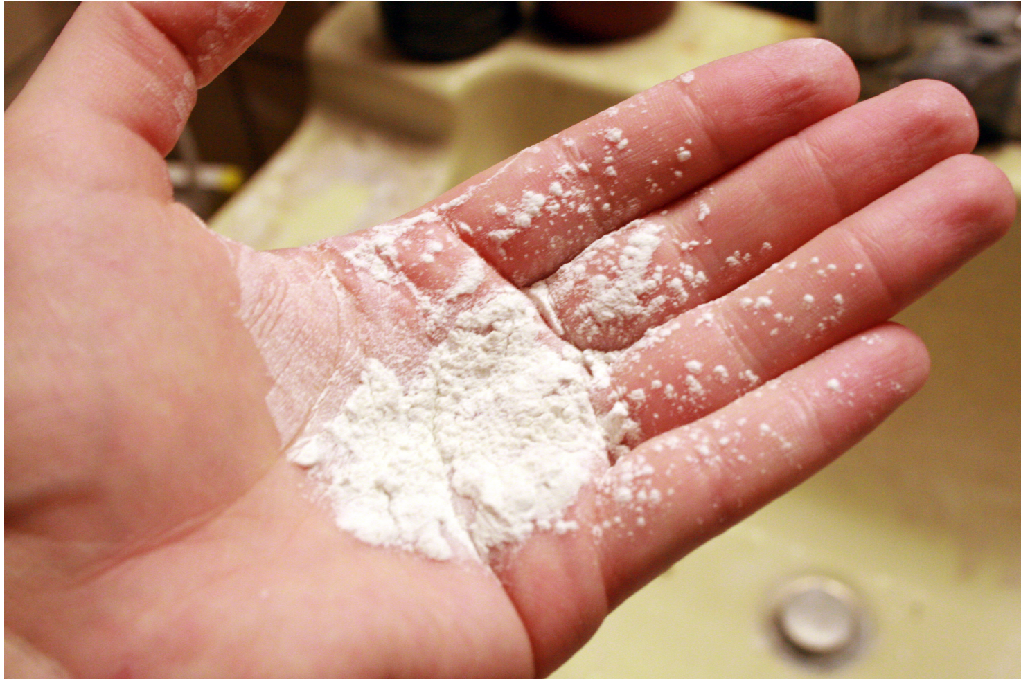
Powder on a person's hand