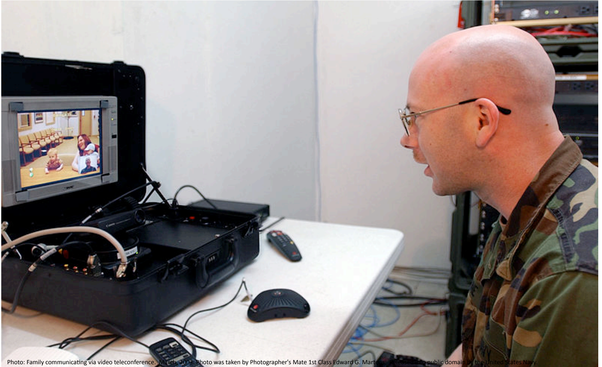
Photo: Family communicating via video teleconference. March, 2003.