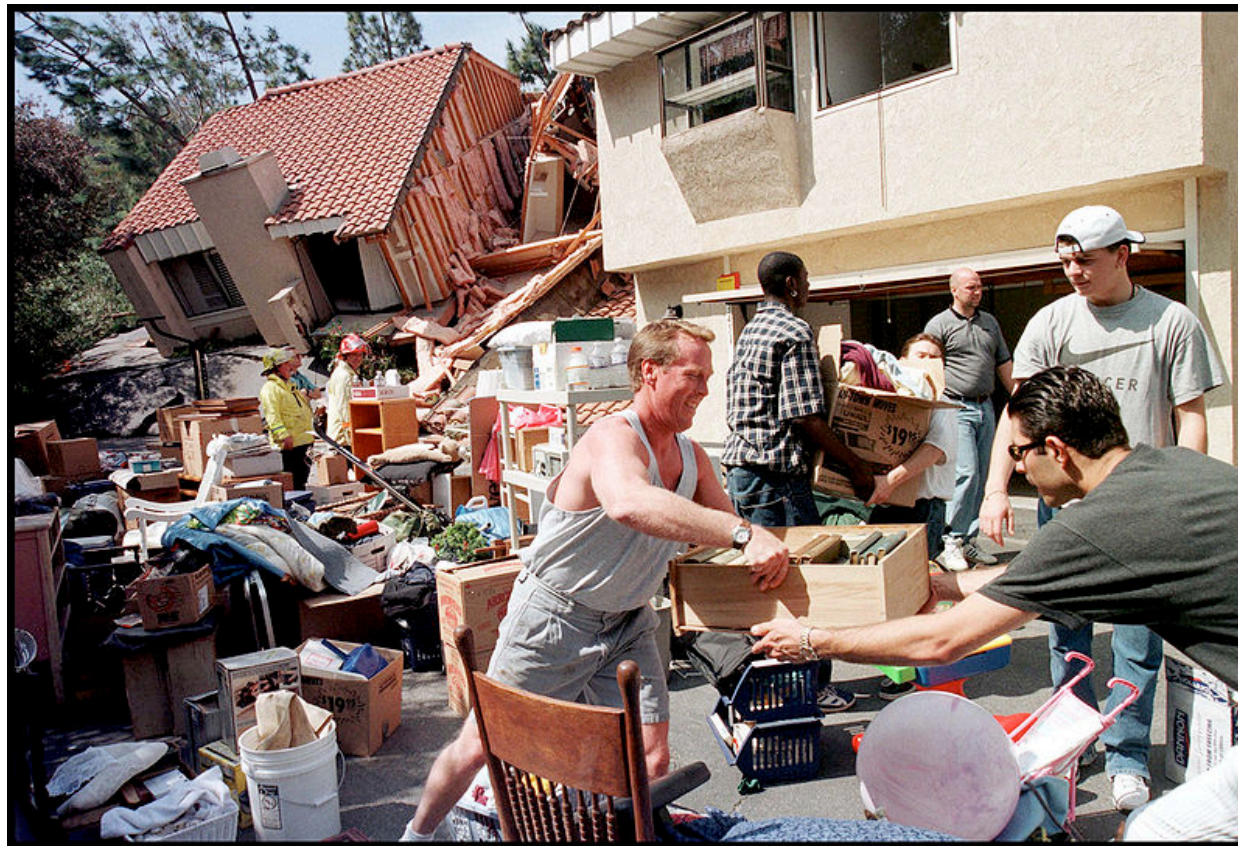
Photo: Friends and neighbors pitch in to save the belongings of a condominium that was heavily damaged in a landslide resulting from El Nino storms. Laguna Niguel, CA, March, 1998.

Example: After the landslide, all the neighbors helped each other clean up mess.