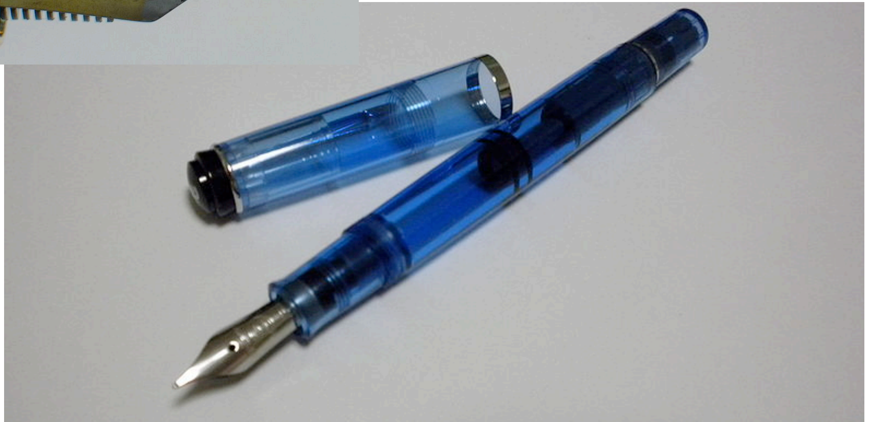
Photo: Nib of a fountain pen. August, 2005. ©2005 by Ben FrantzDale. Some rights reserved CC-BY-SA-3.0 (www.creativecommons.org/licenses/by-sa/3.0/) . Photo: Fountain pen. September 2009. Released into public domain by Ennui in en:wikipedia.