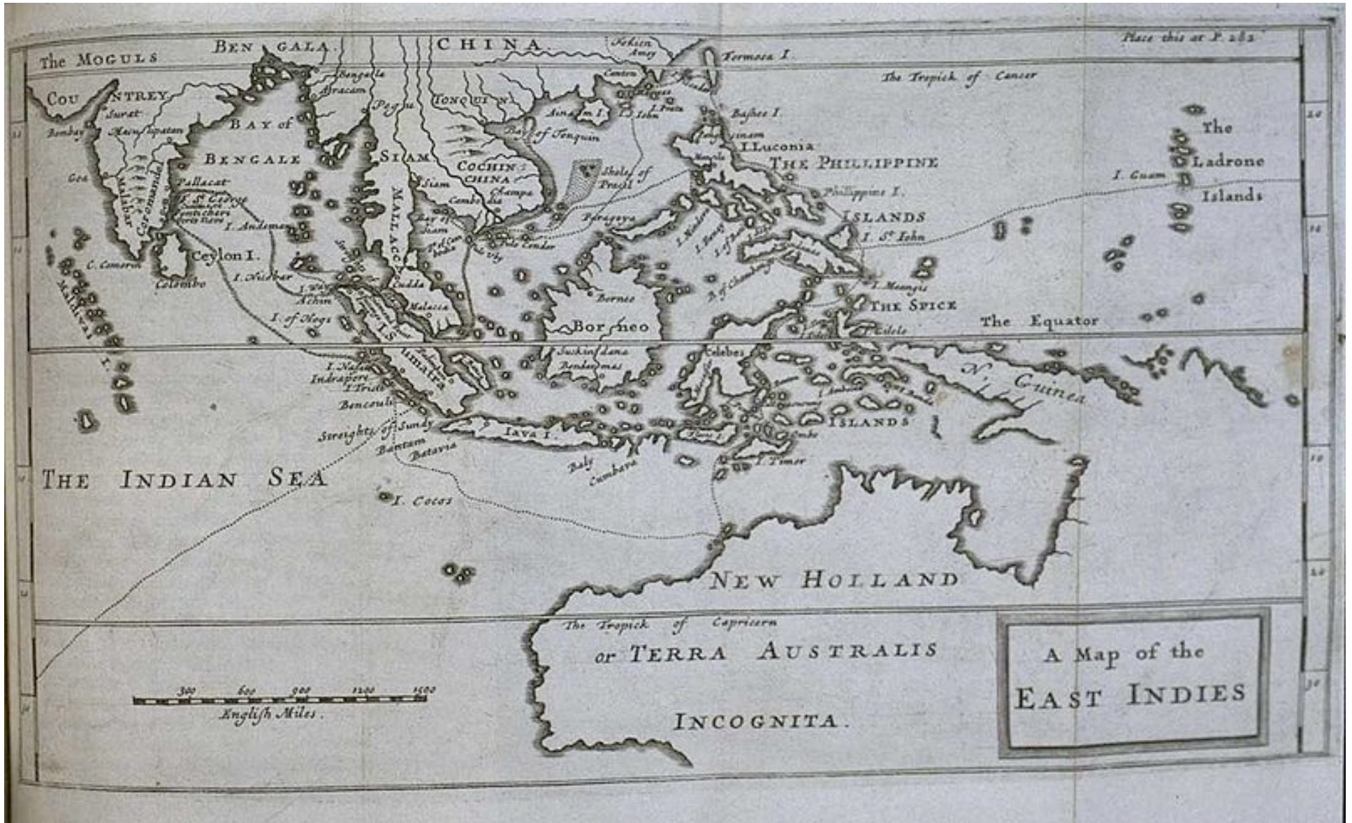
Photo: A map of the East Indies, from William Dampier's New Voyage Round the World , published 1697. Released into public domain due to expired copyright.