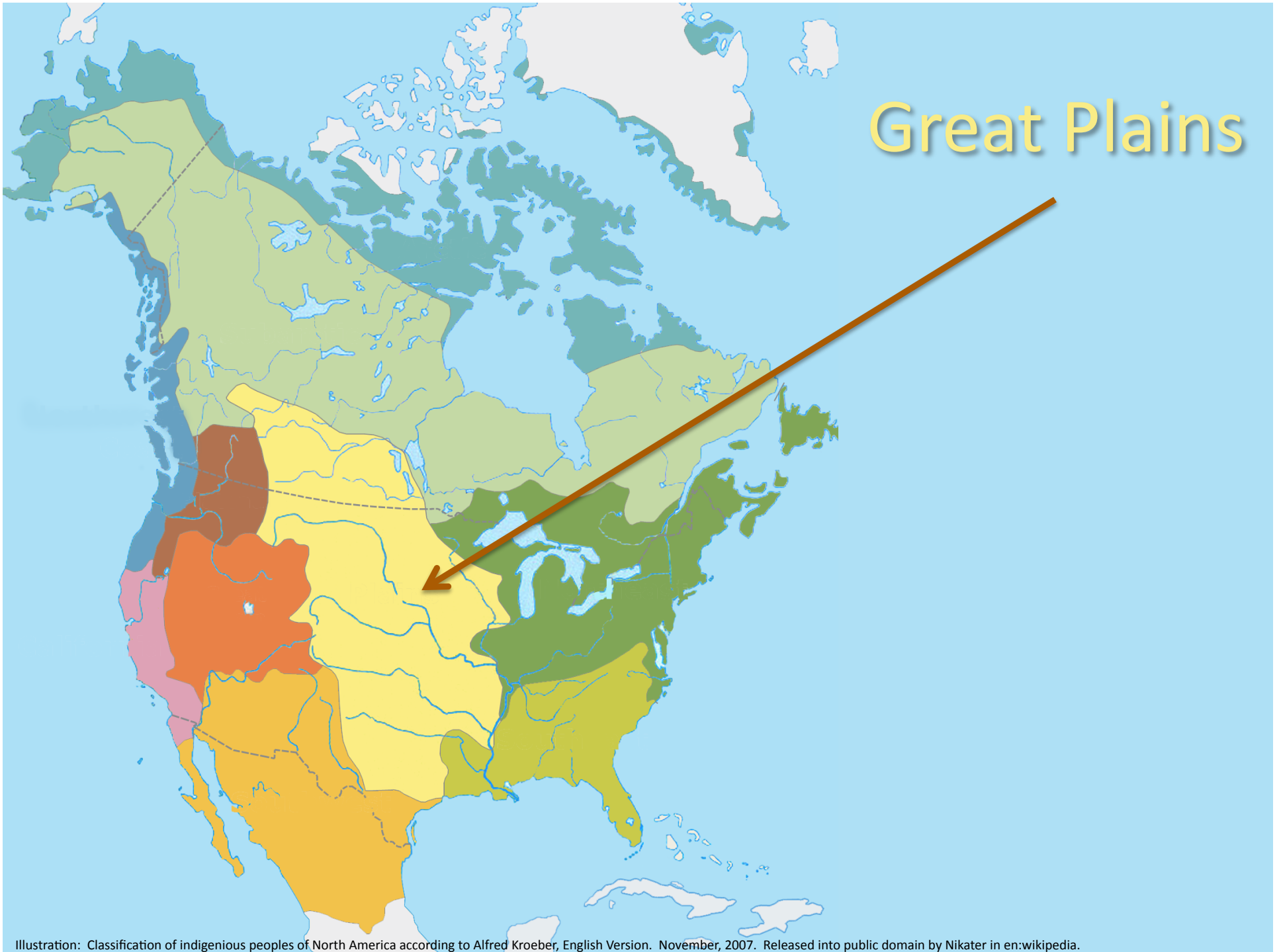
Illustration: Classification of indigenous peoples of North America according to Alfred Kroeber, English Version. November, 2007. Released into public domain by Nikater in en.wikipedia.