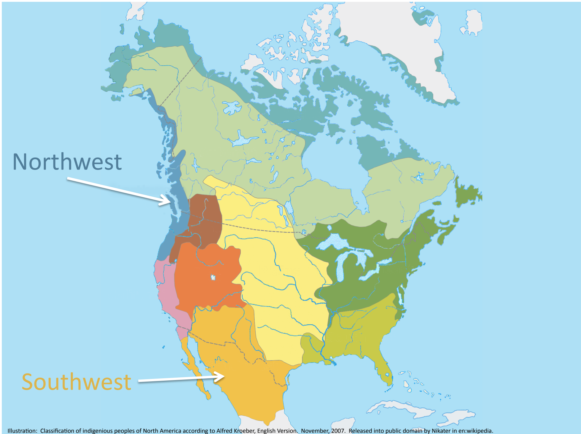
Illustration: Classification of indigenous peoples of North America according to Alfred Kroeber, English Version. November, 2007. Released into public domain by Nikater in en.wikipedia.