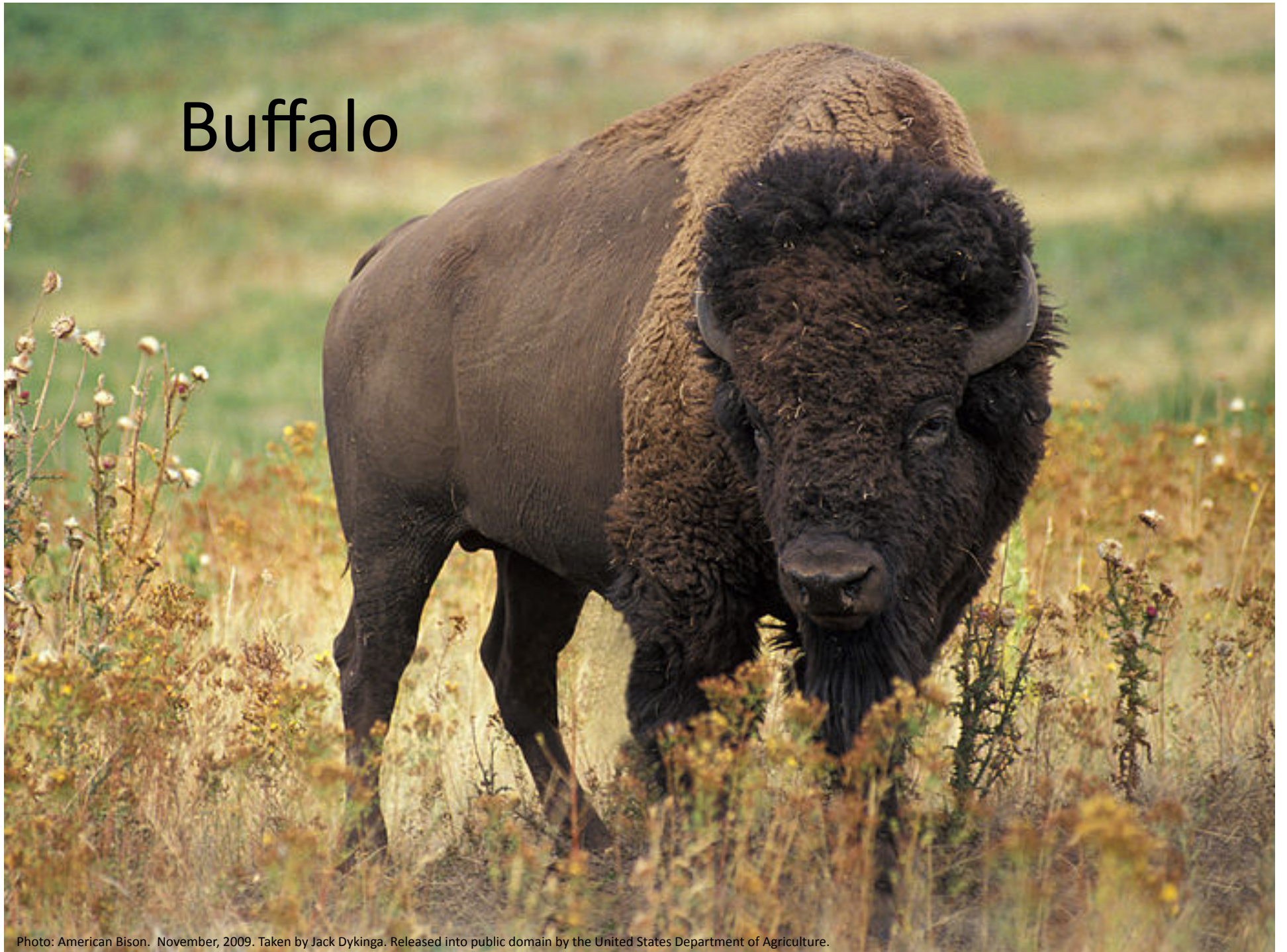
Photo: American Bison. November, 2009.