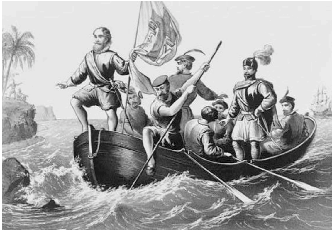
Illustration: The Landing of Columbus at San Salvador, October 12, 1492. Created by Curry & Ives in 1876. Released into public domain due to an expired copyright.