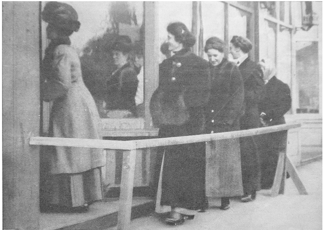
Left Photo: 19 th Amendment. c.1920. Taken by Clerk of the House. Released into public domain by the United States Federal Government.