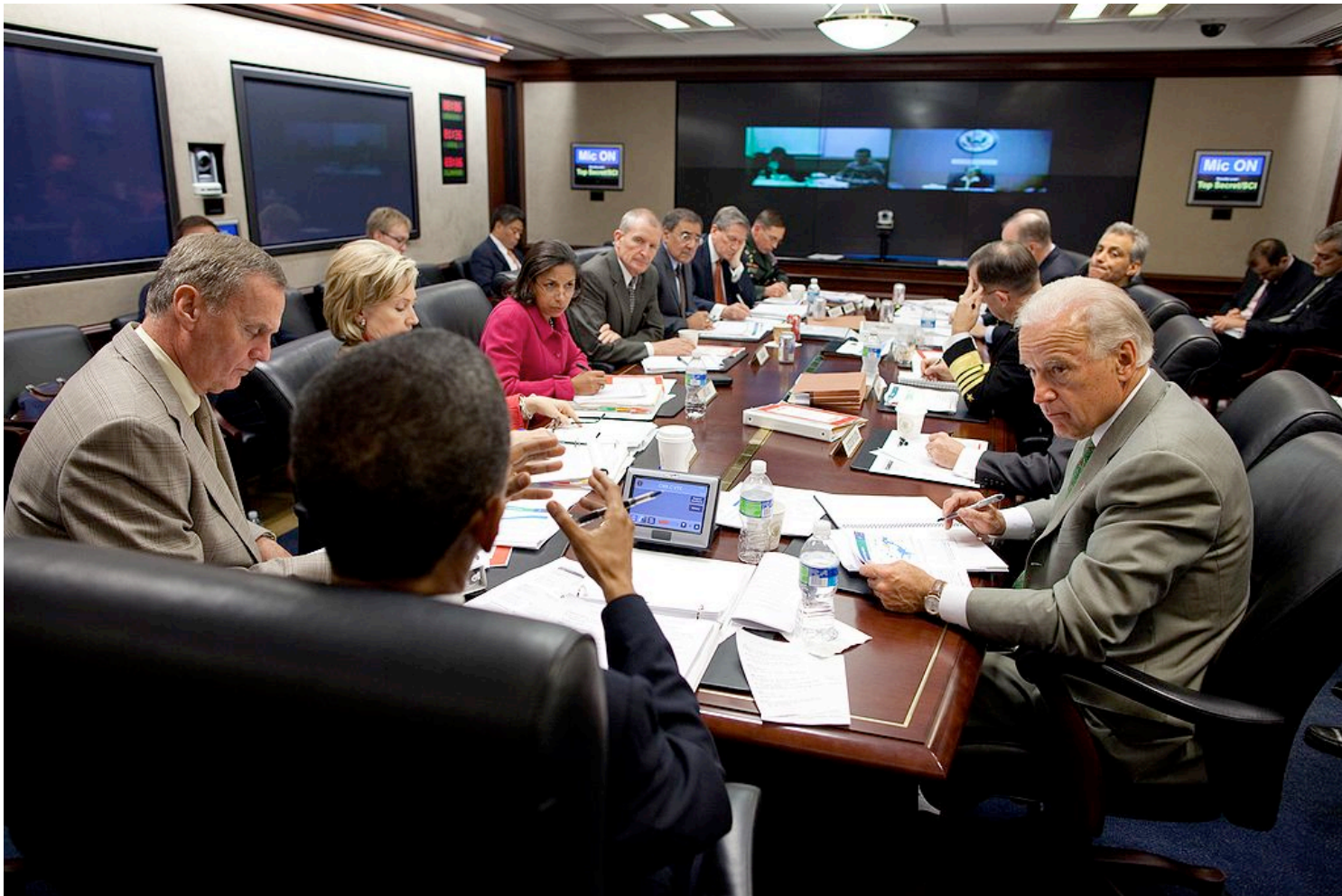
Photo: "The Situation Room" conversations. February, 2010.

Example: The president may listen to the opinions of many leaders before making a decision.