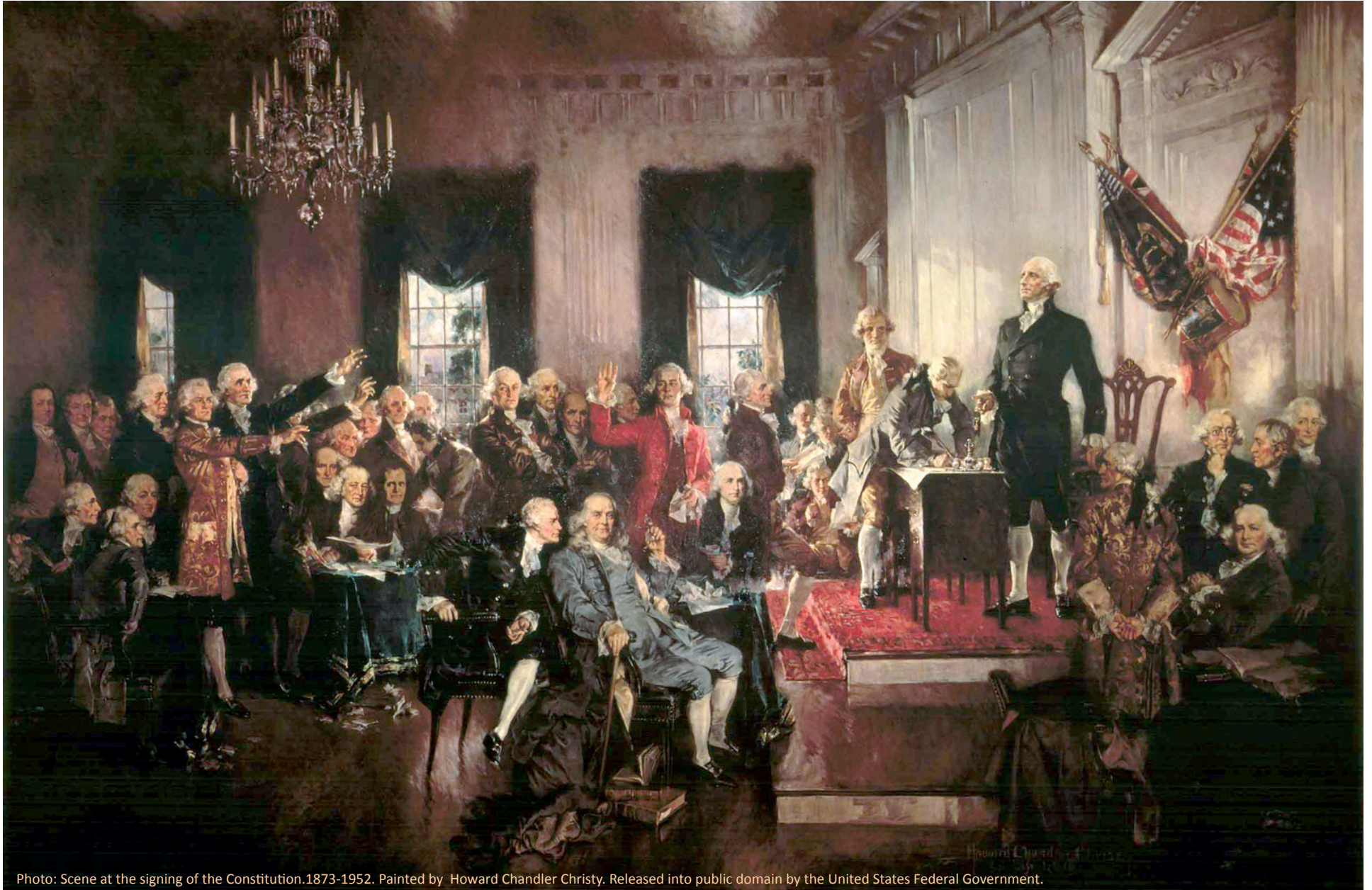
Photo: Scene at the signing of the Constitution. 1873-1952. Painted by Howard Chandler Christy. Released into public domain by the United States Federal Government.