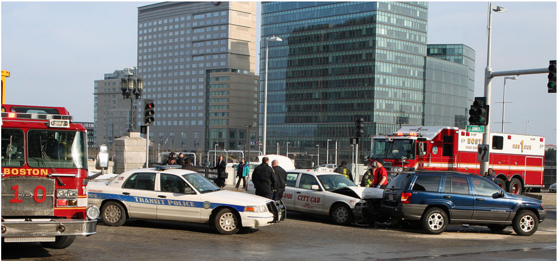
Left Photo: A traffic collision in Boston. January, 2010.

Example: It took several hours for the police to sort out the traffic situation .