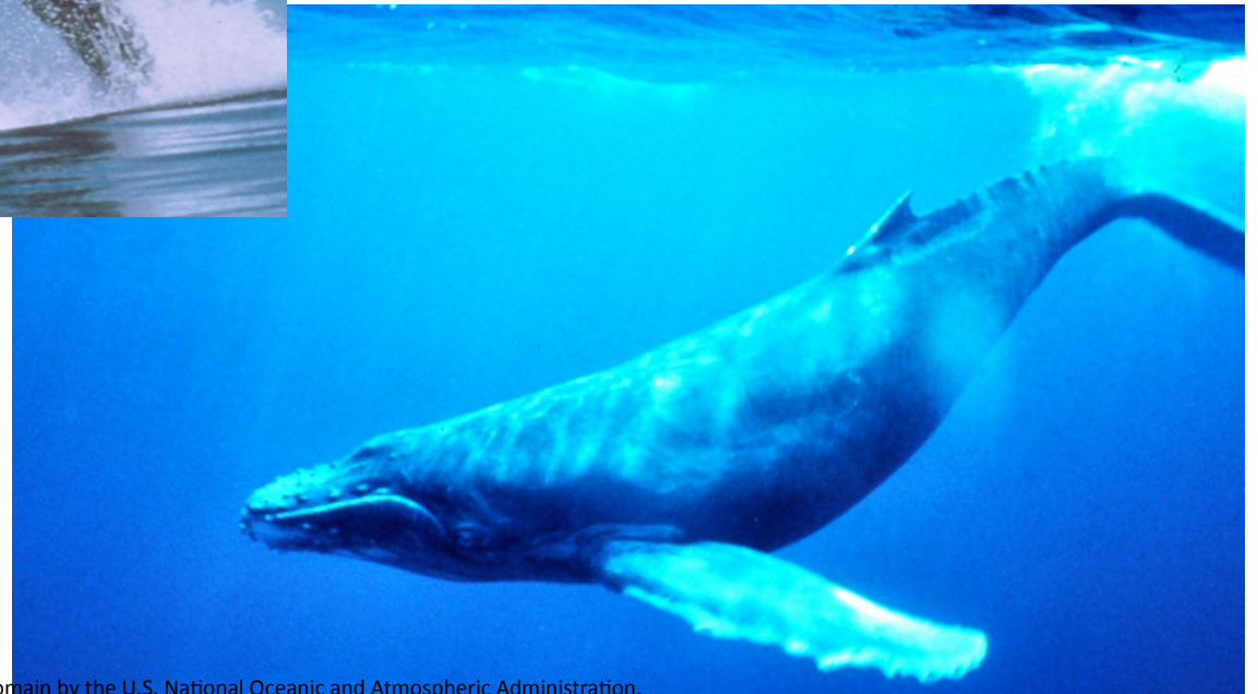
Photo: Humpback whale ( Megaptera novaeangliae ) breaching . Released into public domain by the U.S. National Oceanic and Atmospheric Administration.