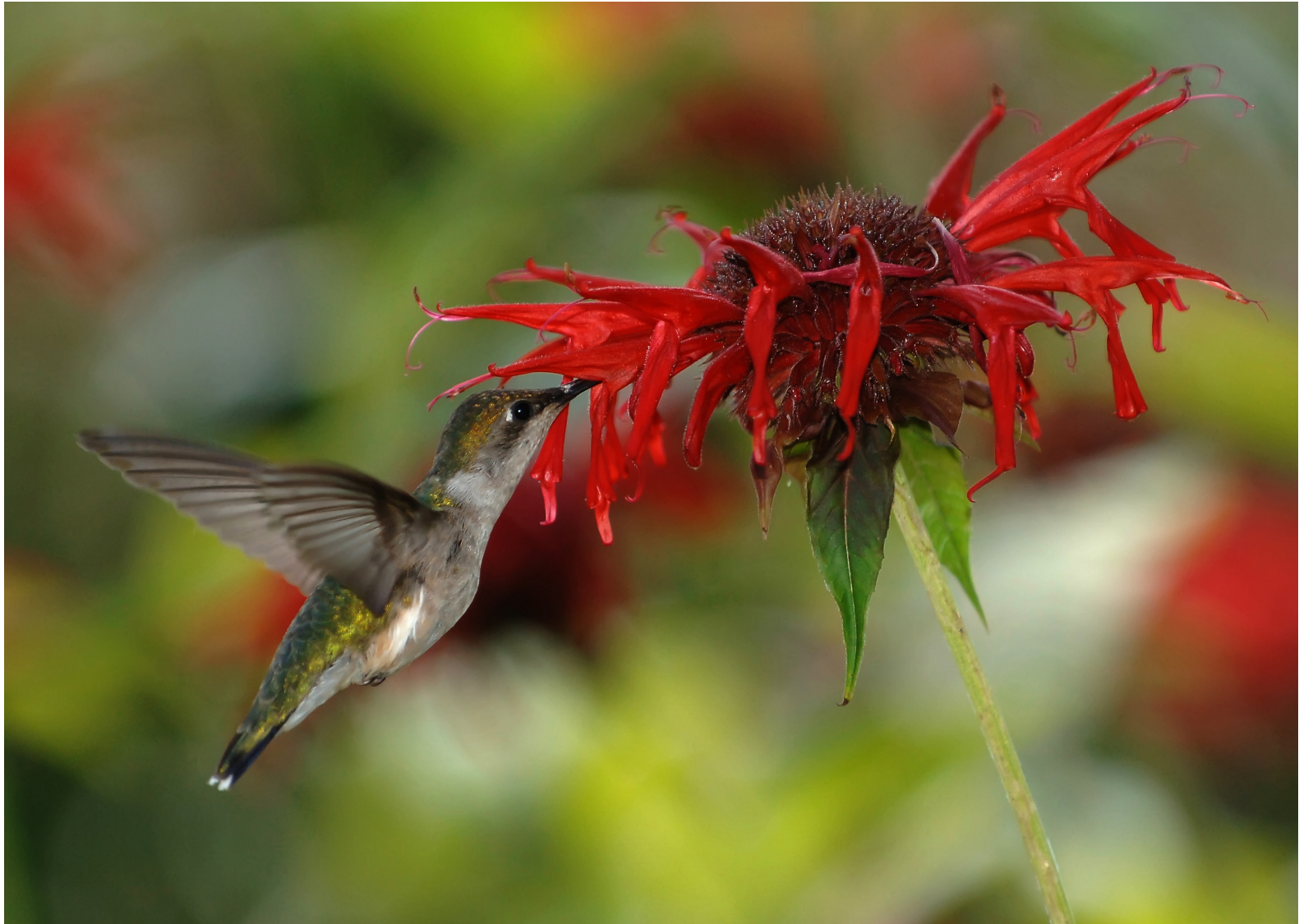
Photo: A female ruby-throated hummingbird sipping nectar from scarlet beebalm. Louisville, Kentucky. June, 2006.