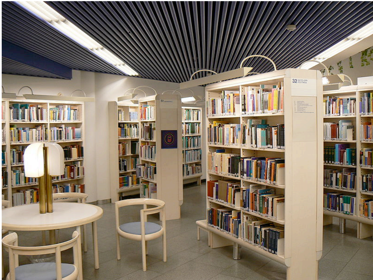
Photo: Shelves of the Main Library of Tampere, Finland. August, 2007. ©2007 by Saruwine in en:wikipedia. Some rights reserved http://creativecommons.org/licenses/by-sa/3.0/deed.en