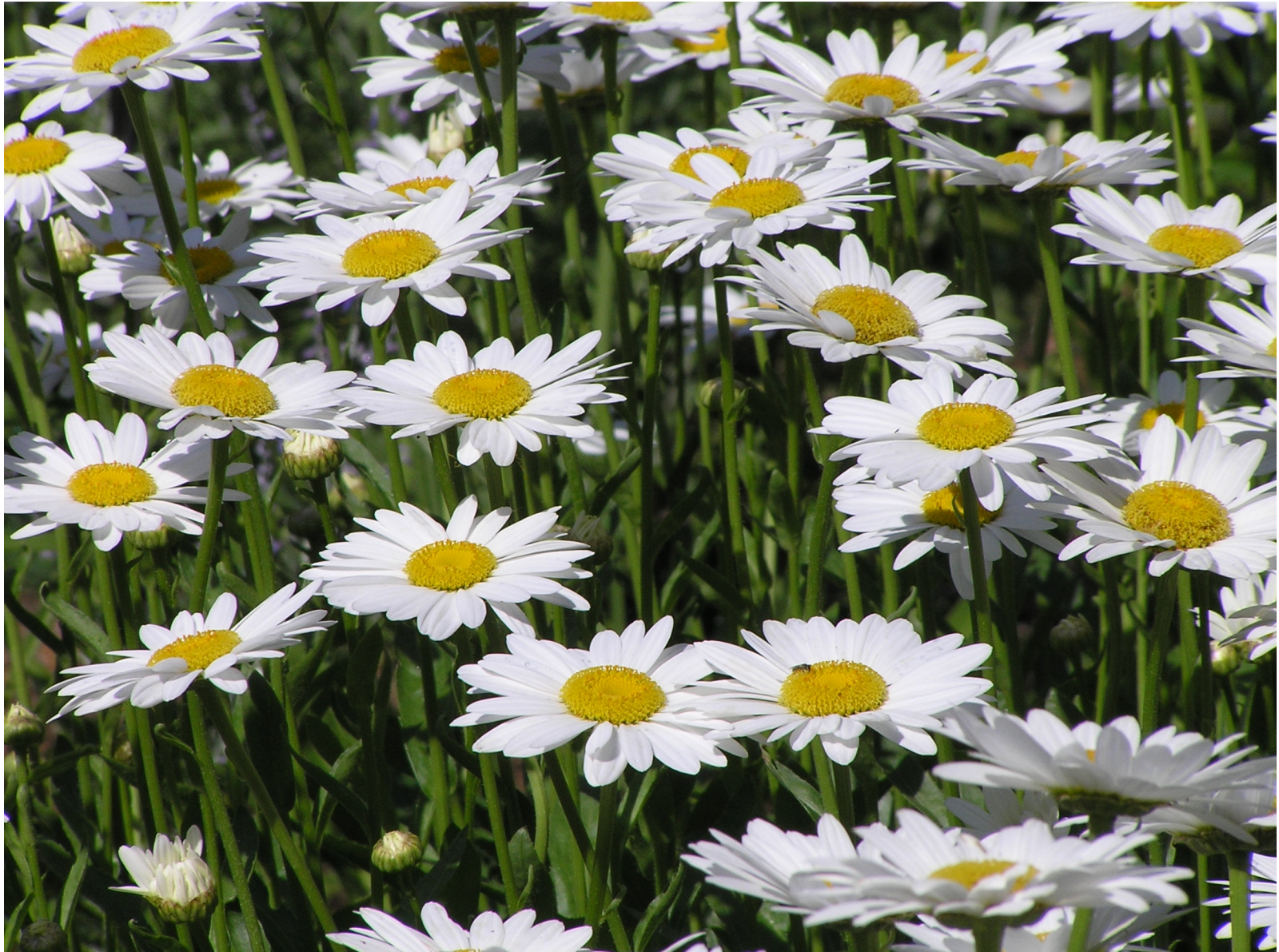
Photo: Daisies. June, 2010.