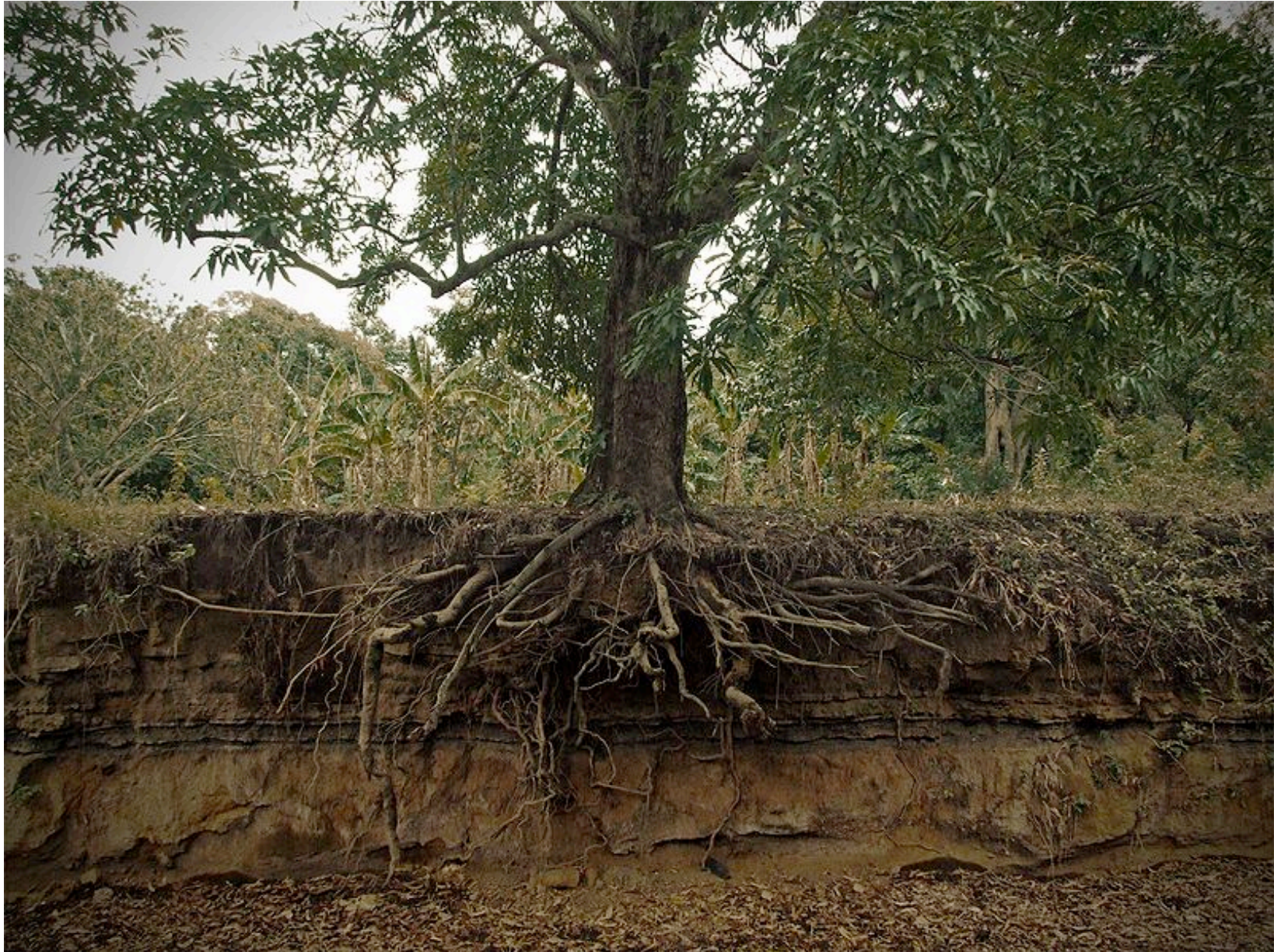
Photo: Cross section of a trees' roots. September, 2009.