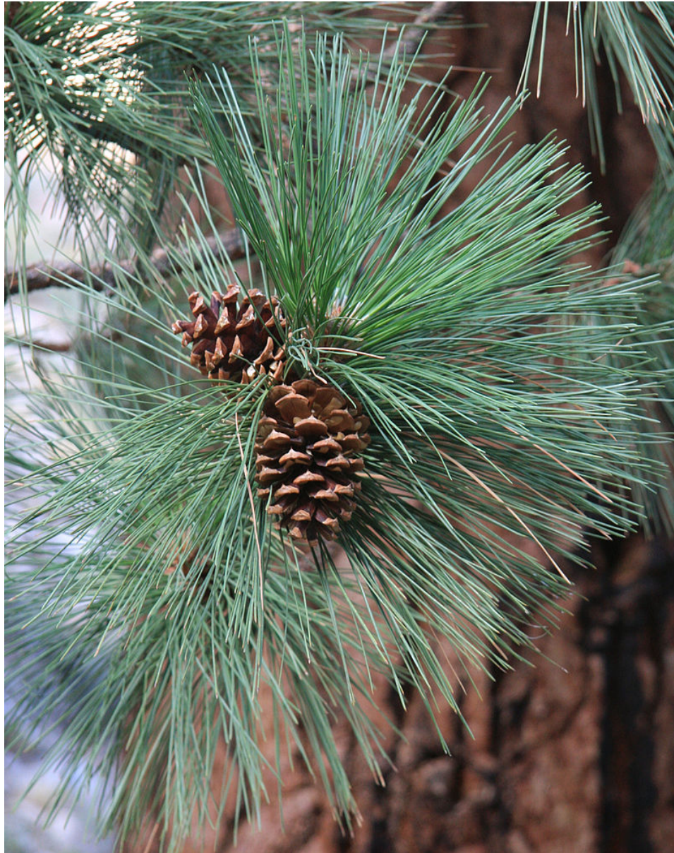
Photo: Jeffrey pine ( Pinus jeffreyi ), long needles (bundles of 3) and cones. Lower Rock Creek canyon at about 6200ft, Mono County, California. July, 2010. ©2010 by Dcrjrs in en:wikipedia. www.creativecommons.org/licenses/by-sa/3.0 .