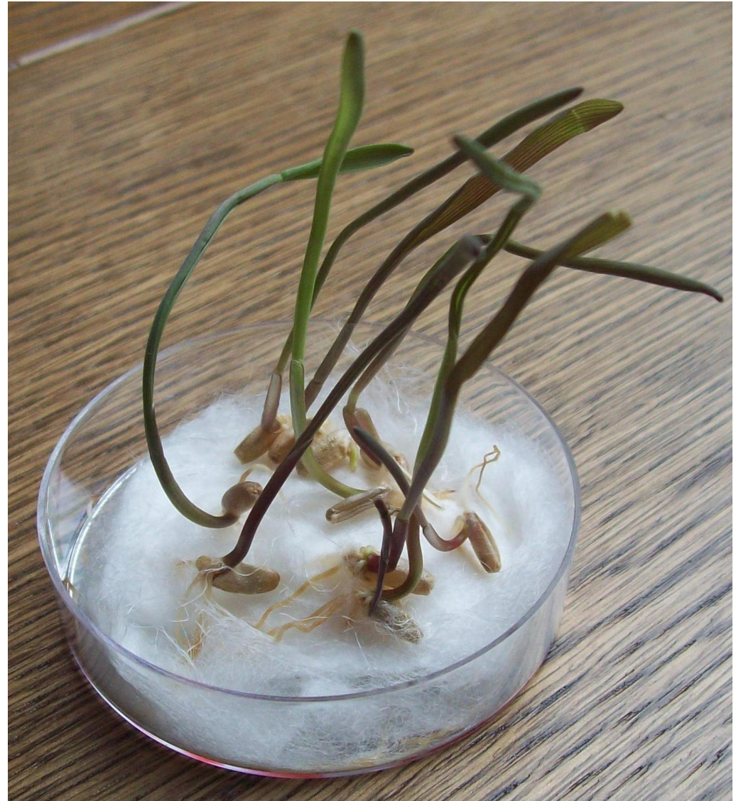
Photo: Garlic growing. June, 2005. Photo: Rye seeds germinating. August 2009.