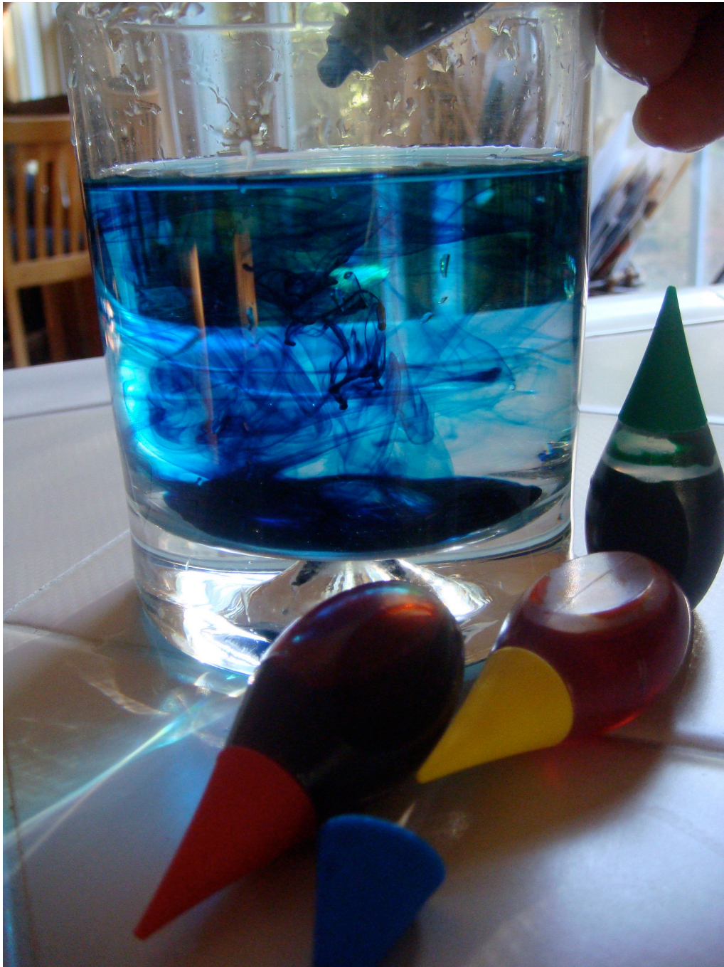
Photo: Blue food coloring in cup of water. November, 2010. ©2010 by Alice L. Folkins. Used with permission.