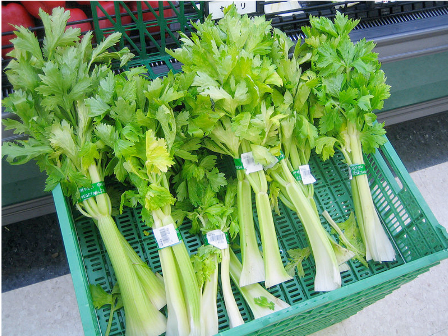
Photo: Celery for sale. July, 2007. Released into public domain by Lombroso.