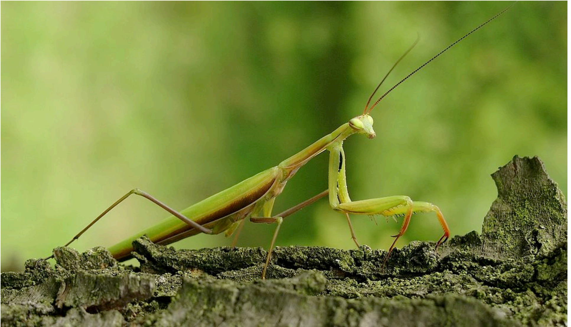
Photo: Praying mantis. February, 2005. ©2005 by Mestka in en.wikipedia. Some rights reserved http://creativecommons.org/licenses/by-sa/3.0/deed.en