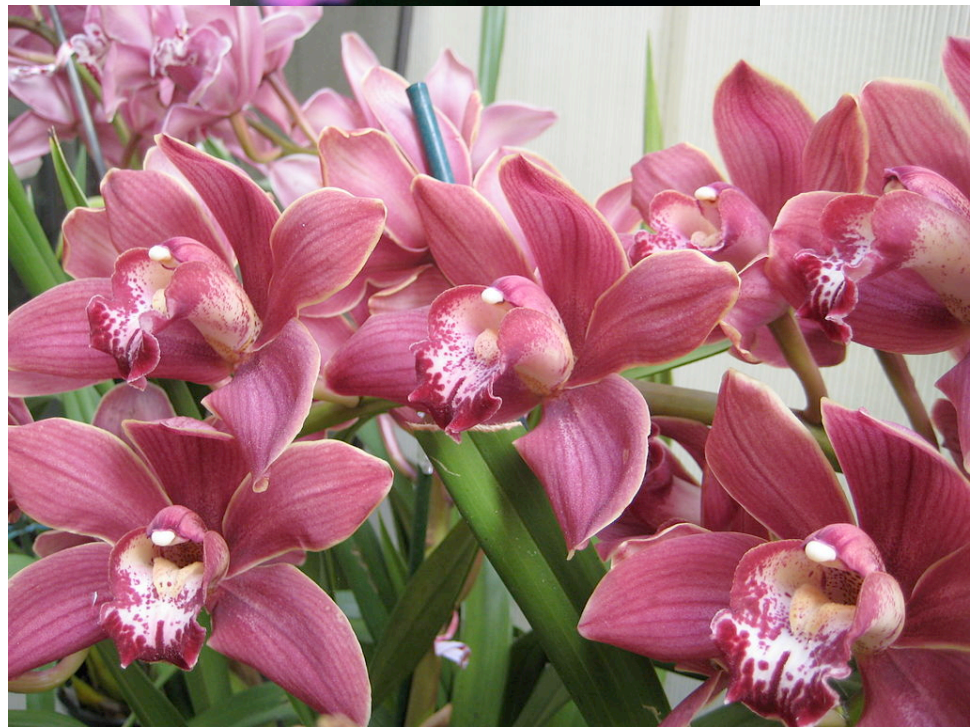
Photo: Orchid growing in a greenhouse at Longwood Garden in PA. March, 2010.

Photo: Dancing Clown Orchid. January, 2008.