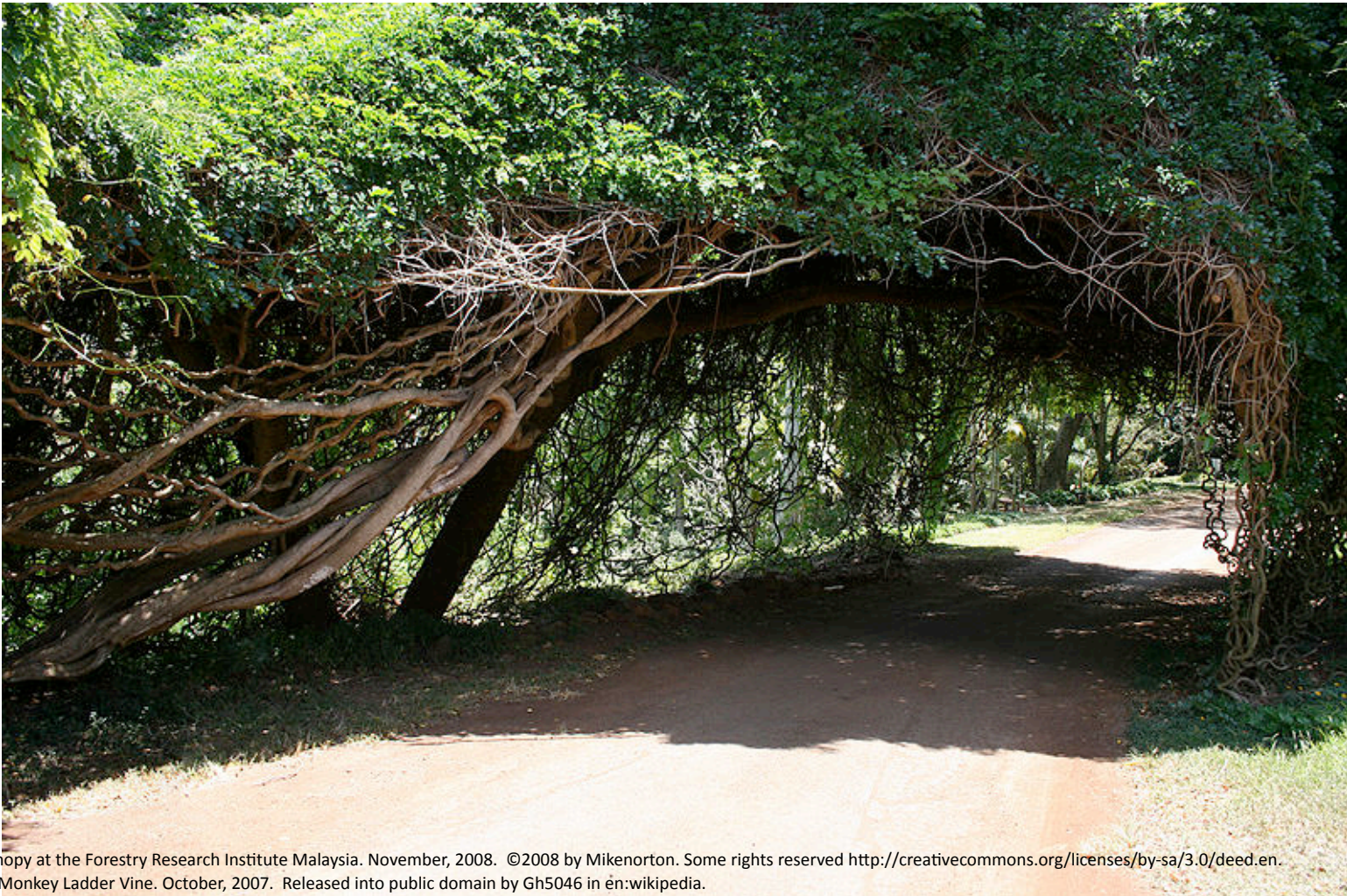
Photo: Rain forest canopy at the Forestry Research Institute Malaysia. November, 2008. Photo: A picture of a Monkey Ladder Vine. October, 2007.

Example: The branches and leaves made a roof over the road.