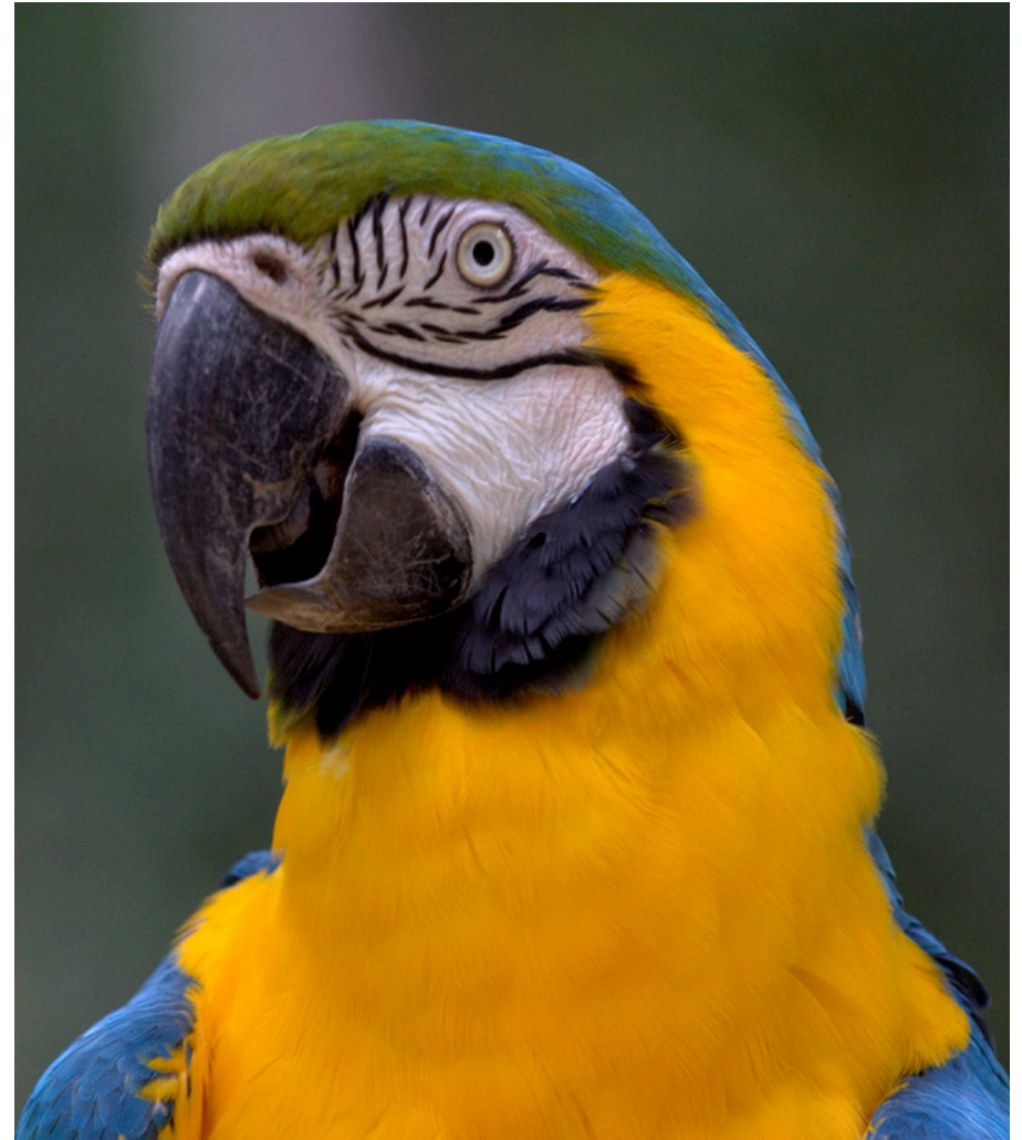
Photo: Scarlet Macaw ( Ara macao ). Two at Lowry Park Zoo, Tampa, Florida, USA. February, 2008. ©2008 by Matthew Romack. Some rights reserved http://creativecommons.org/licenses/by/2.0/deed.en Photo: Blue-and-gold Macaw at Mountain Bird Park & Nature Reserve at Macaw Mountain Bird Park and Nature Reserve, Copan, Honduras. February, 2008. ©2008 by Lauri Väin. Some rights reserved http://creativecommons.org/licenses/by/2.0/deed.en