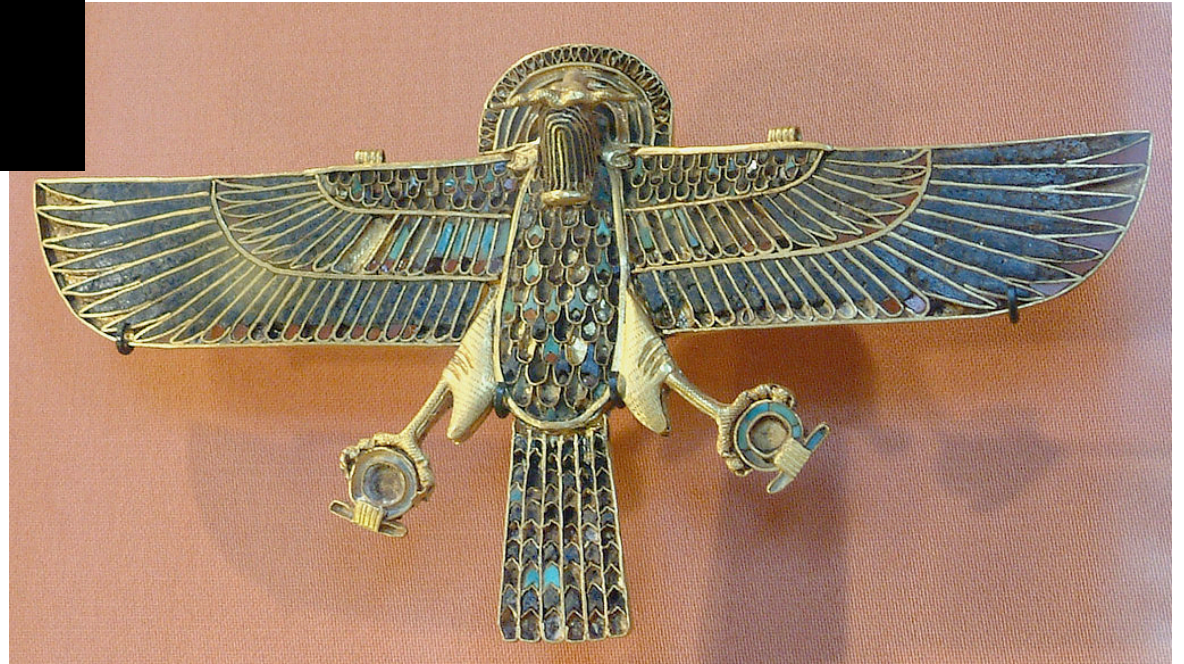
Photo: This Middle Kingdom pectoral was found in the tomb of Princess Sit-Hathor Yunet. October 2007. Photo: Amulet representing a ram-headed falcon. Ancient Egypt, 1254 BC (26th year of the reign of Ramses II), found in the tomb of an Apis bull in the Serapaeum of Memphis at Saqqara. July 2004.