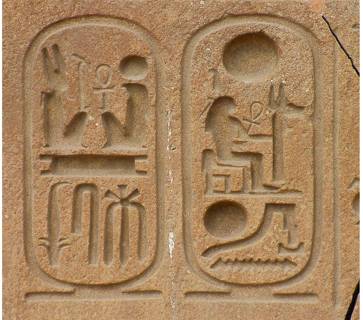
Photo: Egyptian Hieroglyphics. March 2006.

Photo: Ramses II's cartouches at Tanis. October, 2006.