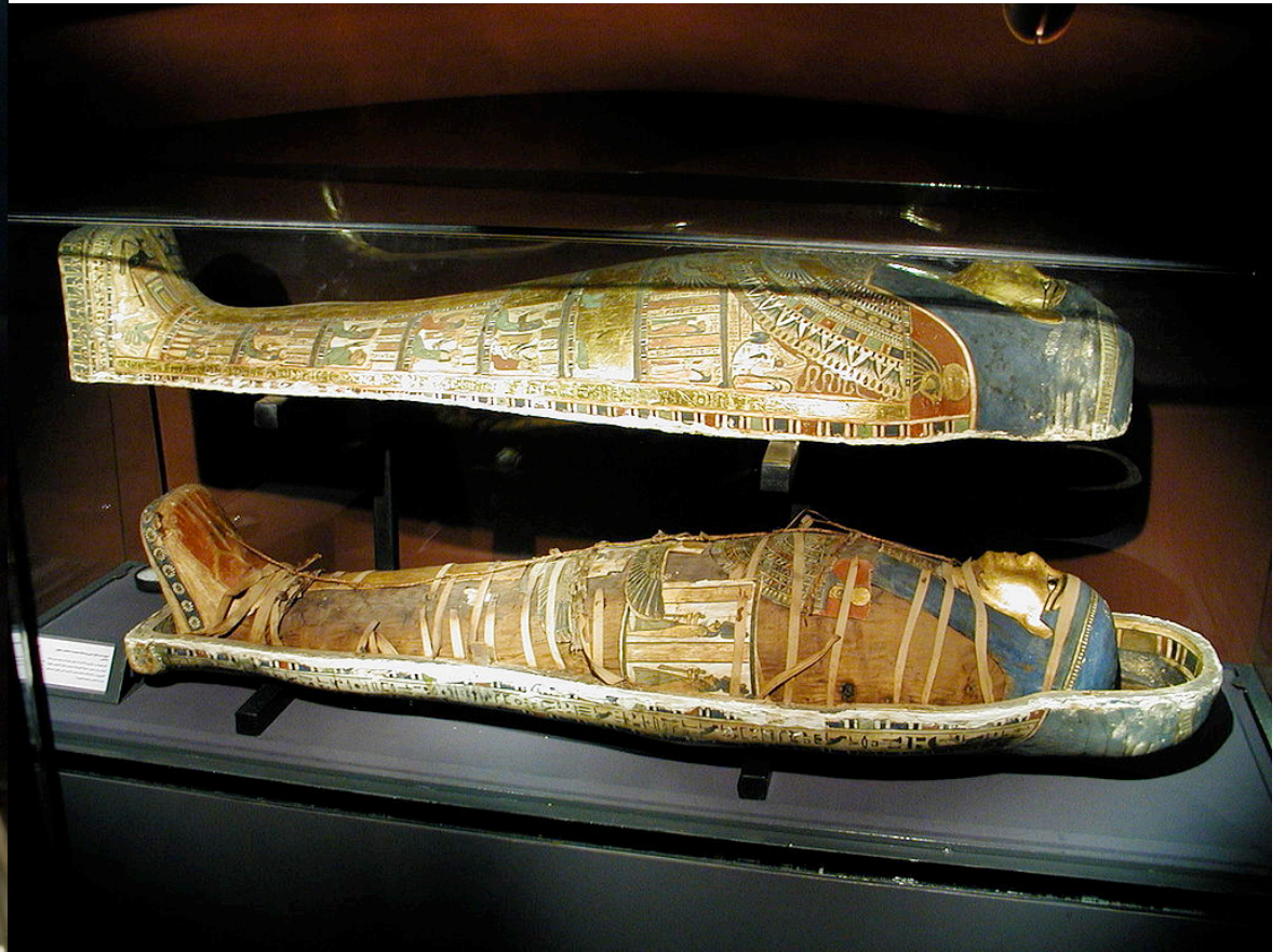
Photo: Tutankamen's famous burial mask, on display in the Egyptian Museum in Cairo. December 2003. ©2003 by Bjørn Christian Tørrissen. Some rights reserved http://creativecommons.org/licenses/by-sa/3.0/deed.en Photo: Sarcophagus and mummy, painted wood, Late Period. National Museum of Alexandria, Egypt. May 2006. ©2006 by Gérard Ducher (user:Néfermaât). Some rights reserved CC-BY-SA-2.5 ( www.creativecommons.org/licenses/by-sa/2.5 ).