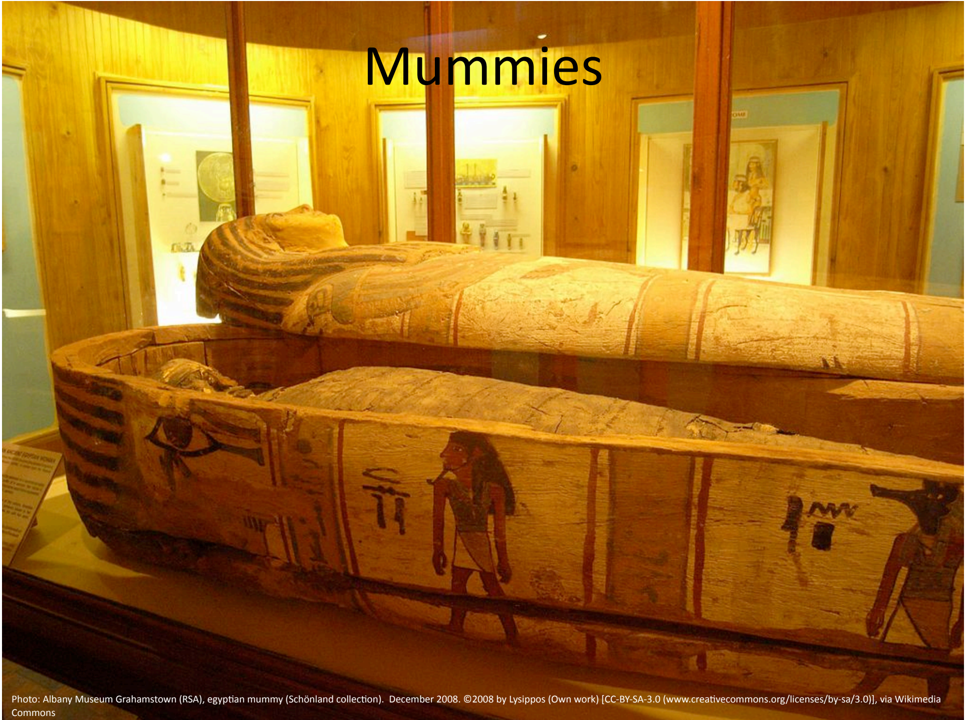
Photo: Albany Museum Grahamstown (RSA), egyptian mummy (Schönland collection). December 2008.