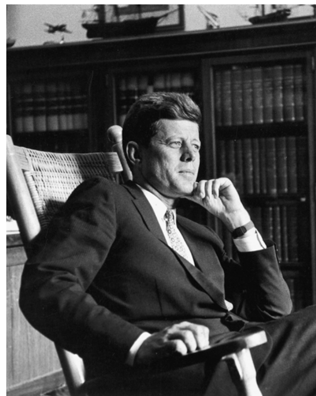
Photo: John Herschel Glenn Jr. is a former American astronaut, Marine Corps fighter pilot, and United States Senator. October, 1998.