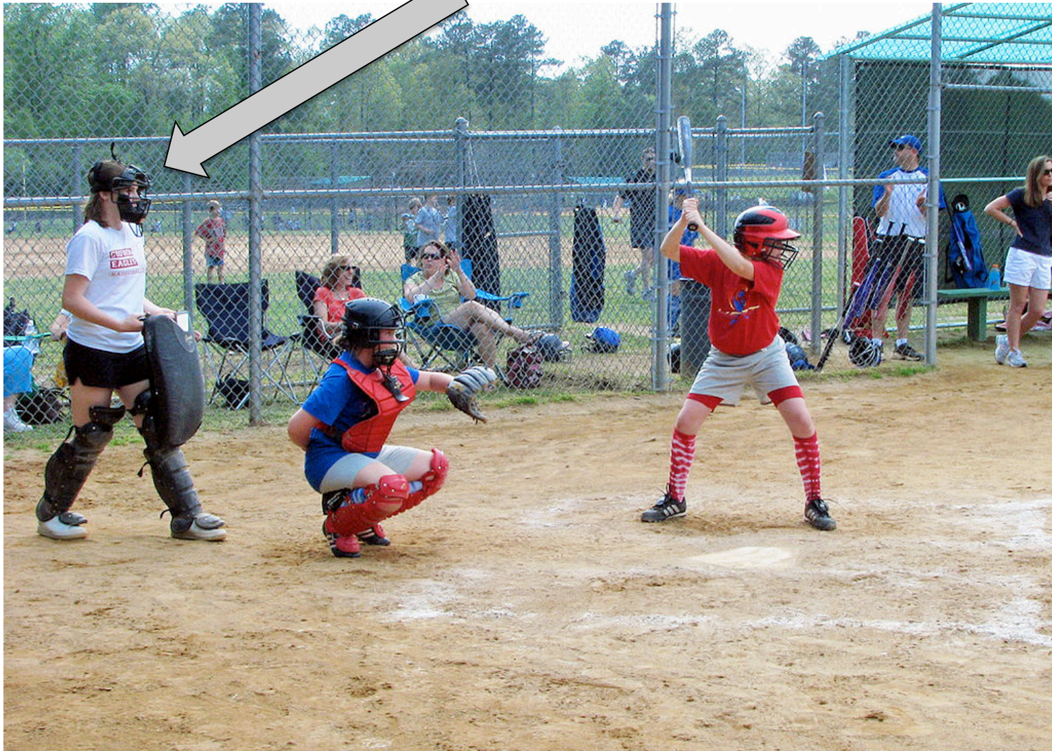
Photo: The batter, catcher, and umpire in a girls softball team. April, 2008.