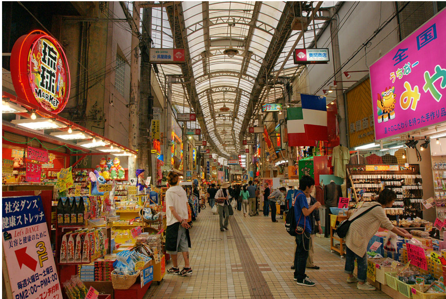
Photo: Heiwa Shopping Avenue in Naha, Okinawa prefecture, Japan. March, 2003. ©2003 by 663highland. Some rights reserved www.creativecommons.org/licenses/by-sa/3.0 .