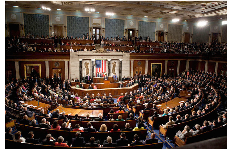
Photo: President Barack Obama and Vice President Joe Biden. Washington, D.C., March, 2009. Released into public domain by the U.S. federal government.