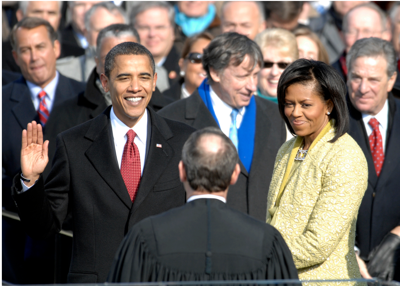
Photo: With his family by his side, Barack Obama is sworn in as the 44th president of the United States. January, 2009.