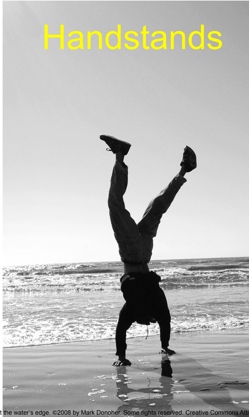
Photo: A young man on beach doing a handstand at the water's edge. ©2008 by Mark Donoher. Some rights reserved. Creative Commons Attribution 2.0 Generic.