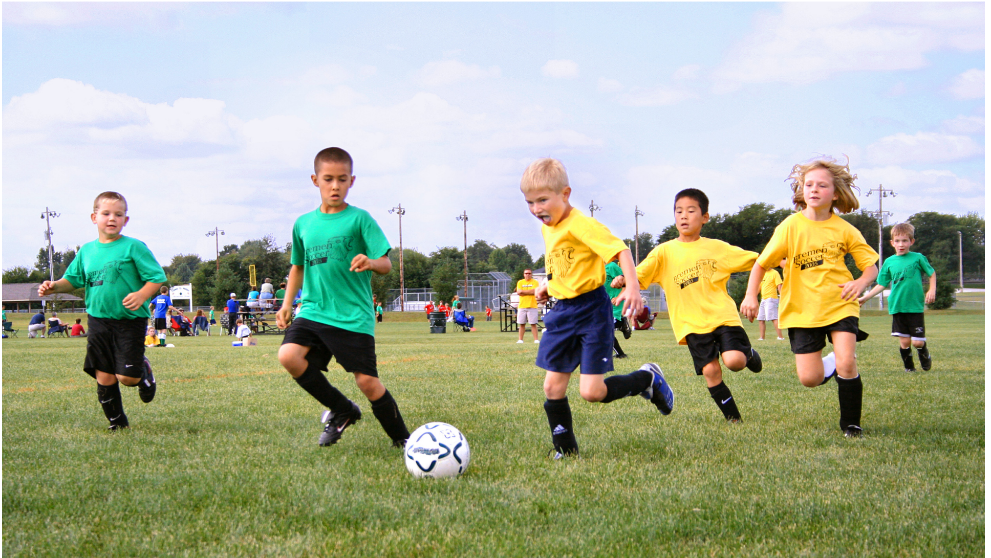
Photo: Youth soccer in small town USA. Taken by Derek Jensen. Image released into public domain