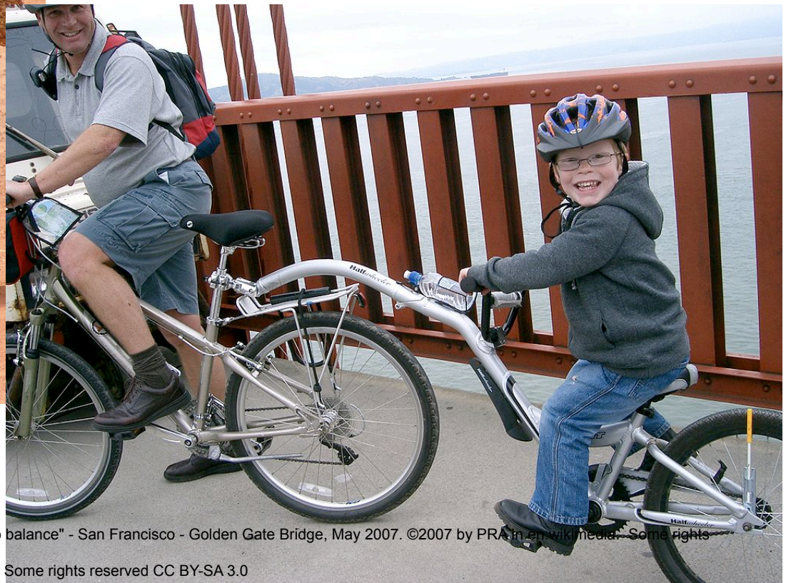
Photo: Half Wheeler "is a kids bike that hooks up to an adult bike to help teach kids to balance" - San Francisco - Golden Gate Bridge, May 2007.