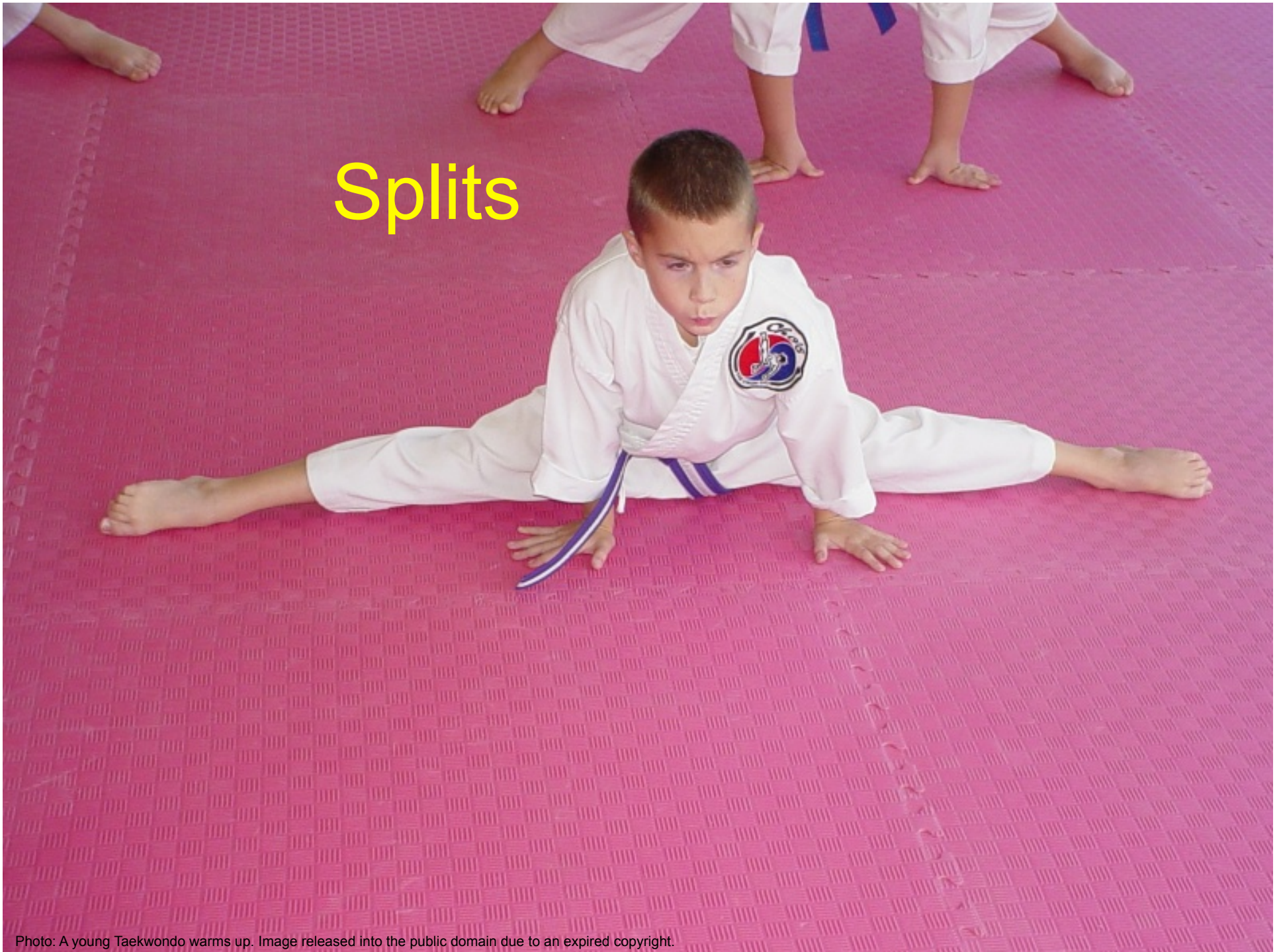
Photo: A young Taekwondo warms up. Image released into the public domain due to an expired copyright.