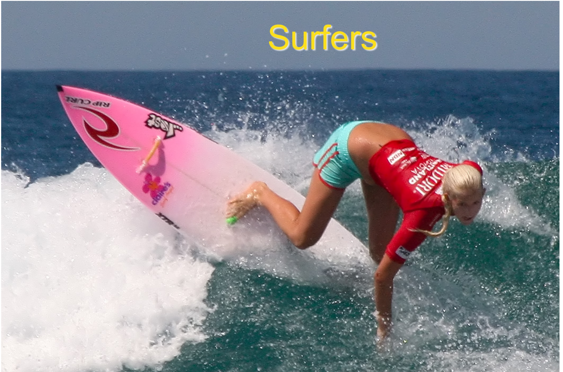
Photo: Bethany Hamilton, 2007. Image released into public domain by its author.