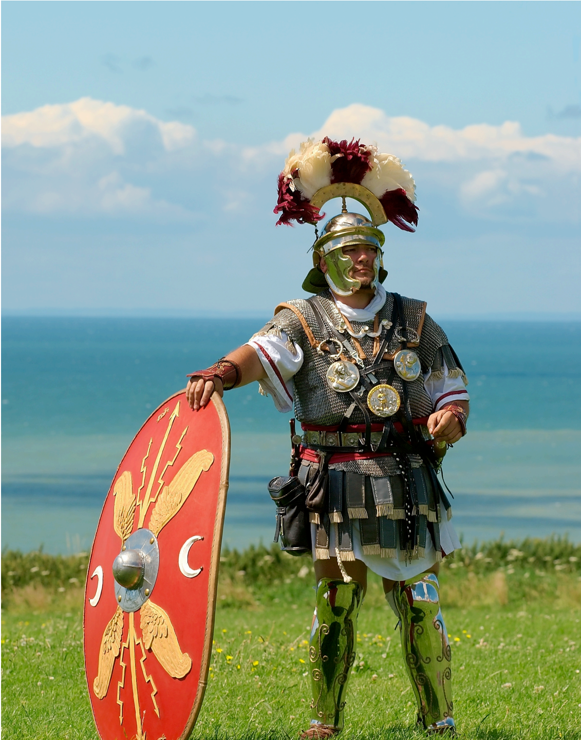
Photo: Centurion historical reenactment Boulogne sur mer.