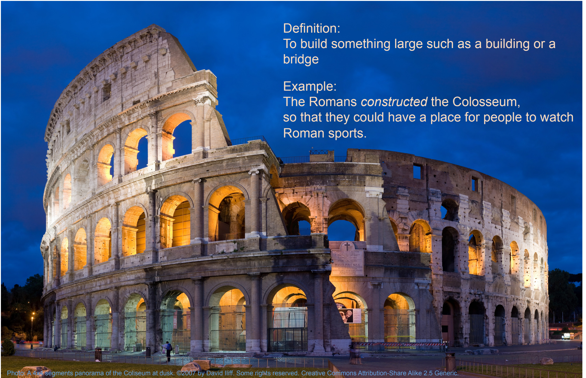
Photo: A 4x4 segments panorama of the Coliseum at dusk.

The Romans constructed the Colosseum, so that they could have a place for people to watch Roman sports.