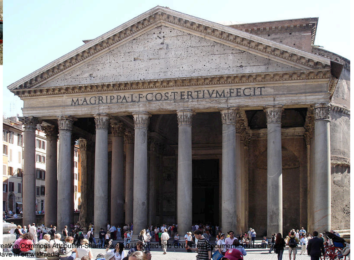
Photo: Pantheon in Rome, Italy. Photo: Roman theatre at Metropolis 2007.