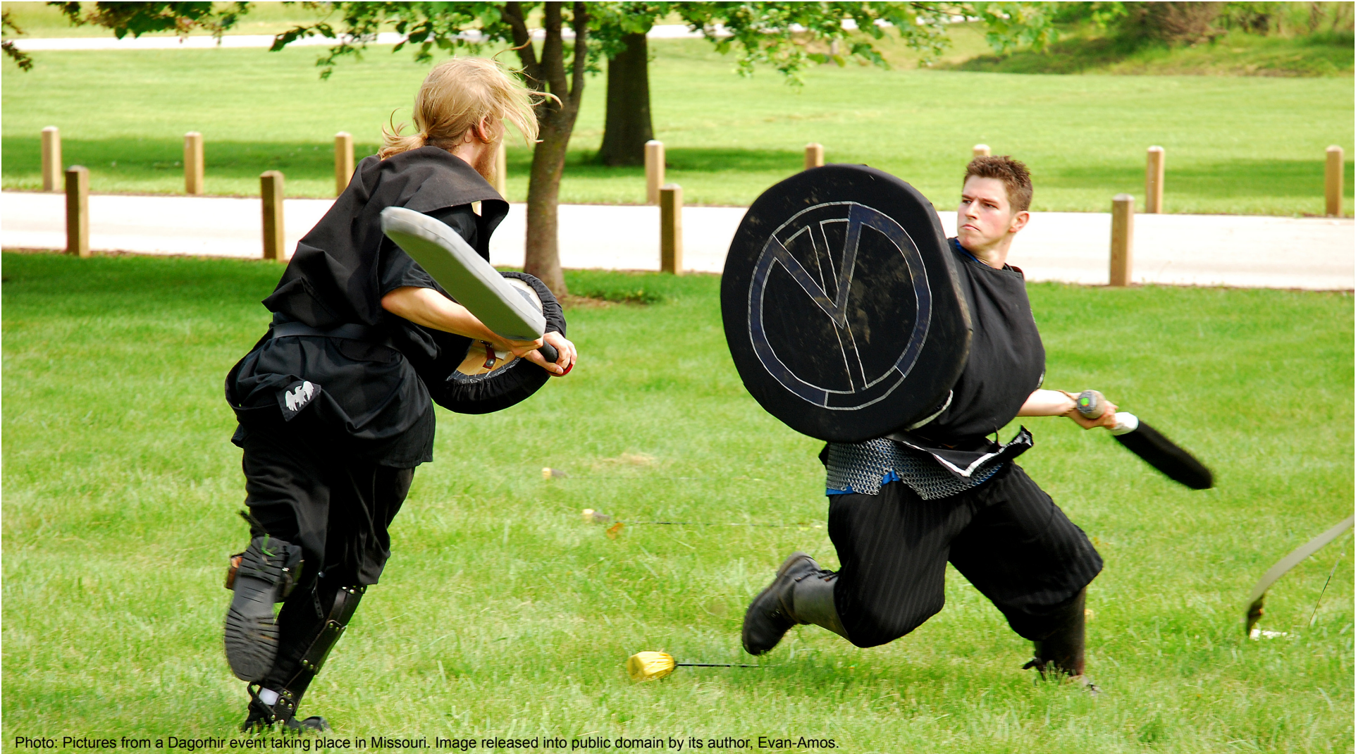
Pictures from a Dagorhir event taking place in Missouri.

The Roman Empire fought many wars and therefore had many enemies .