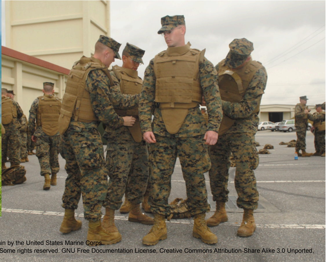
Photo: Marines with Security Company, 2007. Image released into the public domain by the United States Marine Corps.