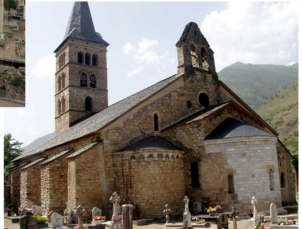
Photo: Roman Church in Arthies, Vall de Aran, Spain. July 2009.

Example: Roman engineers built giant buildings and complex systems of water transportation