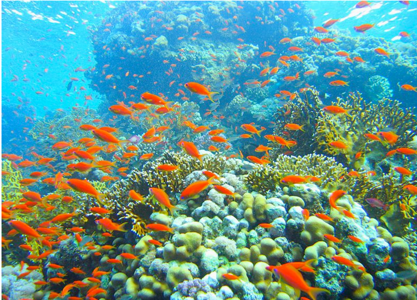
Photo: Coral reef in Ras Muhammad. February, 2006.

Corresponds to QuickReads Level D, book 1, Life Science, Animal Communities