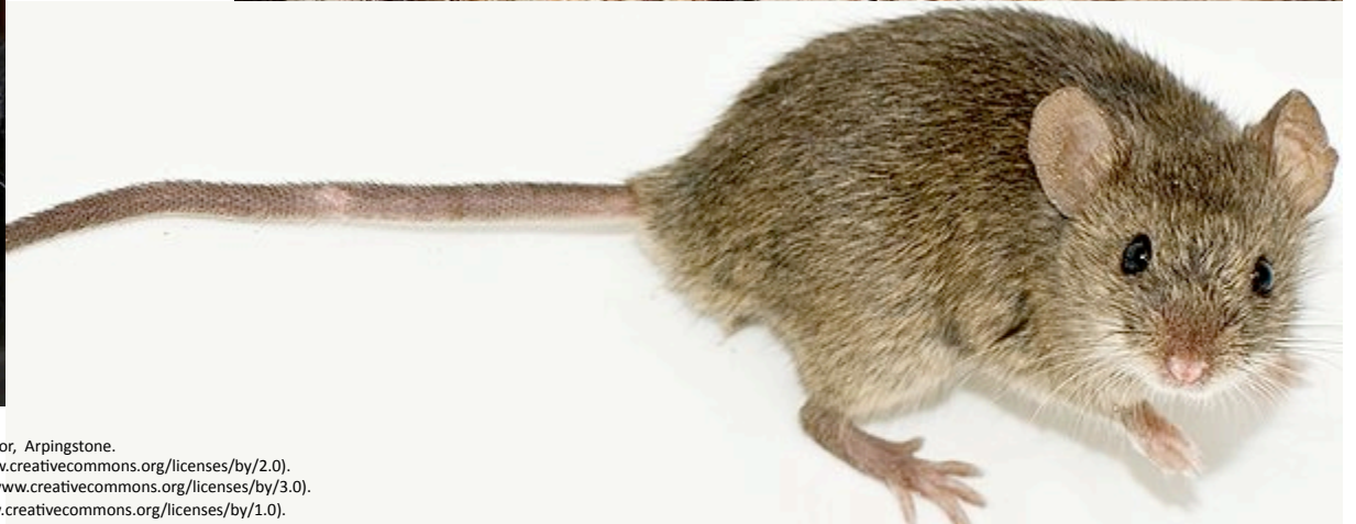
Top left: Bristol zoo. December, 2005. Taken by Adrian Pingstone. Released into public domain by its author, Arpingstone. Bottom left: Young guinea pig. February, 2009. © 2009 by Jay Reed. Some rights reserved CC-BY-2.0 ( www.creativecommons.org/licenses/by/2.0 ). Top right: Hopi chipmunk. June, 2006. © 2006 by Mdf in en:wikimedia. Some rights reserved CC-BY-3.0 ( www.creativecommons.org/licenses/by/3.0 ). Bottom right: Mouse. November, 2008. © 2008 by George Shuklin. Some rights reserved CC-BY-1.0 ( www.creativecommons.org/licenses/by/1.0 ).