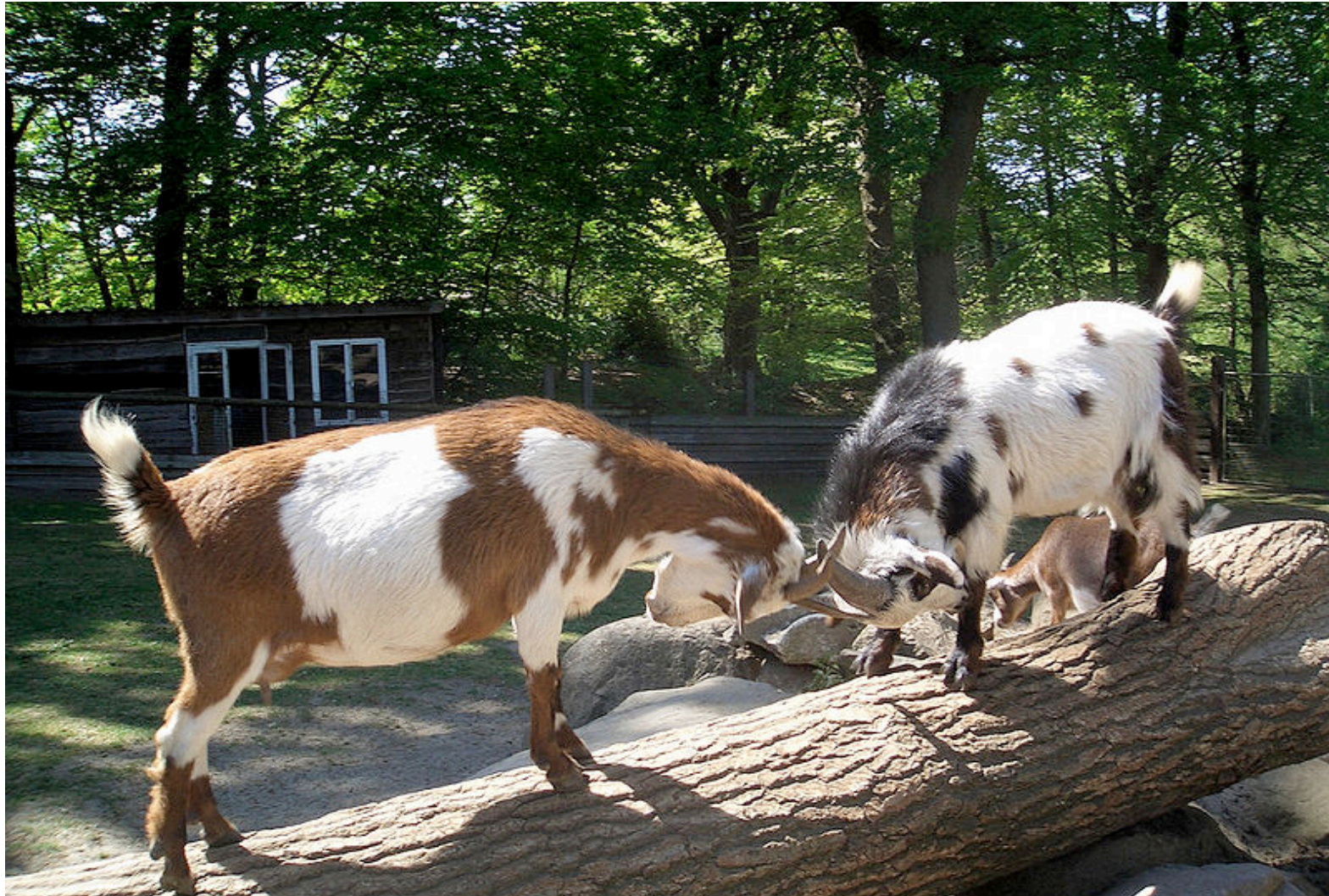
Photo: Goats butting heads. May, 2007.

Example: These animals use their horns to defend themselves.