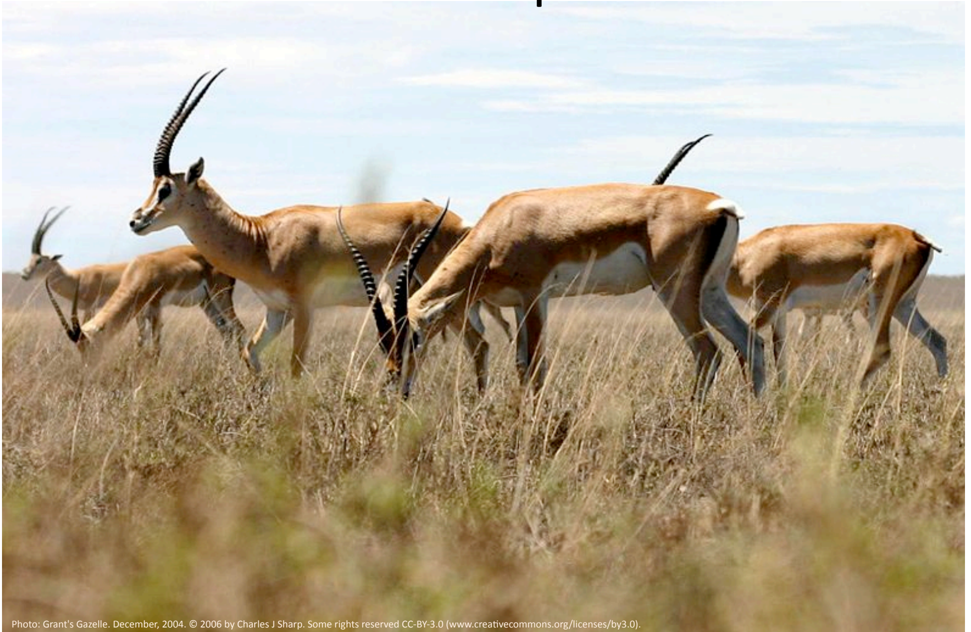
Photo: Grant's Gazelle. December, 2004.