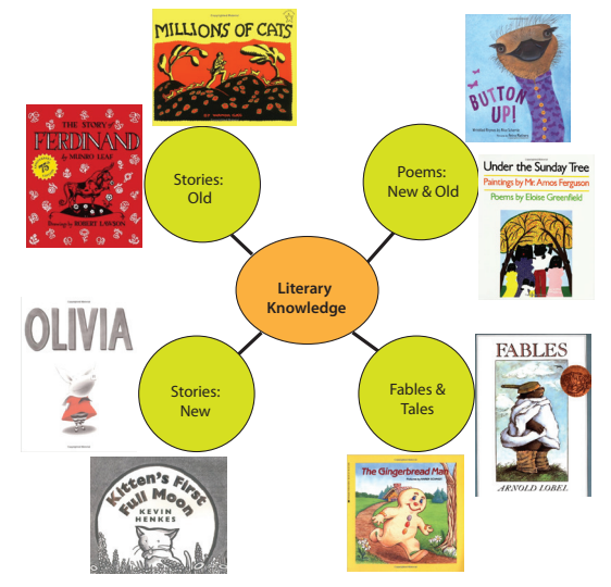
Figure 1 Examples of read aloud books that develop literary knowledge

• Develop content by reading aloud books that have interrelated content: Rather than reading a single book on the orchestra (e.g., Zin, Zin, Violin ), additional books such as The Philharmonic Gets Dressed , and Ah , Music can create a strong foundation of knowledge about orchestral music.