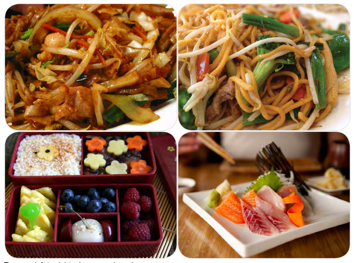
Top row, left to right: chop suey, lo mein Bottom row, left to right: bento, sashimi