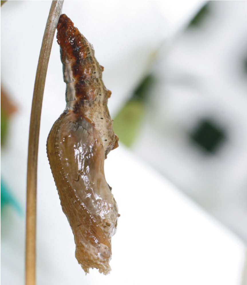
Photo: Pupa of Gulf Fritillary butterfly ( Agraulis vanillae ) in its cocoon, near Pompano Beach, Florida. © 2007 by Korall at sv.wikipedia. Some rights reserved ( http://creativecommons.org/licenses/by-sa/3.0 ).

Whenever you are outdoors this summer, you are likely to see moths and butterflies flying about. During the long warm days of summer, these insects search for food, mate, and lay eggs. Both moths and butterflies pass through four stages of growth before they become adults. Moths and butterflies look very different from one stage of growth to another. Wings do not appear until the very last stage. You can see examples of each of the stages in a nearby garden, a park, or a piece of land that is overgrown with weeds. You will have to look very carefully but the wait will be worth it. Whatever the stage of growth, these insects are special.