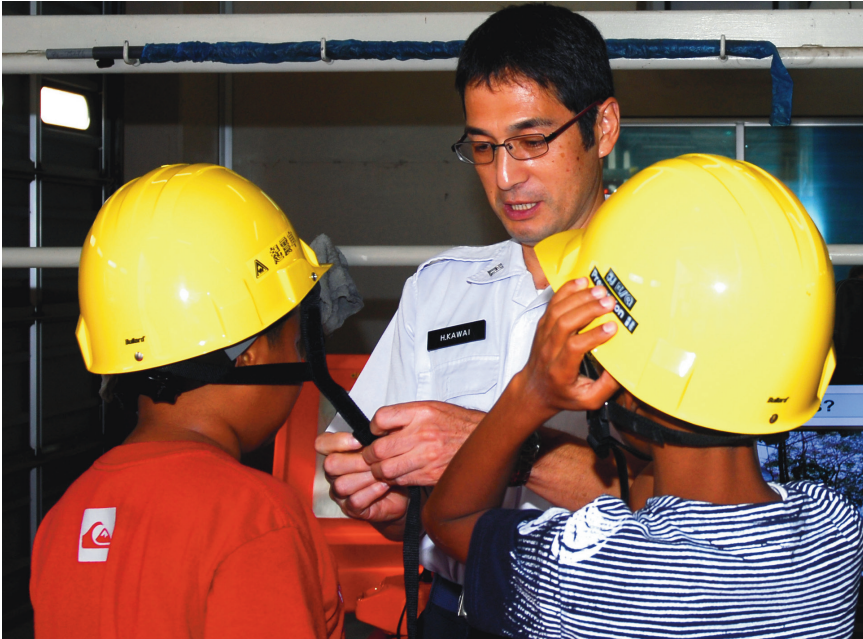
Photo: Students put on safety helmets before entering an earthquake simulator in Yokosuka, Japan, October 2008.

Your head is usually exposed to the sun when you're outdoors in summer. That's why smart people cover their heads with hats and caps to protect them from the sun. Hats and caps protect your head from sunburn and possible sunstroke. But hats and caps do more than protect your head. They also provide shade for your eyes. You can see more clearly in the sunshine when you're wearing a hat or cap.