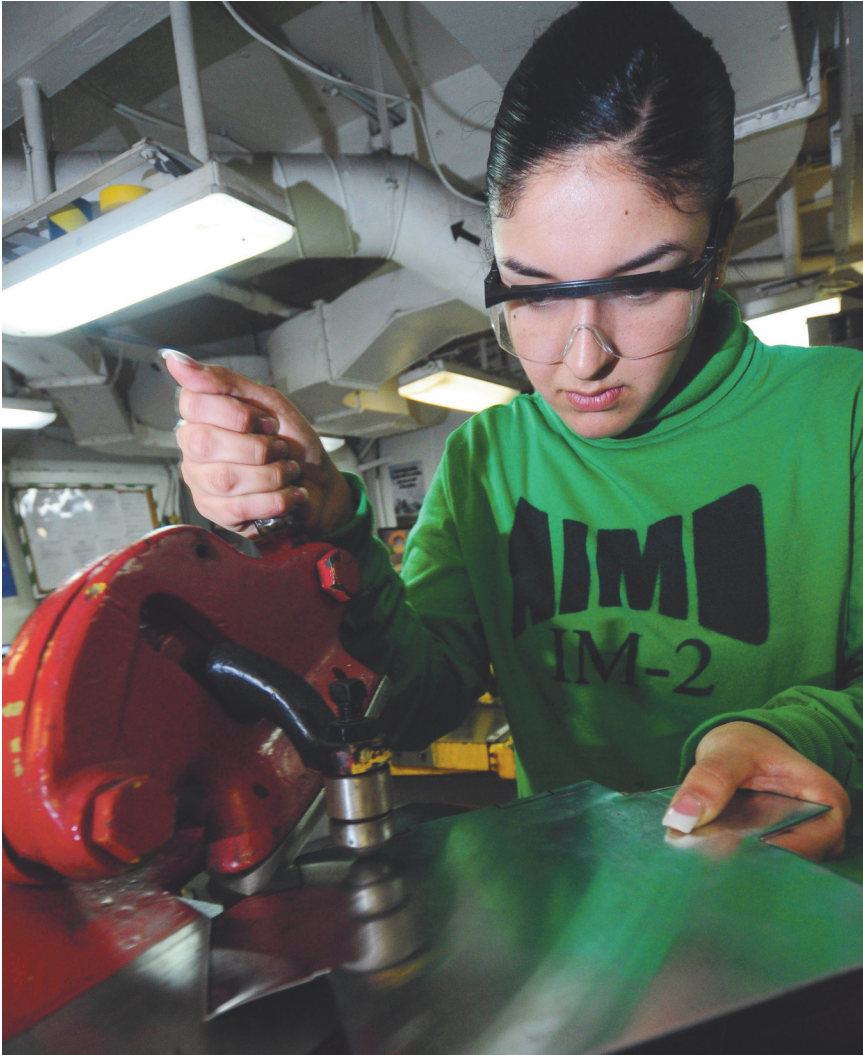
Photo: An aviation structural mechanic fabricates metal parts aboard an aircraft carrier near the California coast, February 2009.