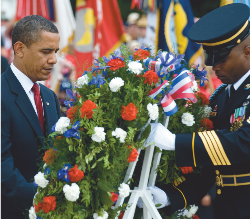
Photo: President Obama lays a wreath at the Tomb of the Unknowns at Arlington National Cemetery, Memorial Day 2009.